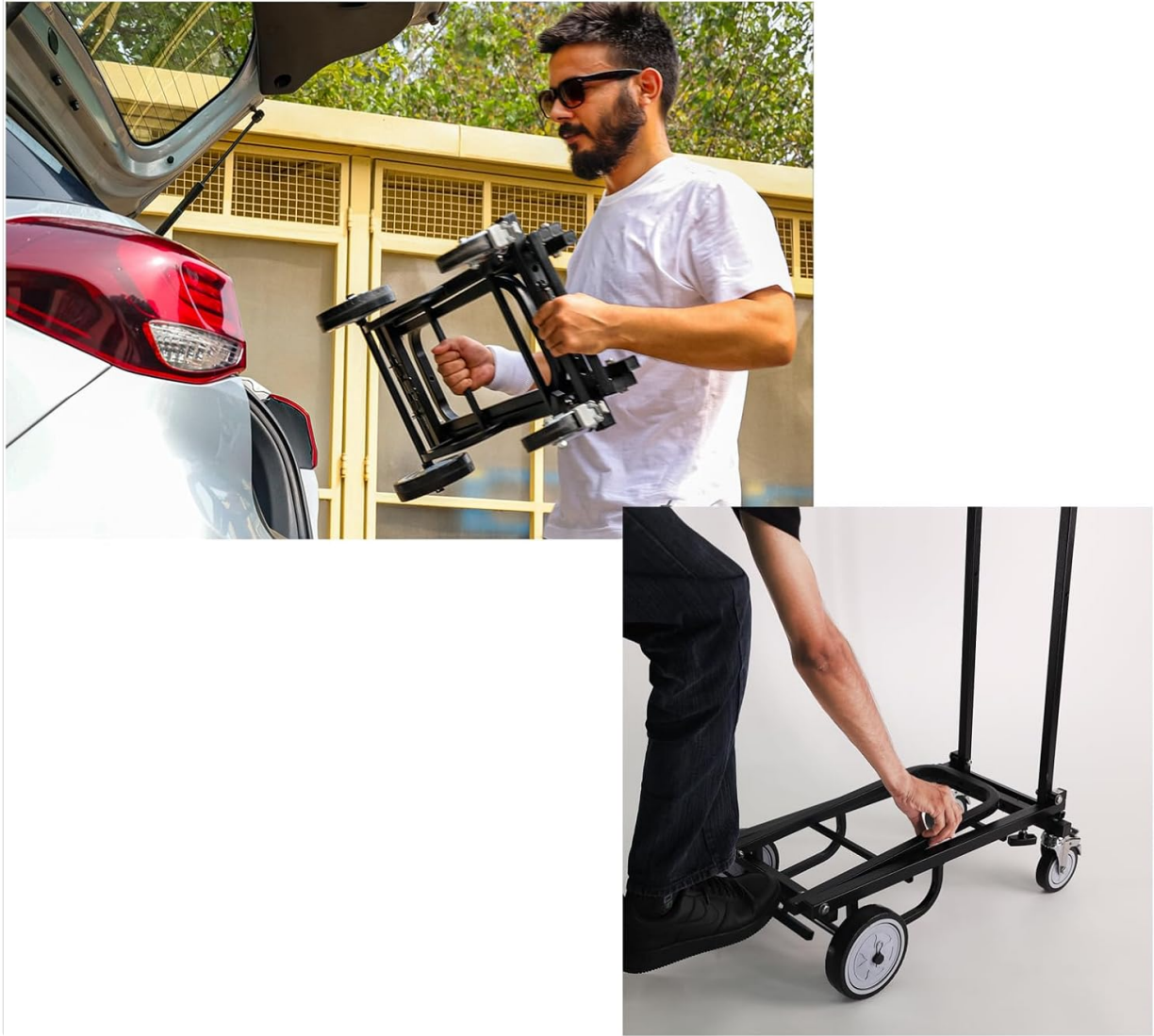
Image 5.3: The cart being folded and stored, demonstrating its compact nature.