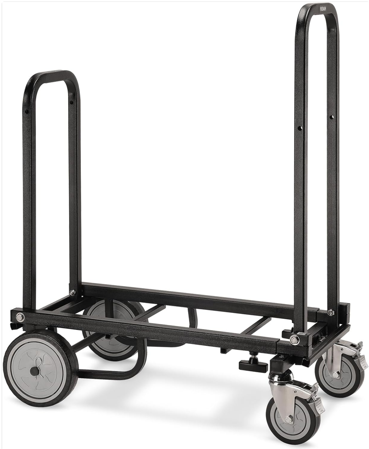
Image 1.1: The PROAIM Vanguard Nano 8-in-1 Adjustable Foldable Cart in its standard configuration.