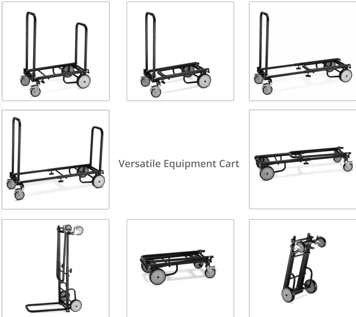
Image 2.1: Visual representation of the eight possible configurations of the Vanguard Nano Cart.