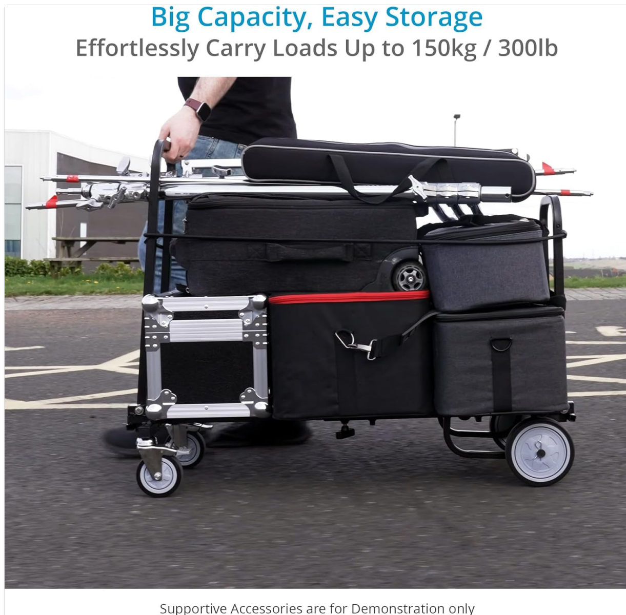
Image 5.1: The cart loaded with various equipment, demonstrating its capacity.

Experiment with different handle and platform adjustments to find the optimal configuration for your specific load.