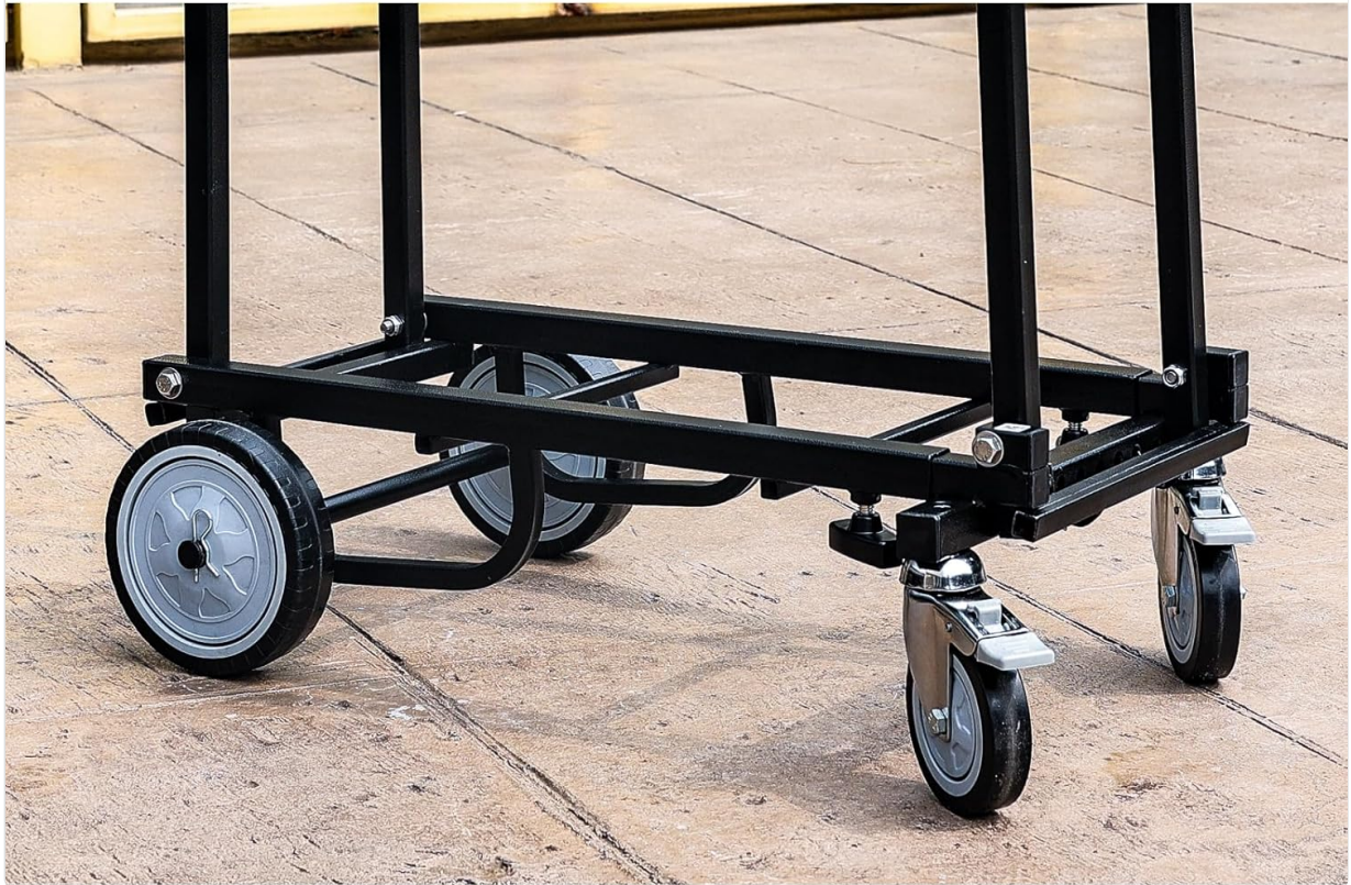
Image 5.2: Detail of the cart's caster wheels and the locking mechanism on the front wheels.