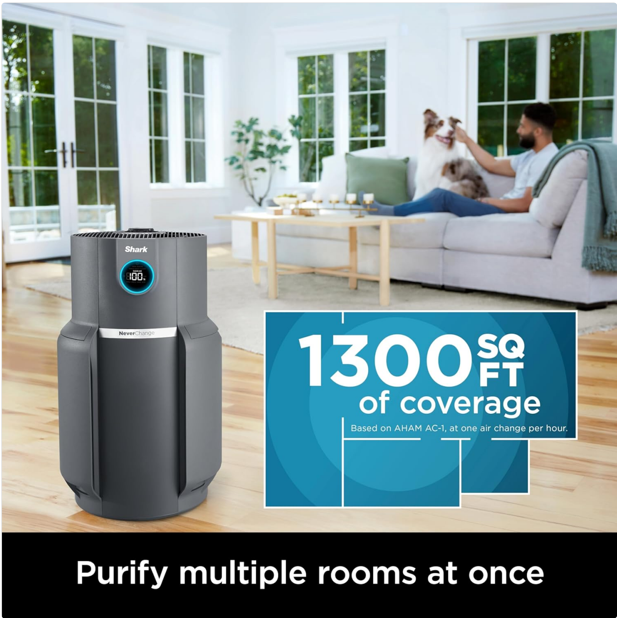
Image 5.2: The air purifier provides 1300 sq ft of coverage, suitable for purifying multiple rooms simultaneously.