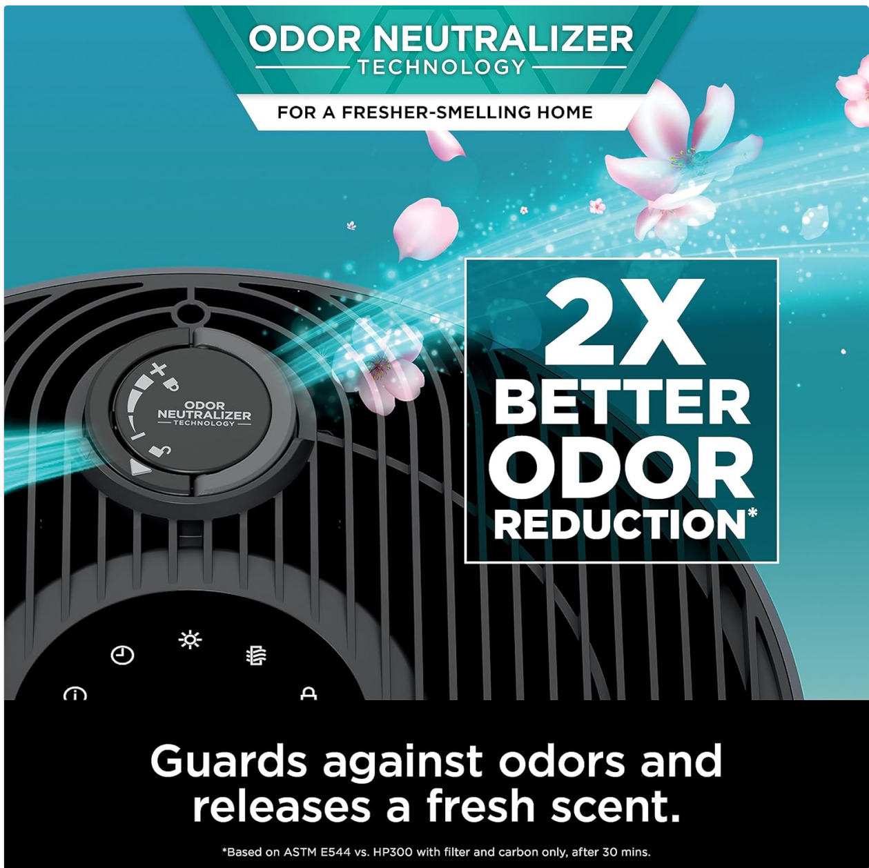
Image 6.4: The Odor Neutralizer Technology cartridge helps reduce odors and provides a fresh scent.