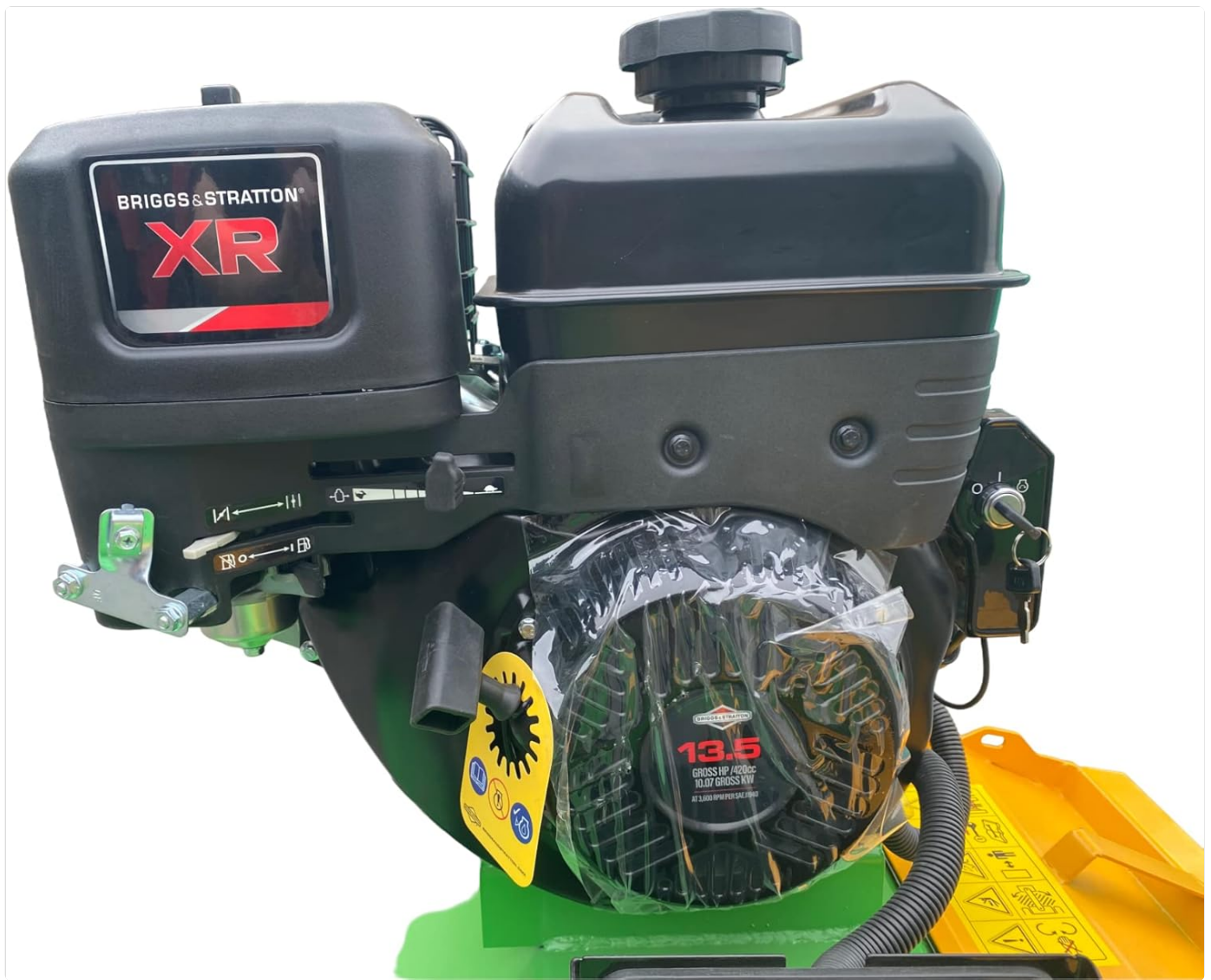
Image: A detailed view of the Briggs & Stratton XR2100 engine, highlighting its components and branding. This is the power unit for the flail mower.