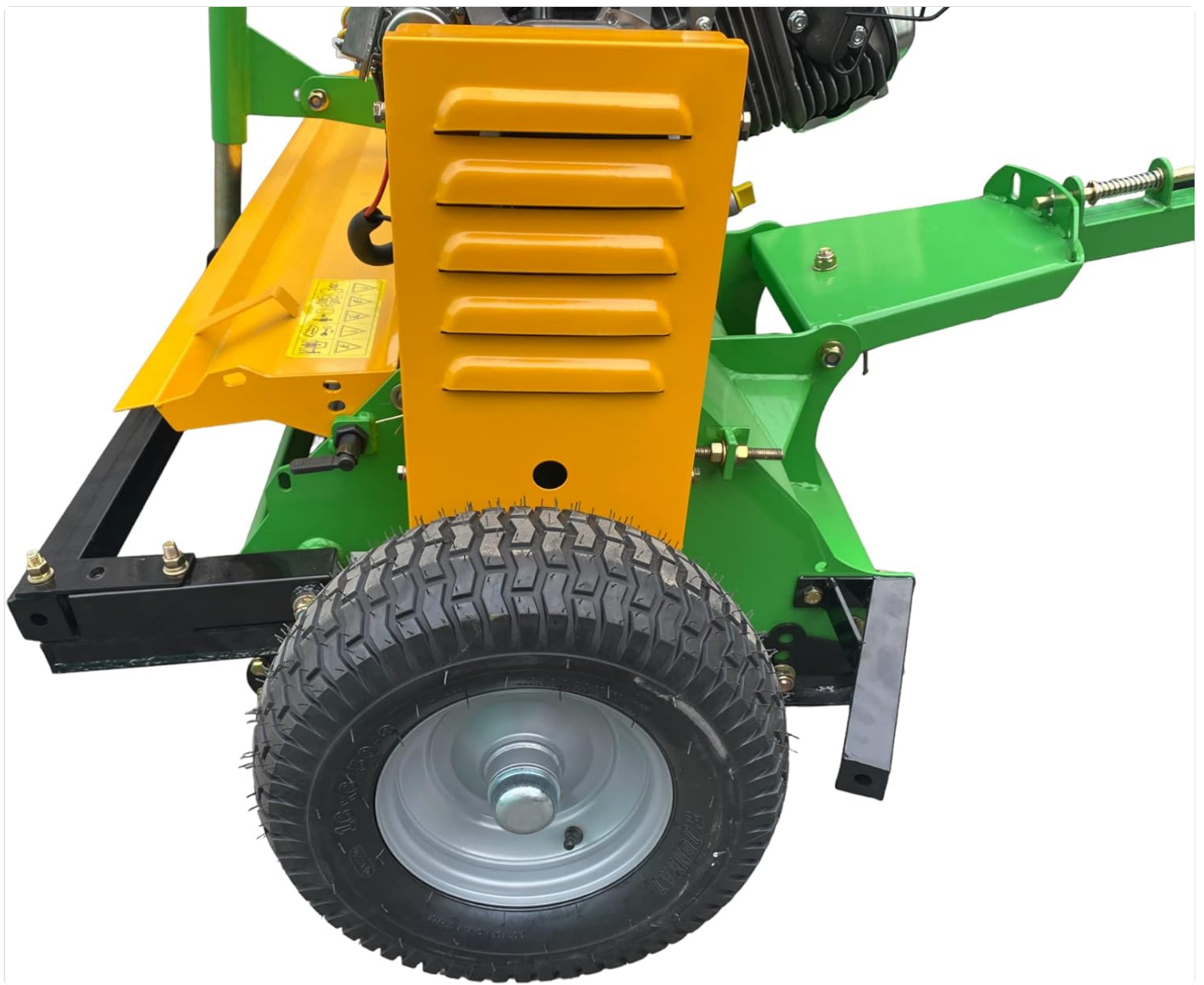
Image: A close-up view of one of the wheels attached to the flail mower, showing the robust tire and axle assembly. This illustrates the wheel mounting point.