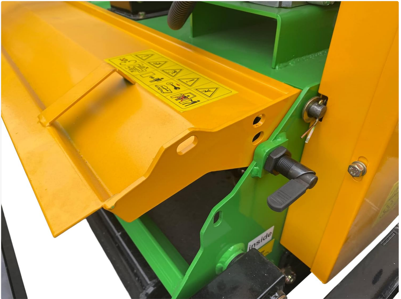
Image: Close-up of the adjustable side guard on the flail mower, which can be opened for maintenance or cleaning access to the flail rotor.