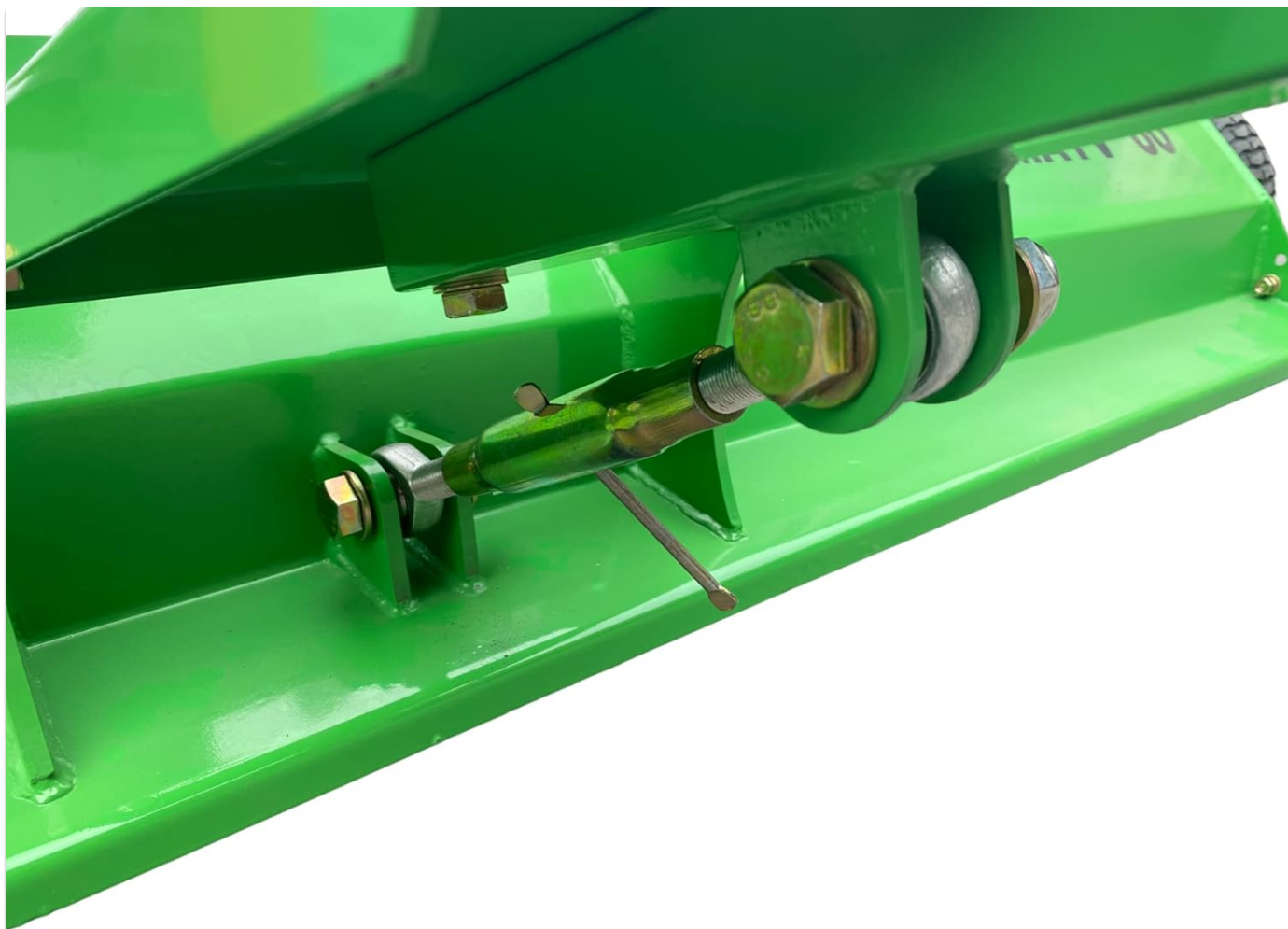
Image: Close-up of the adjustable drawbar mechanism, illustrating the pin and hole system for changing the offset angle. This allows for flexible towing positions.