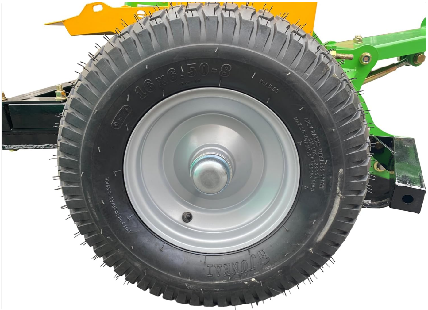
Image: Detailed close-up of a single wheel, highlighting the tire tread and rim. This provides a clear view of the wheel's construction.