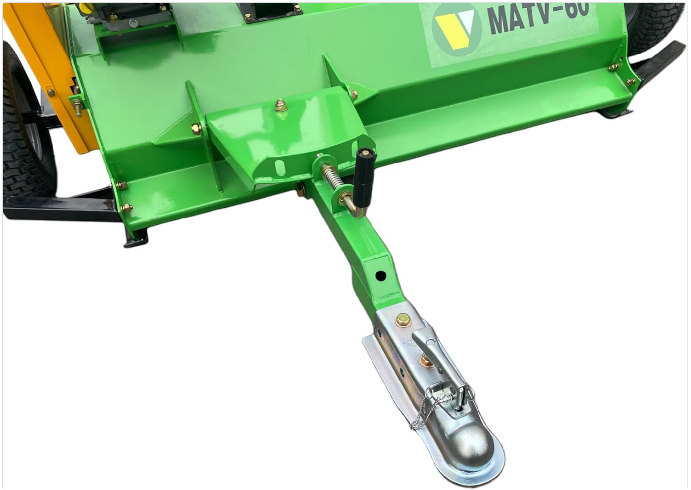
Image: A detailed view of the tow hitch mechanism, showing the ball hitch receiver and connecting components. This is where the mower attaches to an ATV.