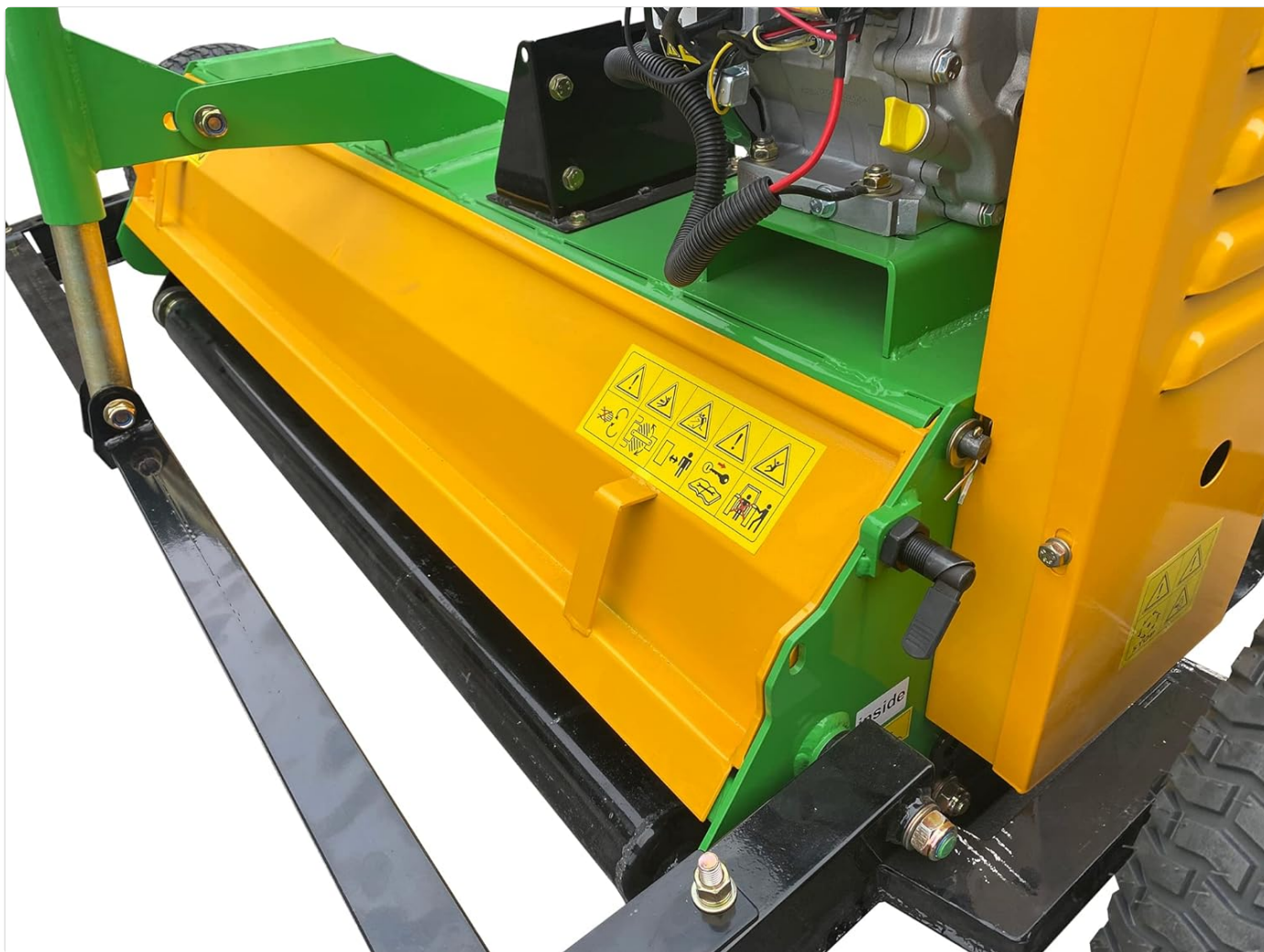
Image: Close-up view of the side panel of the flail mower, showing various safety decals and warnings. These decals provide crucial information regarding safe operation and potential hazards.