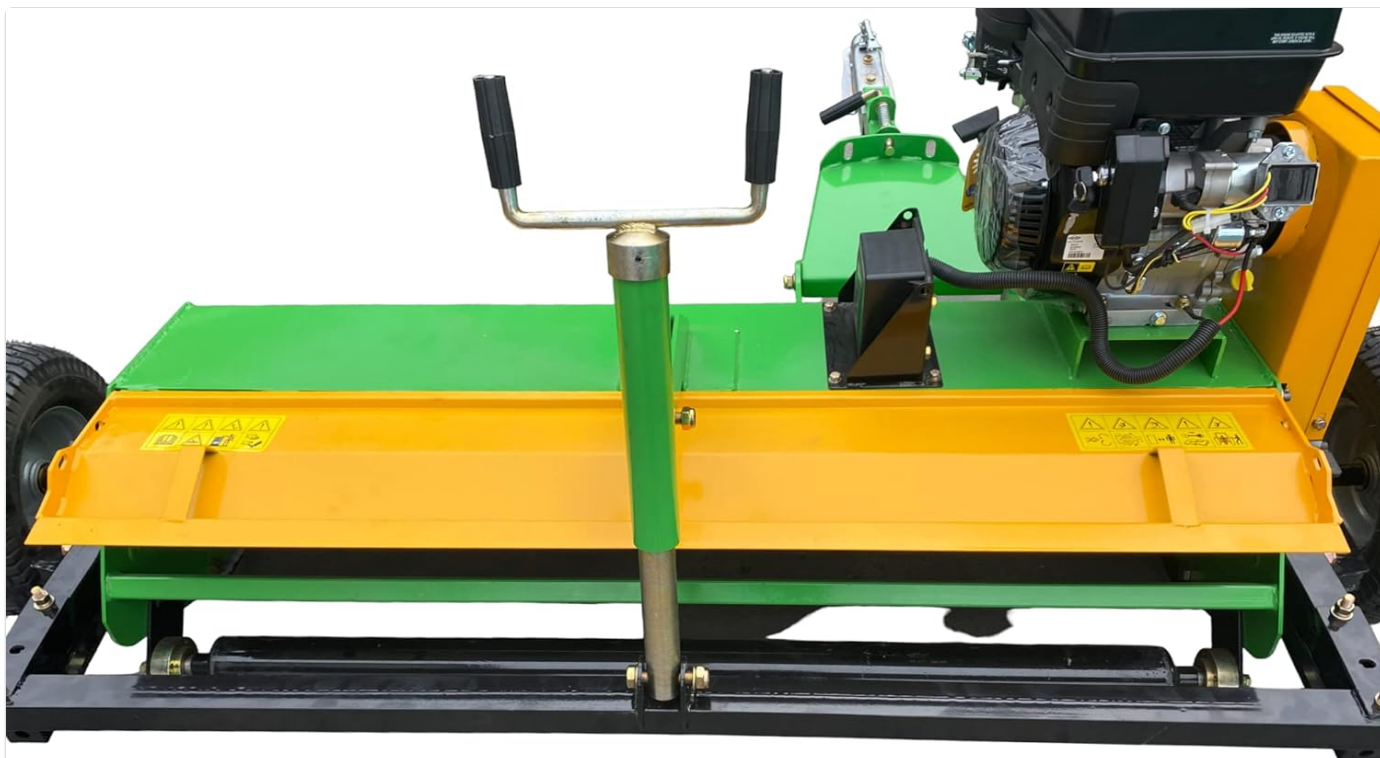
Image: Rear view of the flail mower, showing the roller and the handle used for adjusting the cutting height. This mechanism allows for precise control over the mowing level.