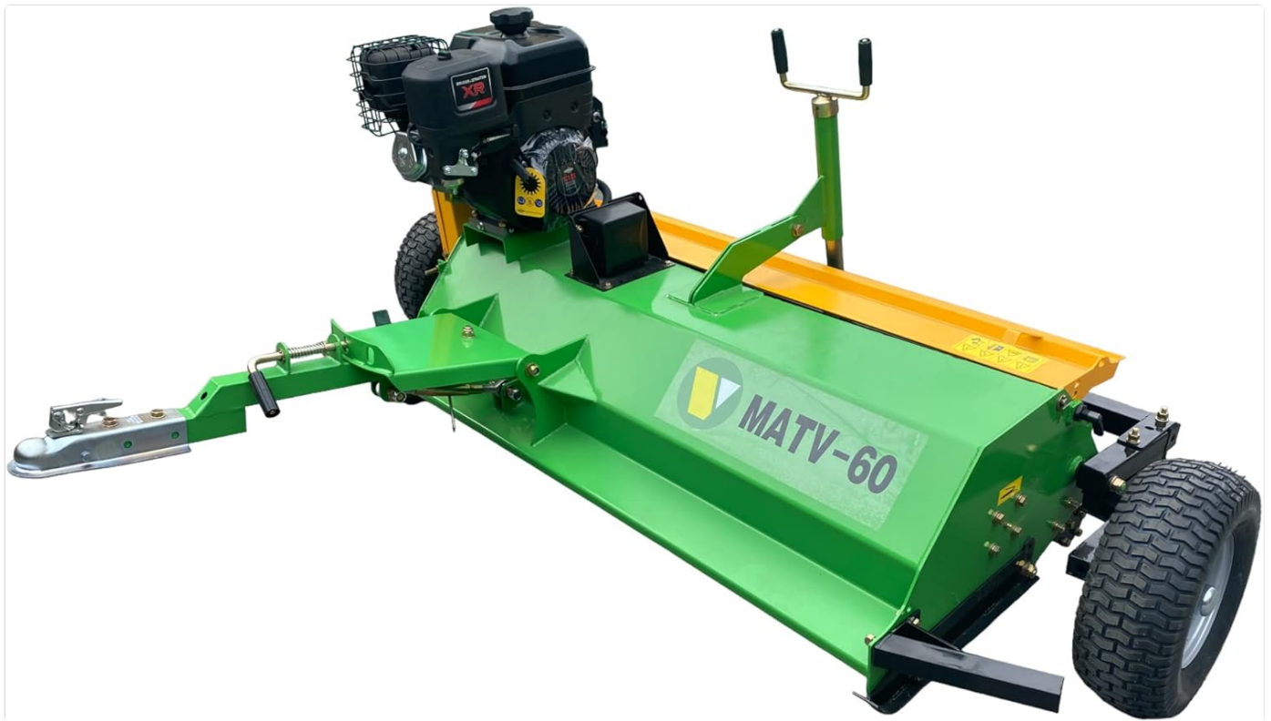
Image: An overall view of the Victory 60" Motorized ATV Flail Mower (MATV-60), showcasing its green and yellow design, engine, and tow hitch.