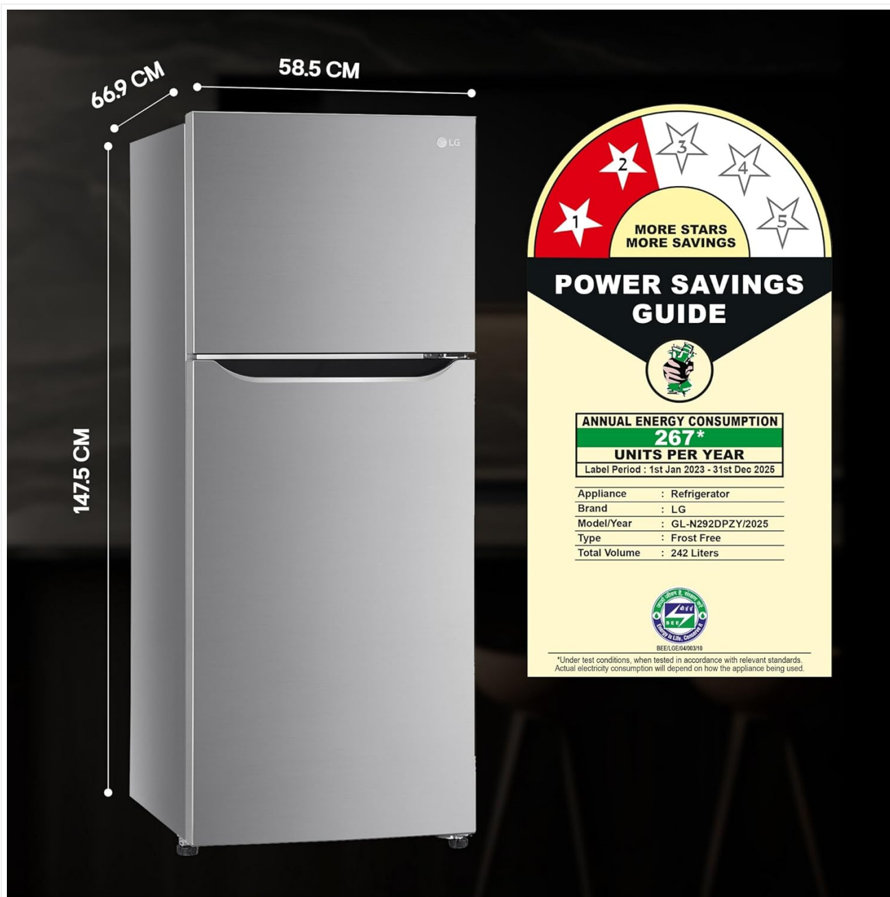
Image 2.1: Refrigerator dimensions (58.5W x 66.9D x 147.5H cm) and energy label for proper placement consideration.