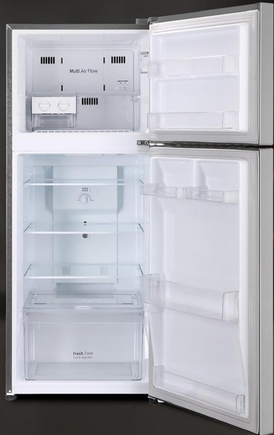
Image 3.3: Interior view highlighting various storage components like shelves, drawers, and door baskets.