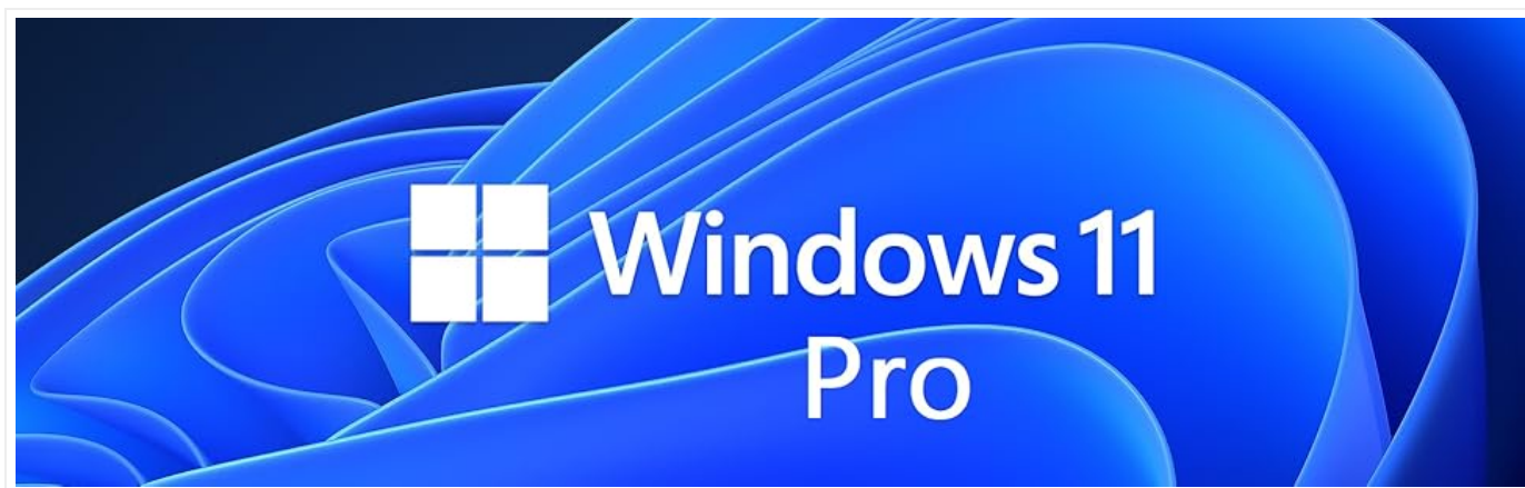
Figure 3.2: Windows 11 Pro operating system.

Video 3.1: Official product overview of the Lenovo ThinkBook 16 Gen 7, highlighting AI-infused computing and improved keyboard features.