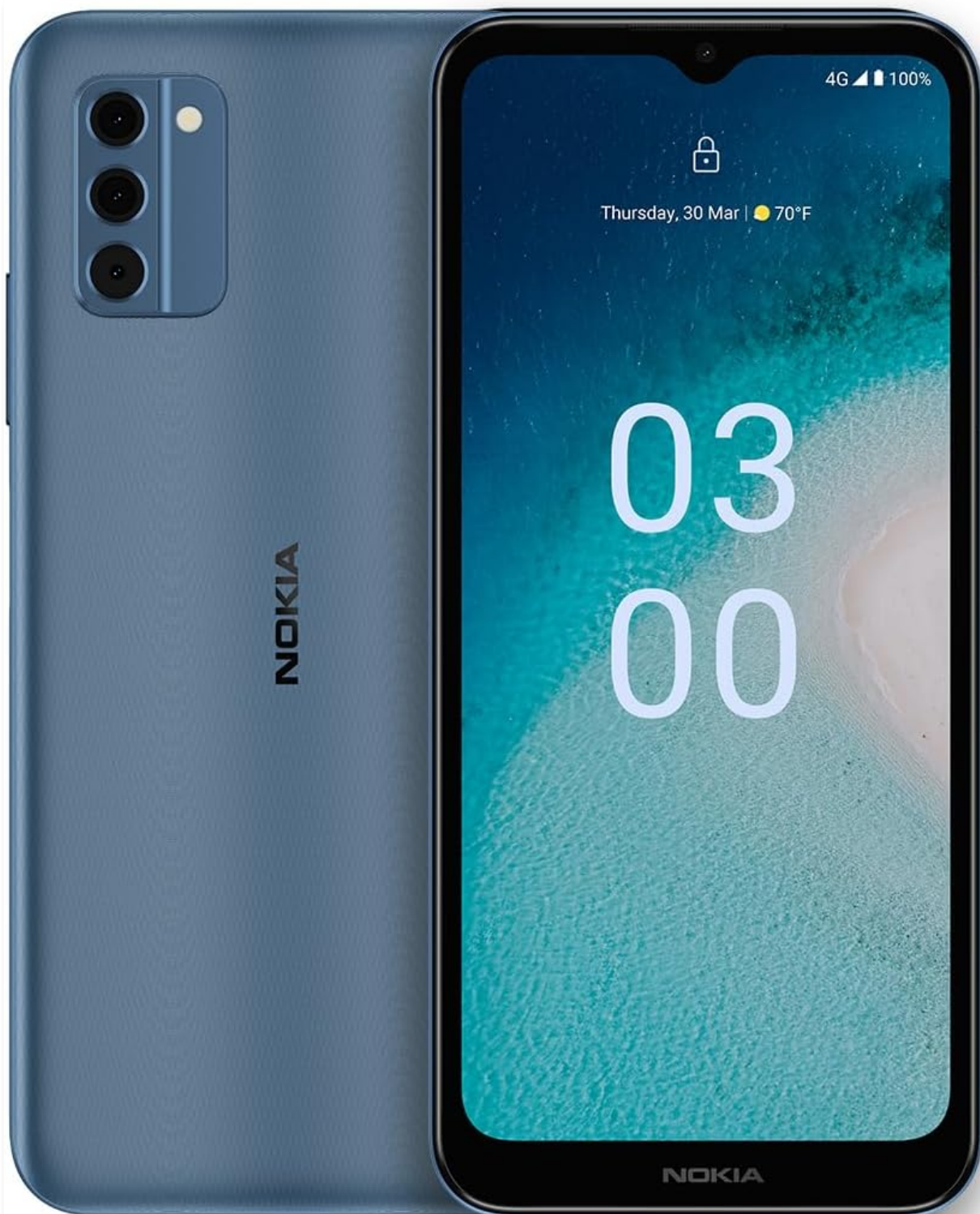
Image: Front and back view of the Nokia C300 smartphone in Ocean Blue. The front displays the time and date, while the back shows the triple camera module and Nokia branding.