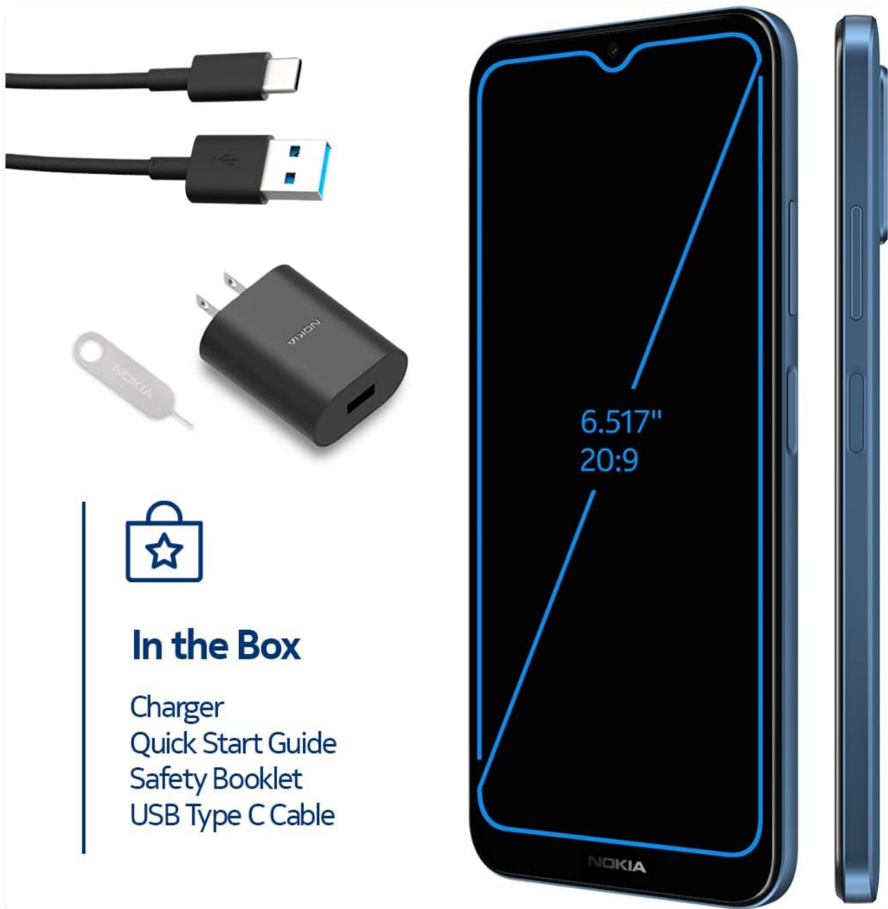
Image: A visual representation of the Nokia C300 and its included accessories: a USB Type-C cable, a power adapter, and a SIM tray ejector tool.