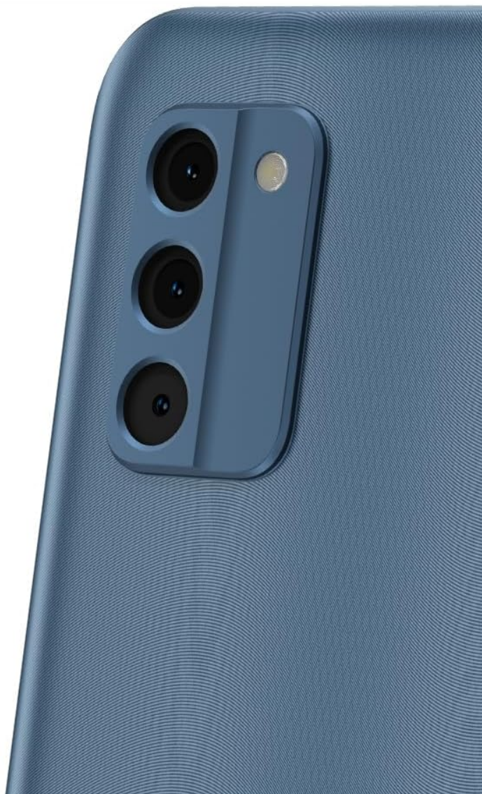
Image: A detailed view of the Nokia C300's triple-rear camera setup, highlighting the lenses and flash module.

8 MP front-facing camera, portrait mode and powerful night imaging