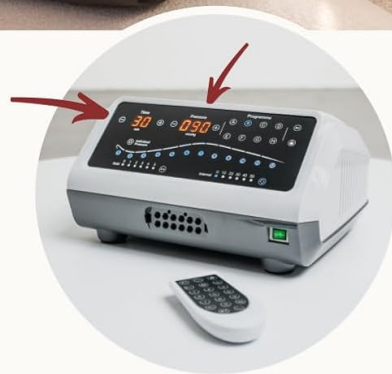
Image: The complete set of Venen Engel 12 Premium components, including the control unit, leg cuffs, remote control, and connecting hoses.