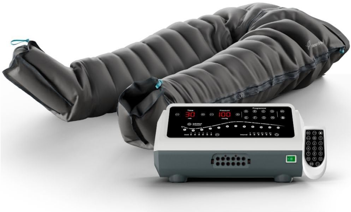
Image: The Venen Engel 12 Premium pressotherapy device, showing the main control unit, remote control, and the leg cuffs.

The Venen Engel 12 Premium pressotherapy device is designed to provide a gentle and relaxing compression massage for your legs at home. It features 12 overlapping air chambers per leg cuff, which inflate sequentially from feet to thighs to stimulate blood circulation. This process helps to alleviate tired legs, reduce swelling, and improve skin appearance. The device offers 8 preset massage programs and allows for individual adjustment of pressure and treatment time.