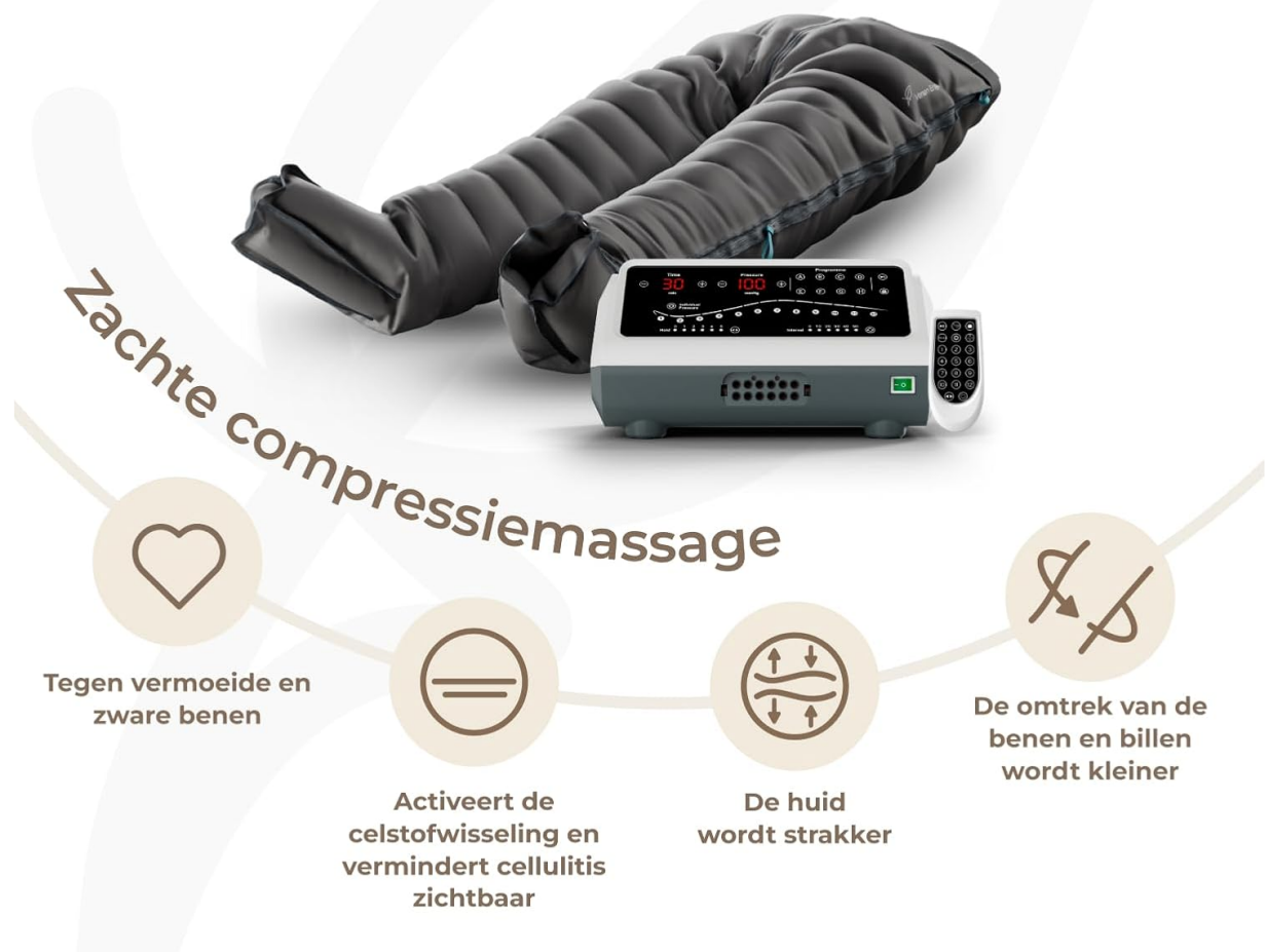
Image: A diagram illustrating the benefits of compression massage, such as reducing leg fatigue, activating metabolism, smoothing skin, and reducing leg circumference.