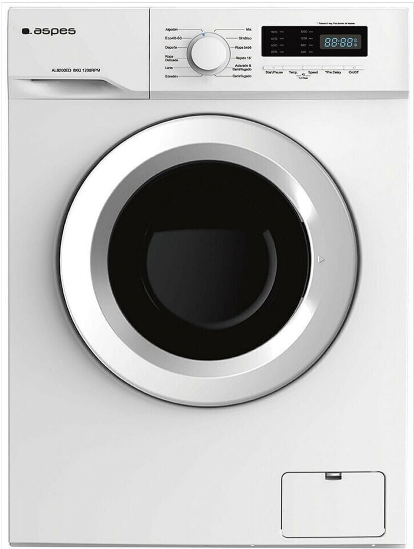
Figure 2.1: Front view of the Aspes AL8200ED Washing Machine, showing the control panel, detergent dispenser, door, and service filter cover.