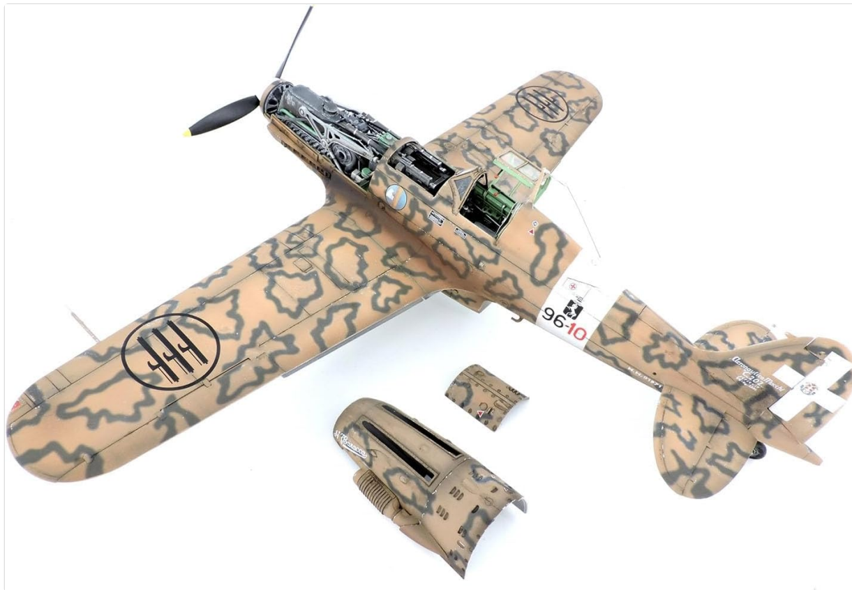
Image: A fully assembled Italeri Macchi MC.202 model, painted in a desert camouflage pattern. The engine cowling is open, revealing the detailed engine bay. The model features Italian Air Force markings and a propeller.

This manual provides comprehensive instructions for the assembly, painting, and finishing of your Italeri 2518 Macchi MC.202 1:32 scale model kit. Please read all instructions carefully before beginning assembly. Familiarize yourself with the parts and the overall construction process to ensure a successful build.