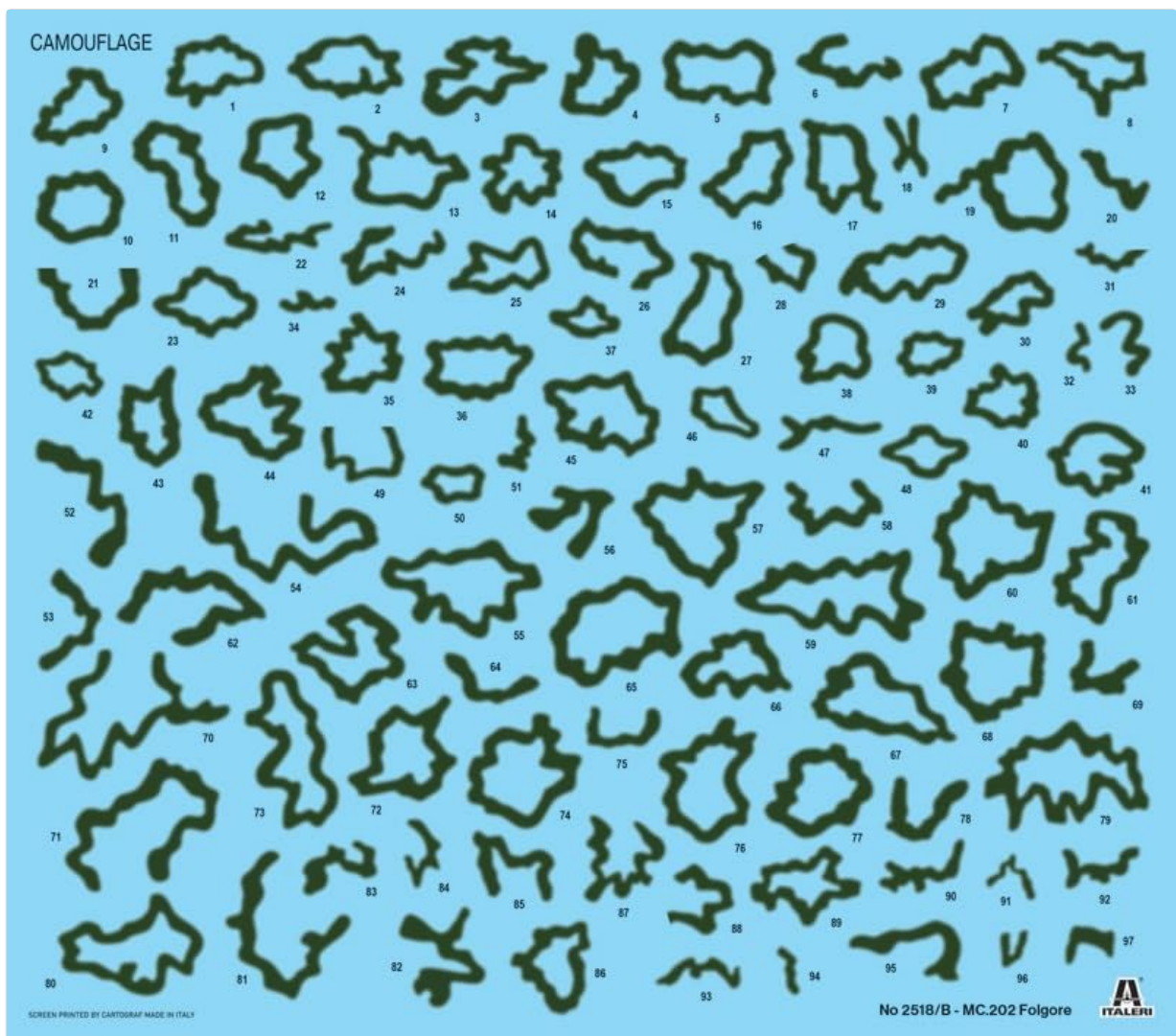
Image: A camouflage pattern guide sheet, displaying numerous numbered irregular shapes on a blue background. These shapes correspond to specific paint colors for creating the aircraft's camouflage. Apply decals after painting and a gloss clear coat. Cut each decal carefully, dip it in water, and slide it onto the model. Use decal setting solutions for better adhesion and to conform to surface details. The super decals sheet includes various markings and realistic smoke rings decals.