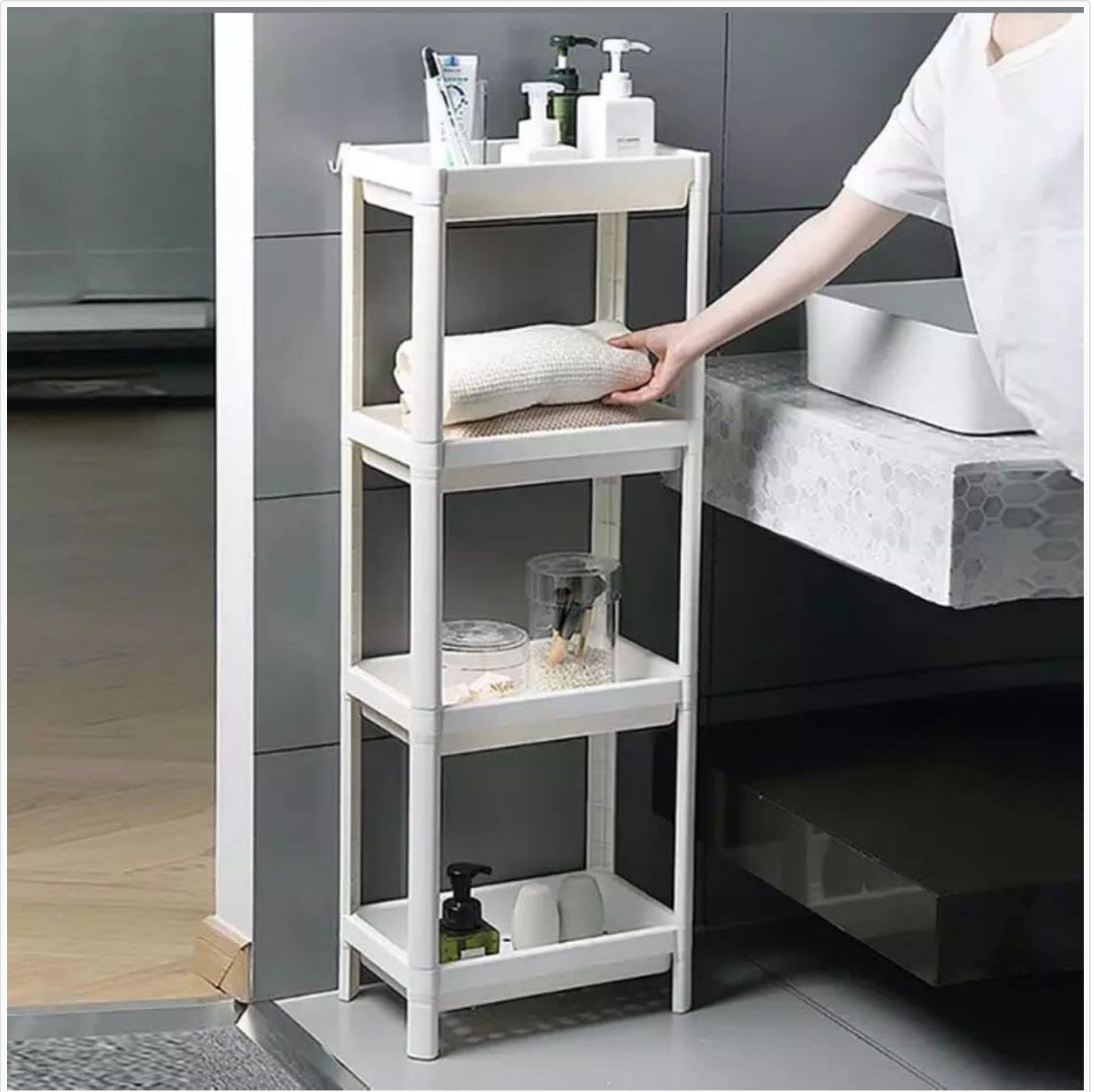
Image: The shelf in a bathroom corner, neatly organizing towels and other small items.