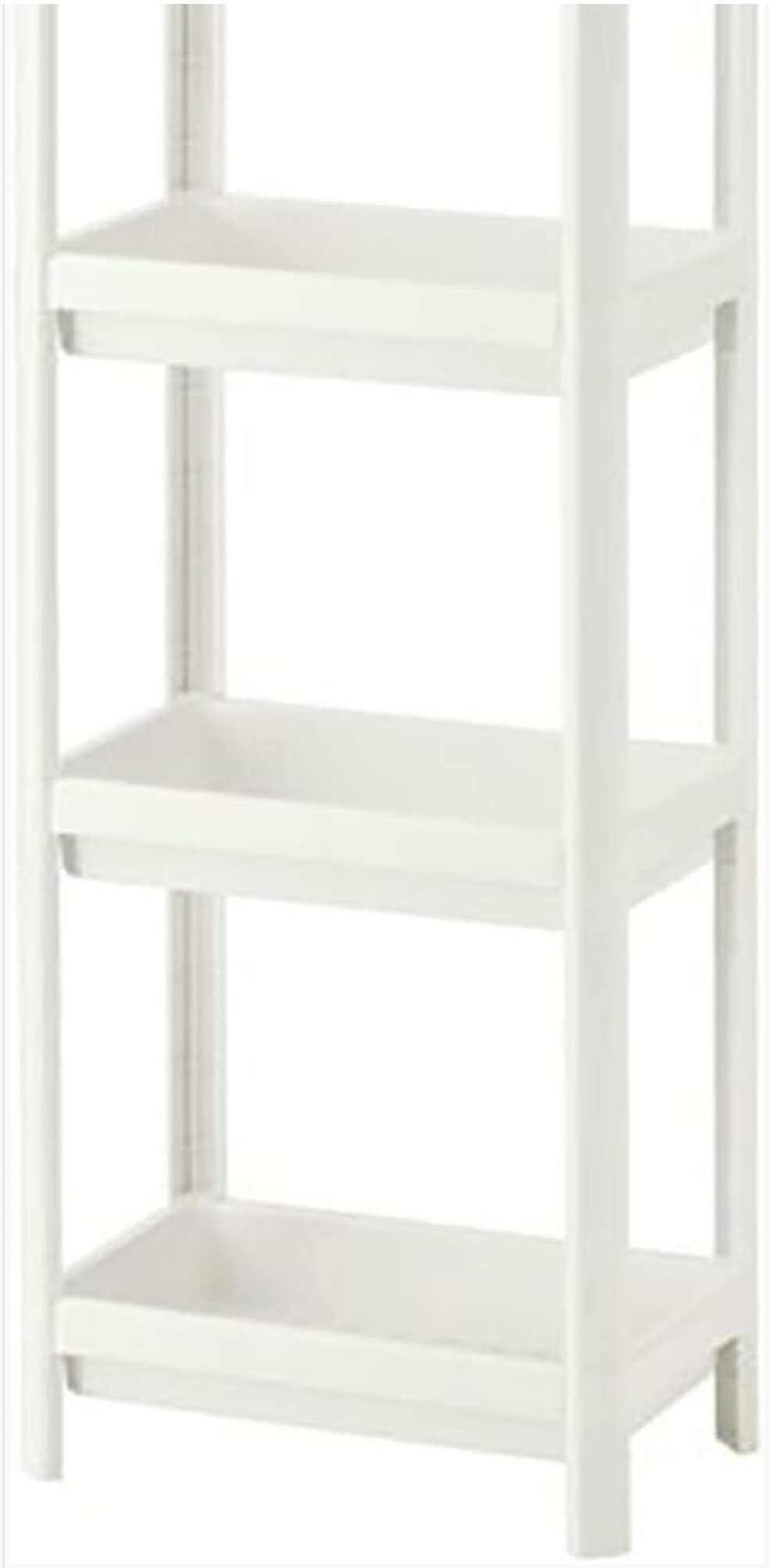
Image: A fully assembled Generic Vesken 4-tier shelf, ready for use.