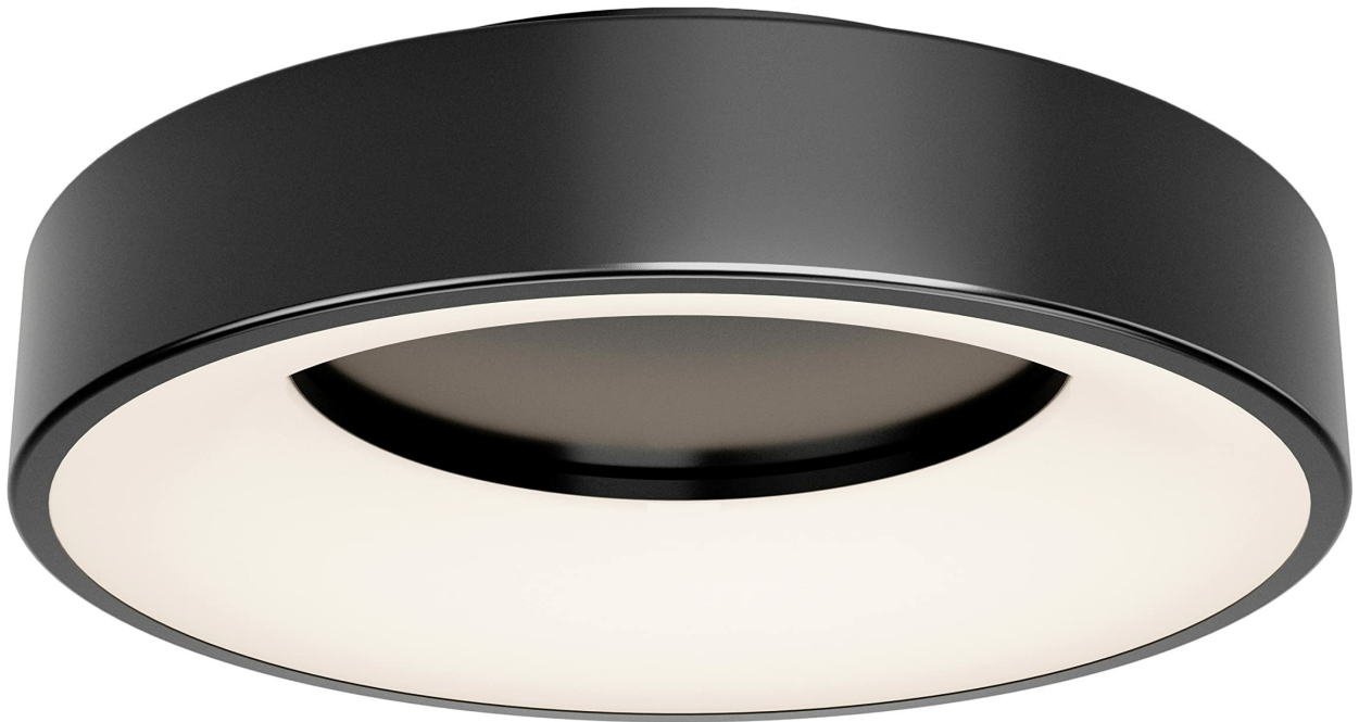
Image: The Aiden LED Flush Mount installed, demonstrating its appearance in a typical home setting.

5. Restore Power: Once installation is complete and all connections are secure, restore power at the main circuit breaker.