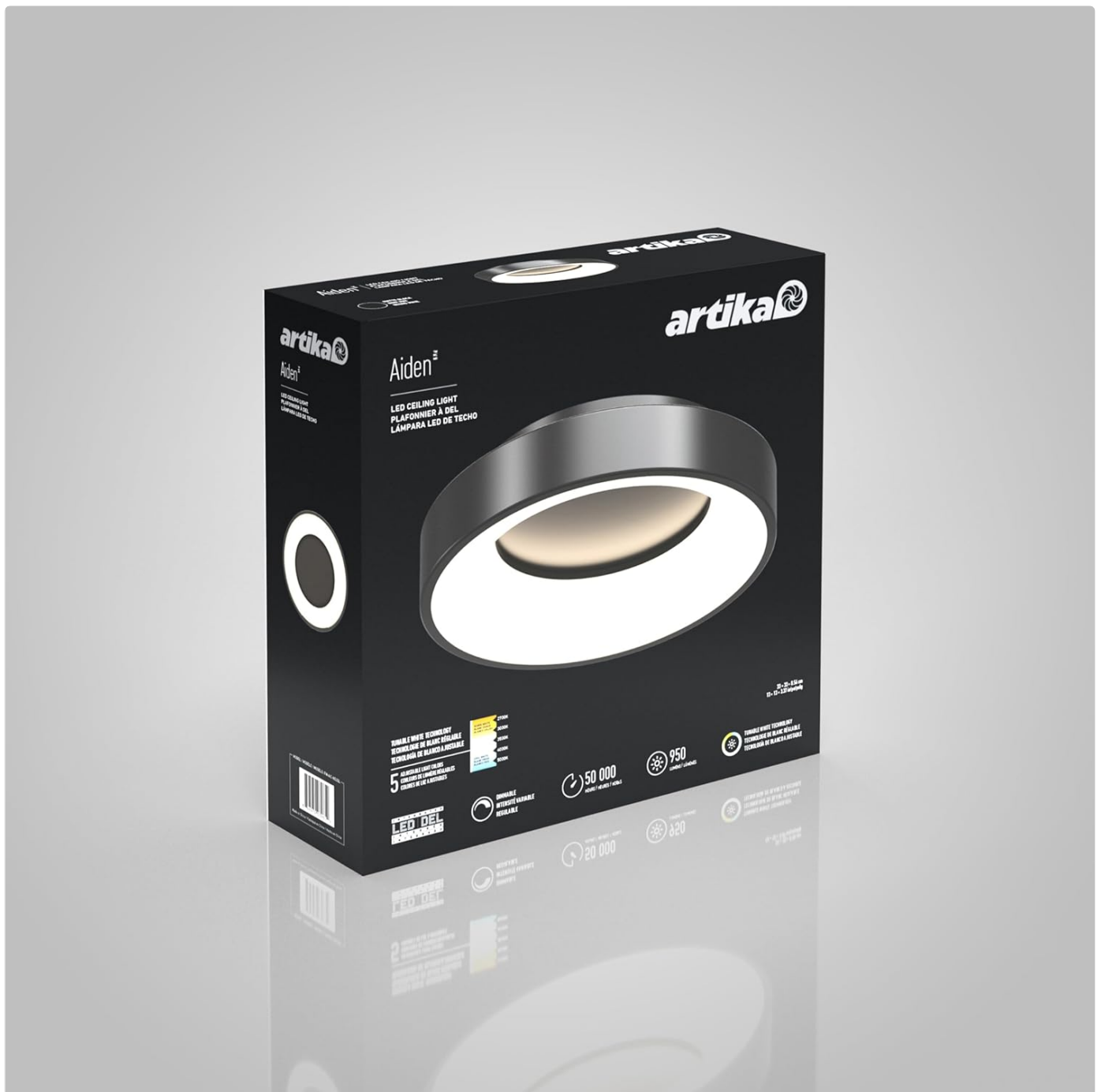
Image: Product packaging illustrating the included components.