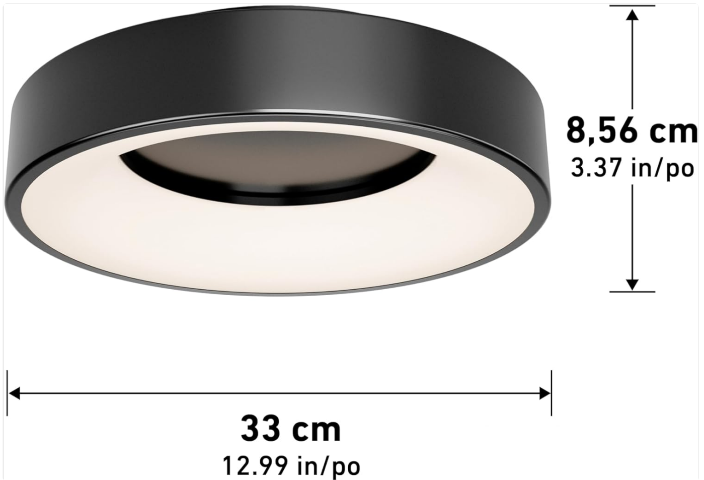
Image: Technical drawing illustrating the length, width, and height dimensions of the fixture.