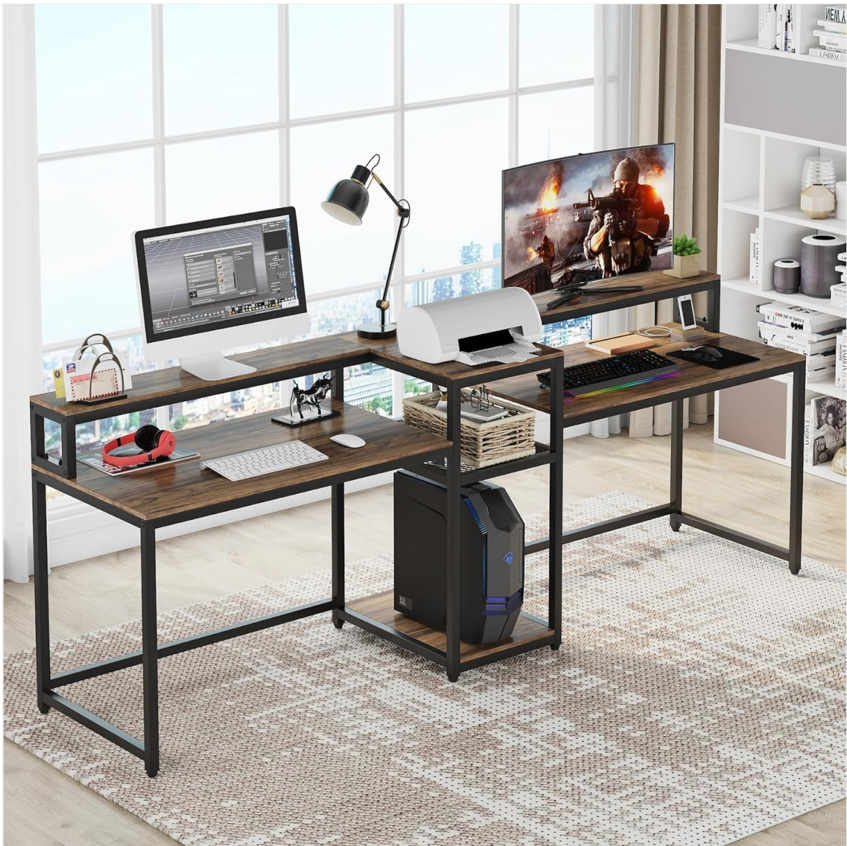
Figure 1: Overview of the Tribesigns 94.5-inch Double Computer Desk.