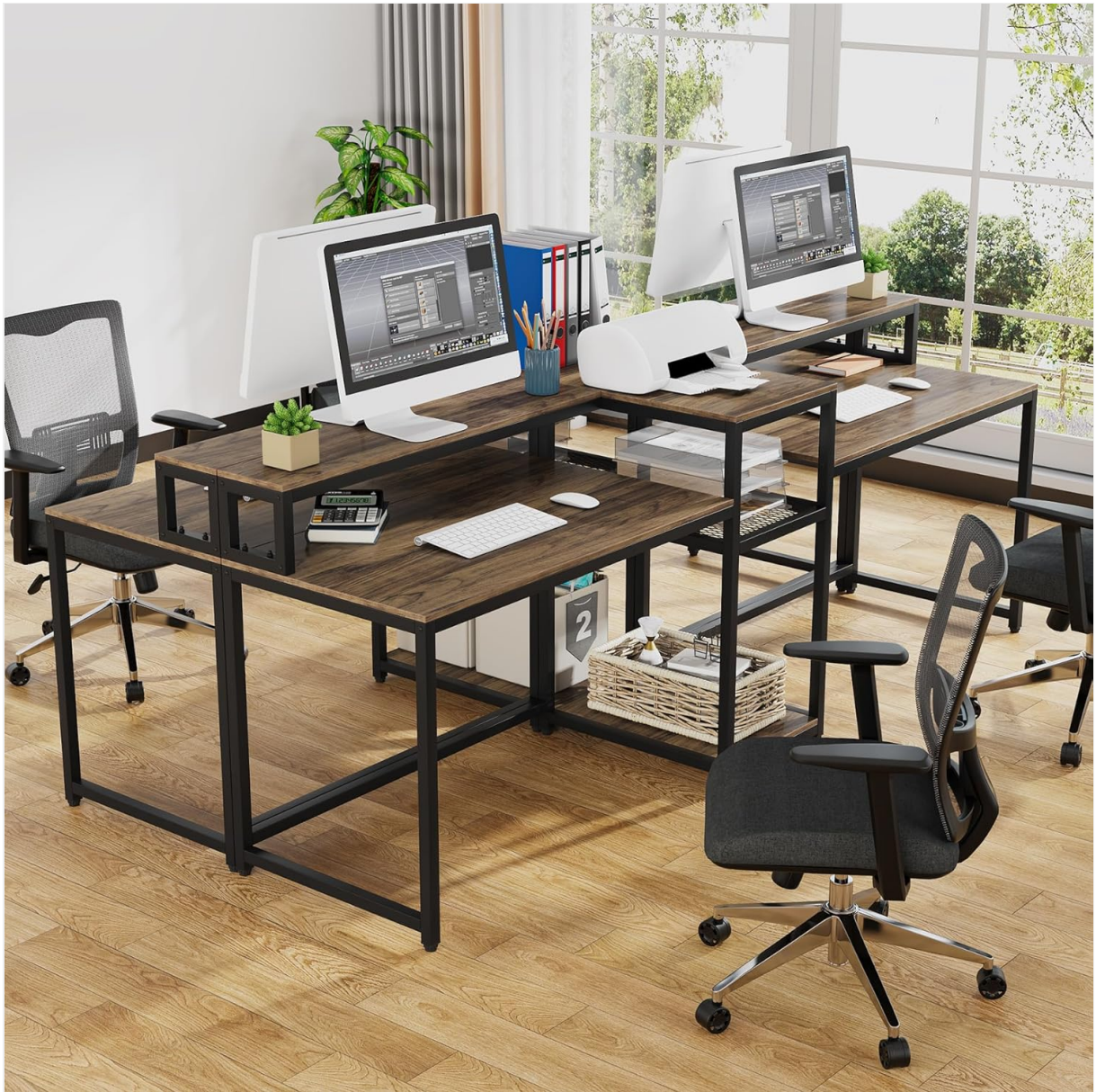
Figure 4: Illustration of ergonomic benefits provided by the monitor stand.