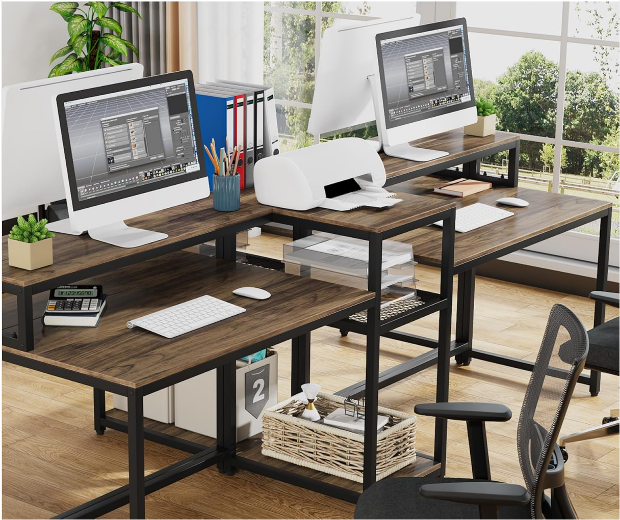
Figure 6: The desk offers multiple storage options for office essentials.