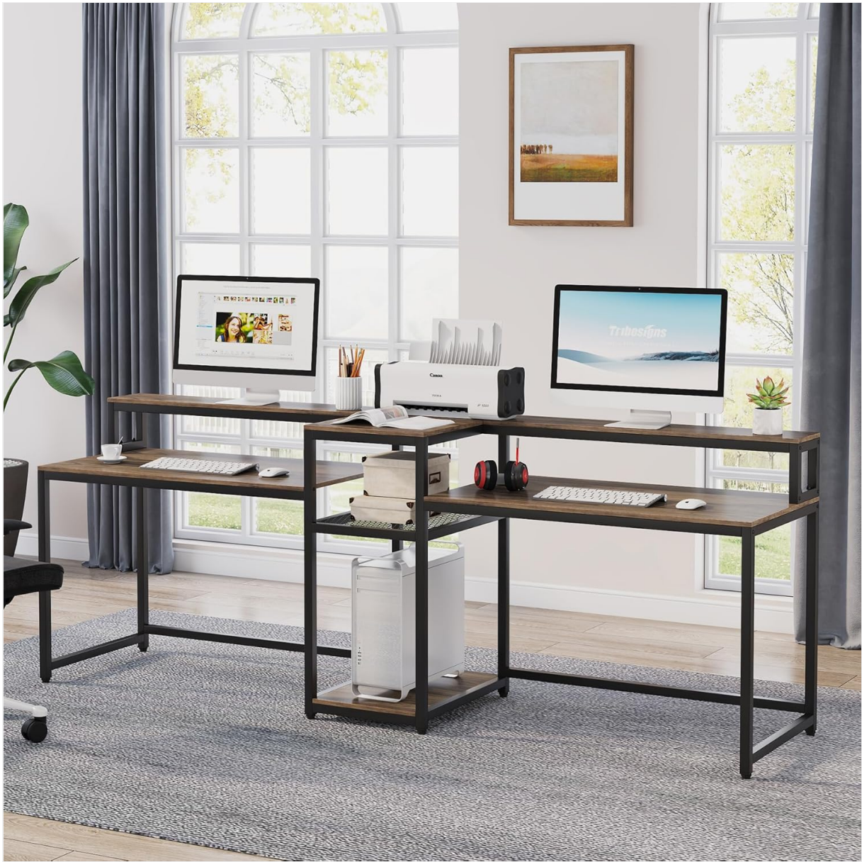
Figure 3: Example setup demonstrating the dual workstation capacity.