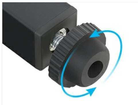
Figure 5: Detail of the monitor stand, which can also accommodate lighting accessories.