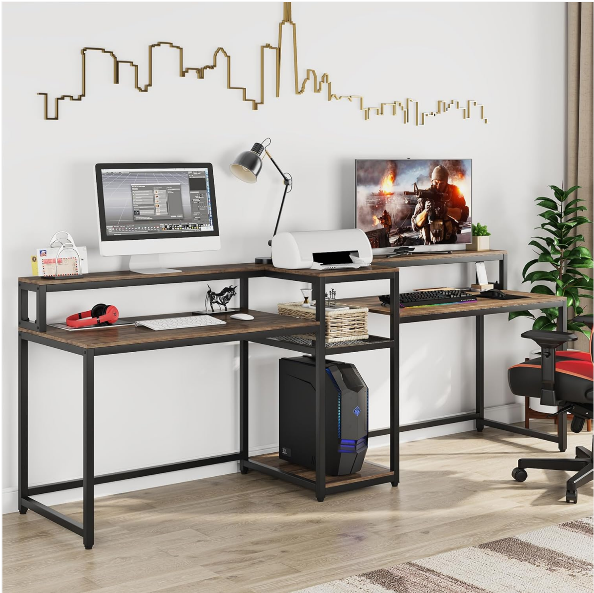
Figure 8: The central unit provides space for a printer and CPU, enhancing functionality.