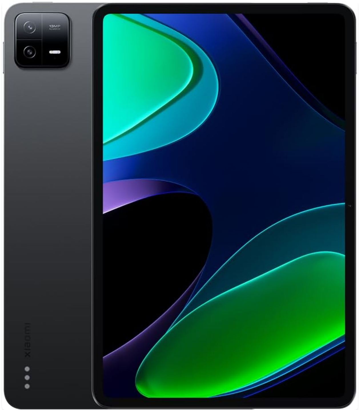
Figure 1: Xiaomi Pad 6 WiFi Version