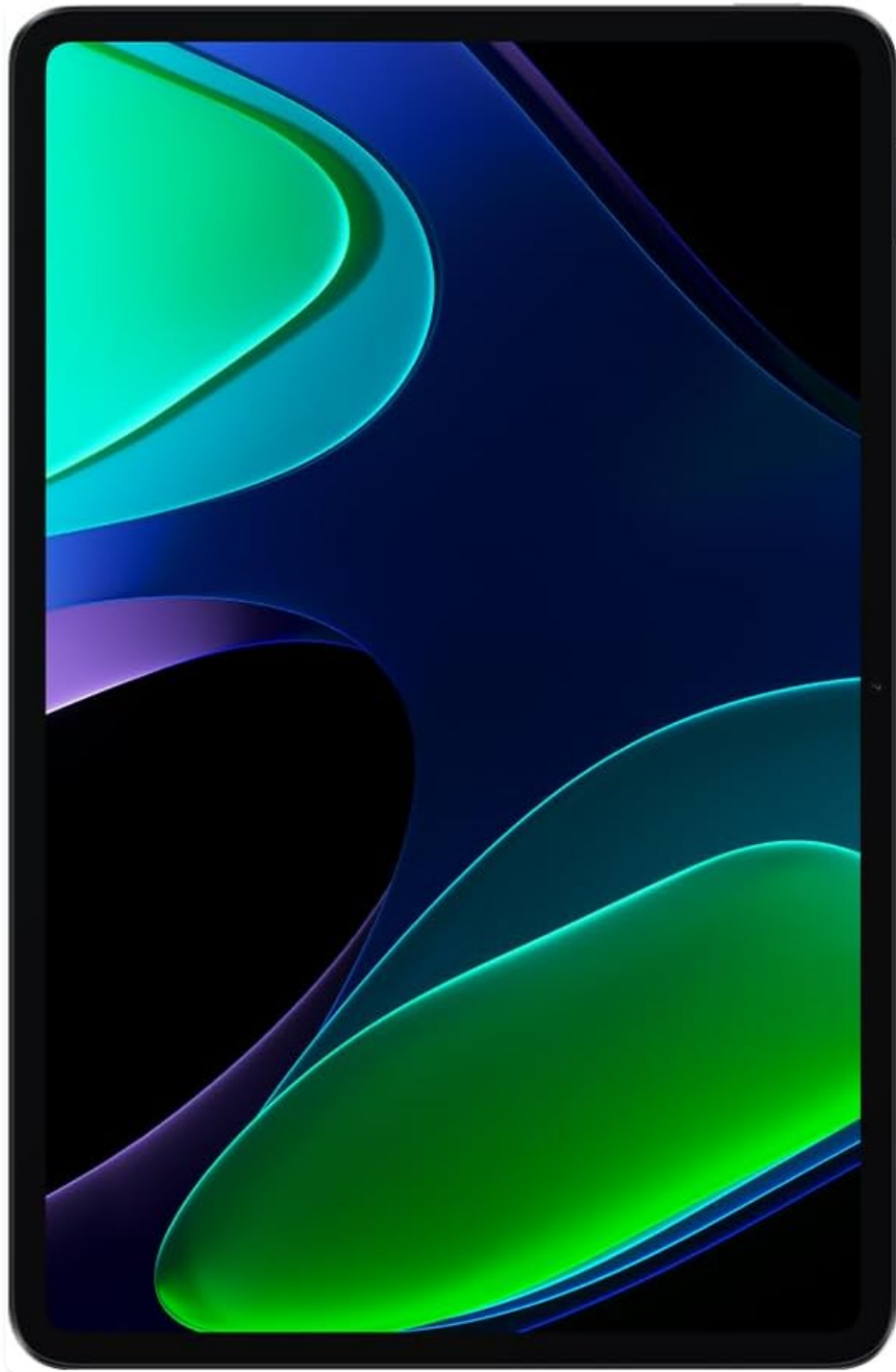
Figure 2: Xiaomi Pad 6 Front Display