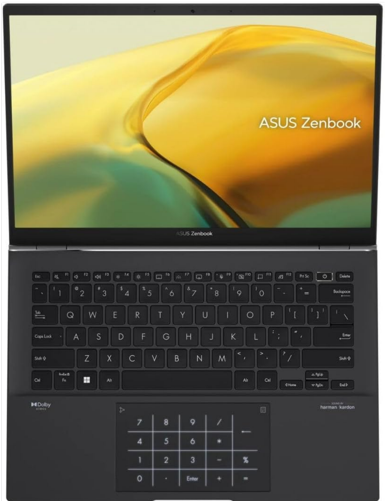
Figure 2: Keyboard and Touchpad Layout.

This image provides a top-down view of the laptop's keyboard, highlighting the backlit keys and the large touchpad with its integrated virtual numeric keypad.