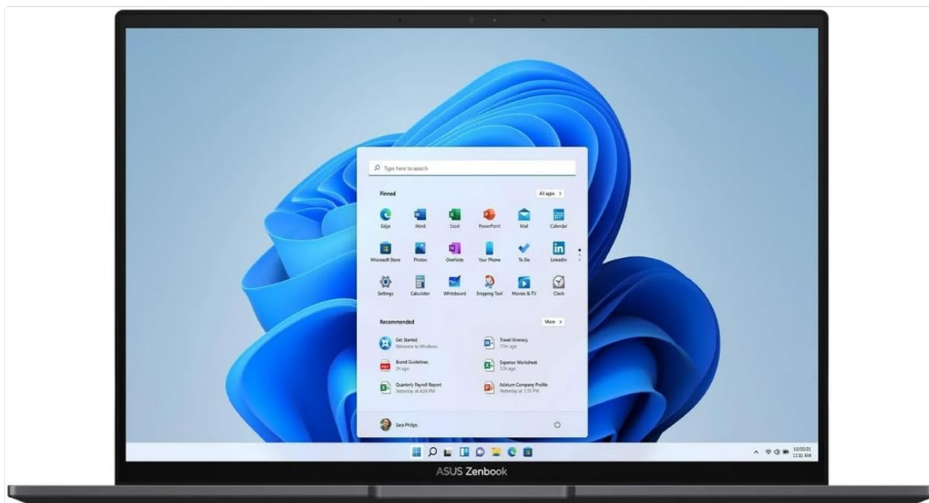
Figure 1: ASUS Zenbook 14" OLED Laptop with Windows 11 Interface.

The ASUS Zenbook 14" OLED Touchscreen Laptop is designed for productivity and entertainment, featuring a stunning 14-inch OLED touchscreen display, a powerful AMD Ryzen 5 7530U processor, 8GB of RAM, and a fast 256GB SSD. It comes pre-installed with Windows 11 Home and offers advanced connectivity options.