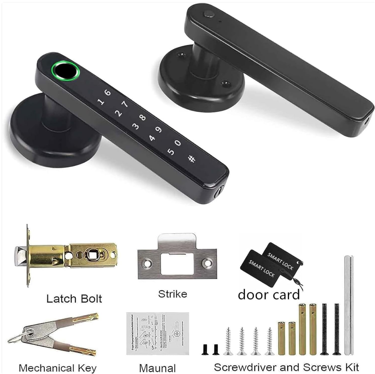
Figure 2.2: Contents of the LKUWEE Smart Lock package.