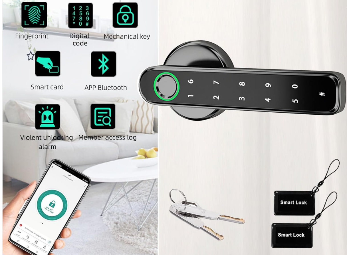
Figure 2.1: The LKUWEE Smart Lock features five distinct unlocking methods for versatile access.

Ability to adapt to different families and situations.