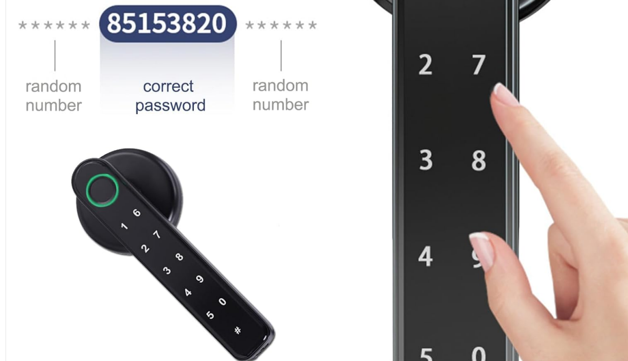
Figure 4.3: Example of using the anti-peeping password feature.

The correct sequence in the center can unlock the door.