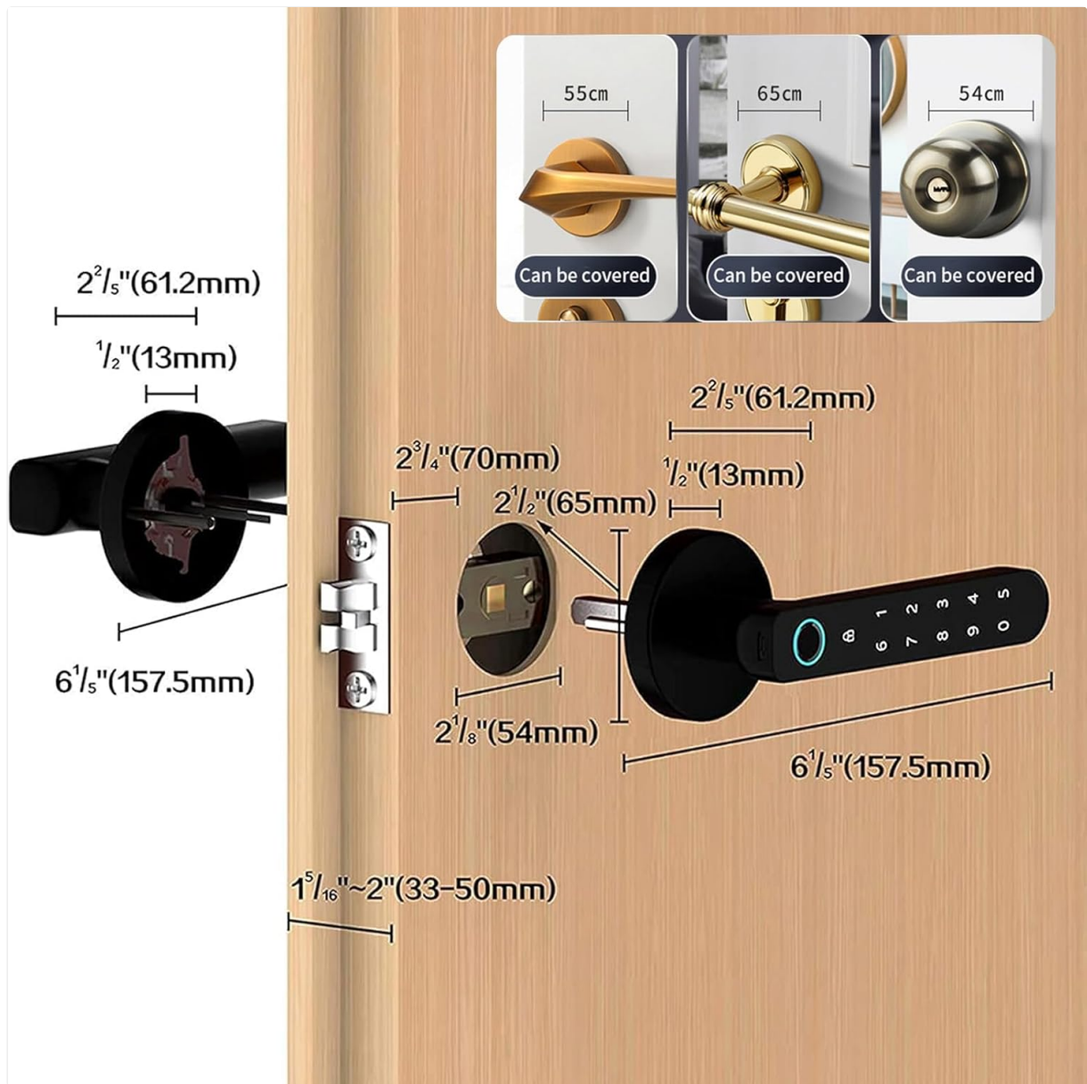
Figure 3.1: Door and lock dimension requirements for proper installation.