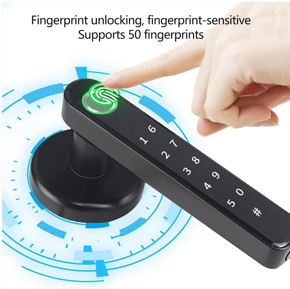
Figure 4.2: Fingerprint sensor in use for unlocking the door.