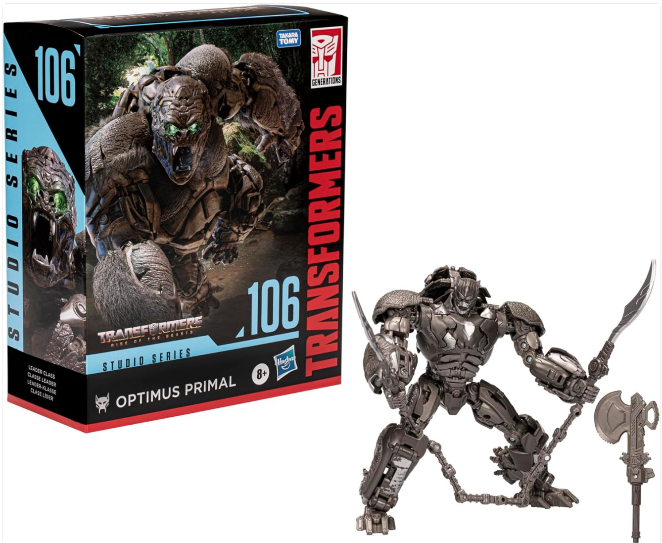
Figure 1: Product packaging showing Optimus Primal in gorilla mode.