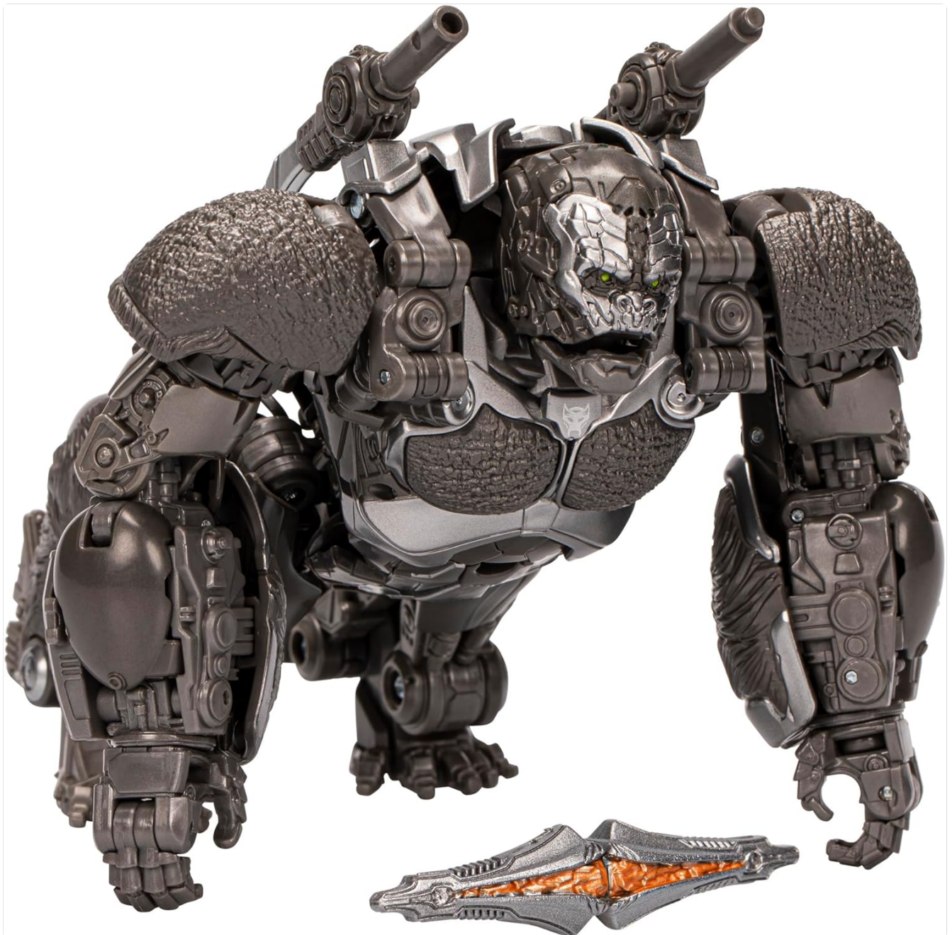
Figure 3: Optimus Primal in Robot Mode with accessories.