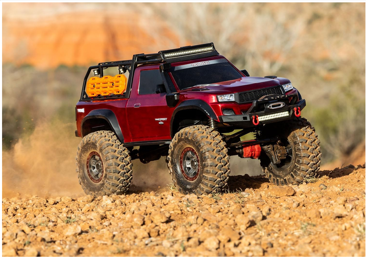
Figure 2: The TRX-4 Sport High Trail Edition in action on a dirt trail.

Video 1: The TRX-4 Sport High Trail Edition navigating various challenging terrains, demonstrating its off-road capabilities and suspension articulation.