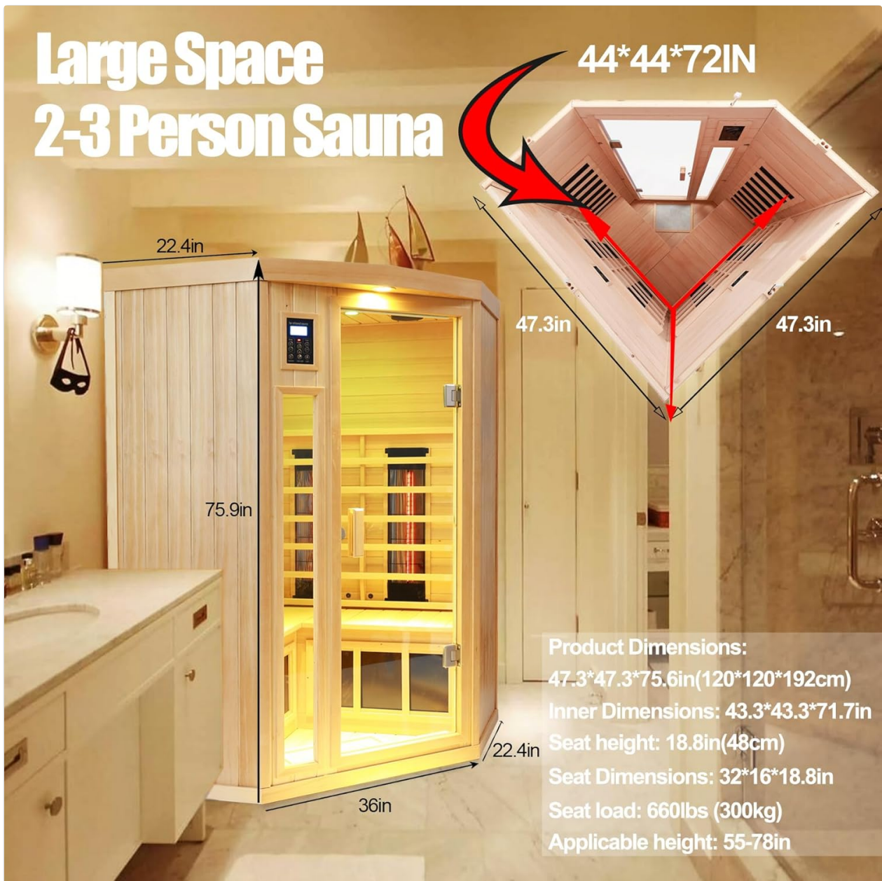
Image: A visual representation of the sauna's external and internal dimensions.