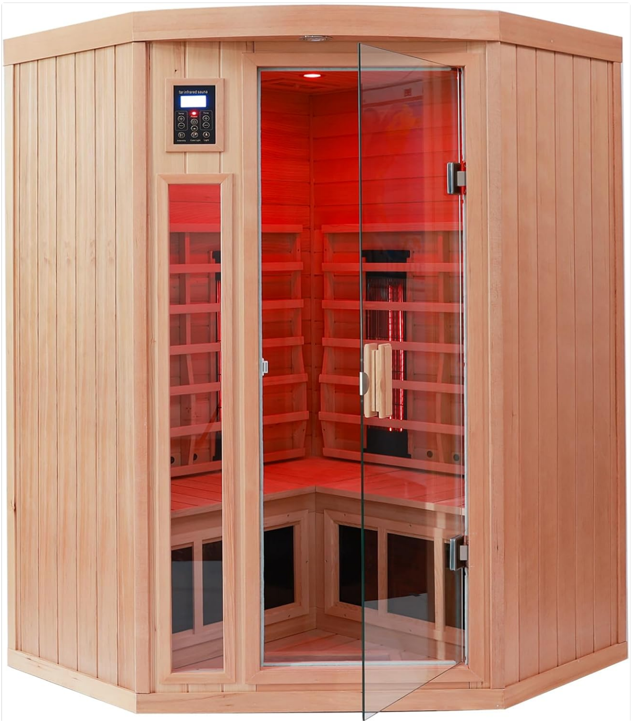
Image: The KUNSANA 2-3 Person Ceramic Infrared Sauna, showcasing its hemlock wood exterior, glass door, and internal heating elements with red light.