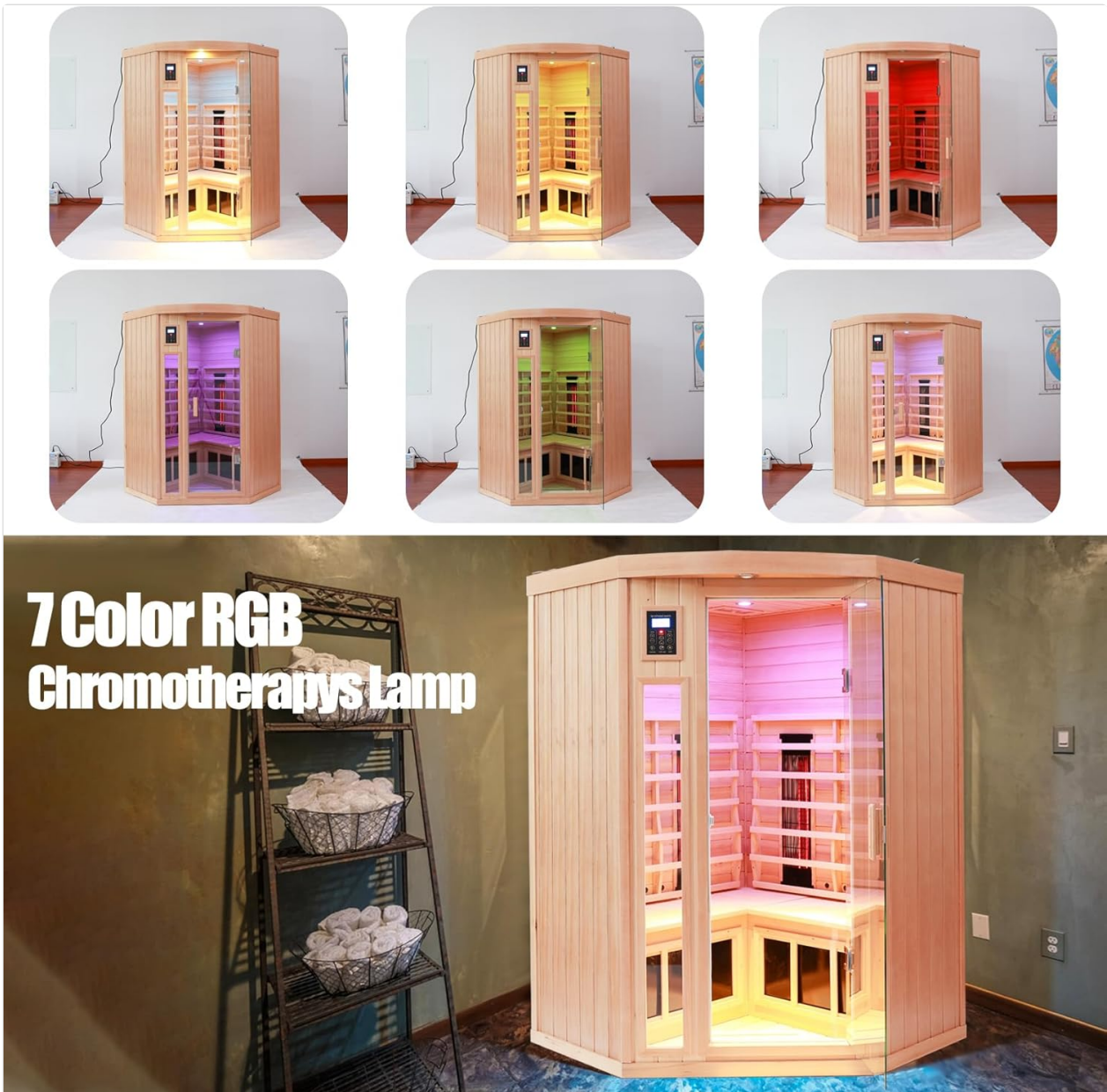
Image: The sauna interior illuminated by different colors from the 7-color RGB chromotherapy lamp system.