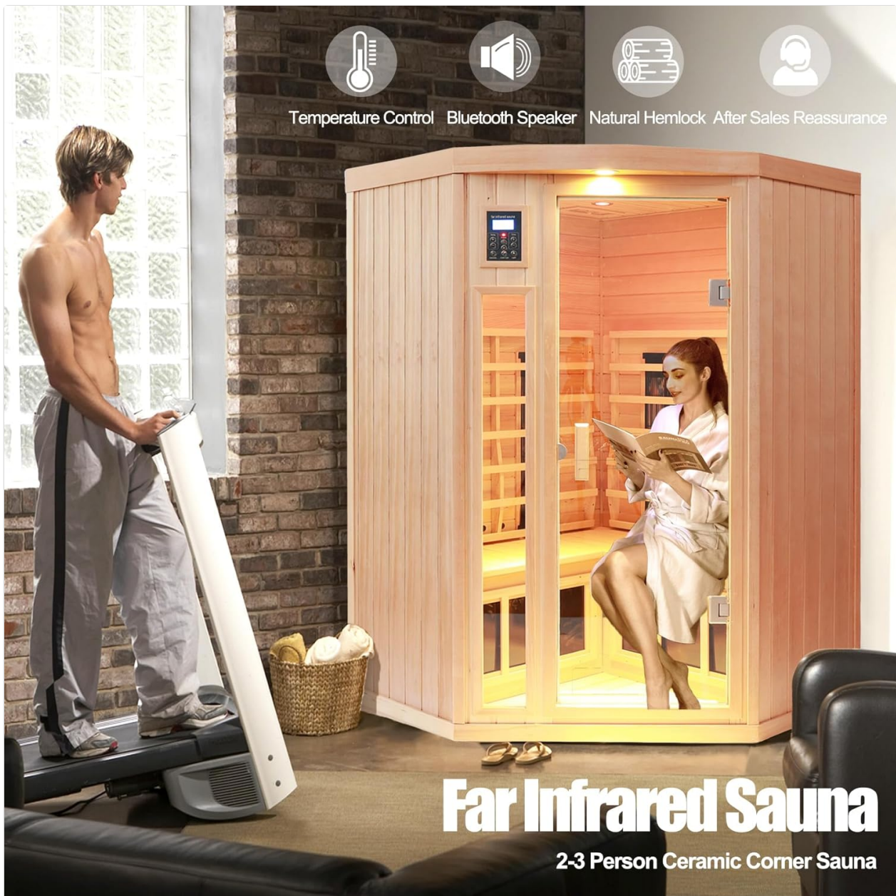
Image: The KUNSANA sauna in a living space, demonstrating its compact corner design and interior lighting.