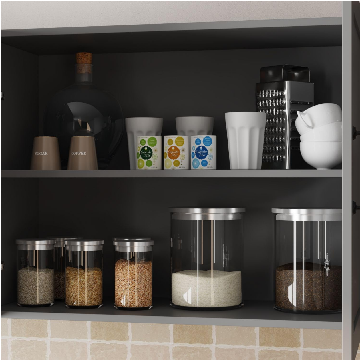
Figure 4: Detailed view of the upper cabinet's interior, displaying organized jars and kitchen accessories on its shelves.