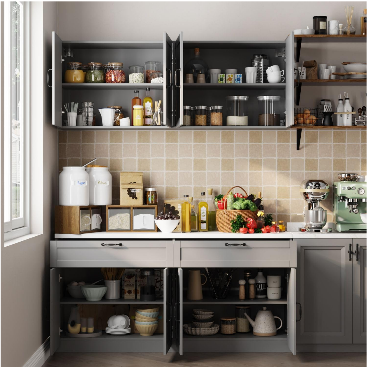
Figure 3: Interior view of the FAMAPY kitchen pantry cabinet with doors open, showing various kitchen items neatly stored on shelves and in drawers.