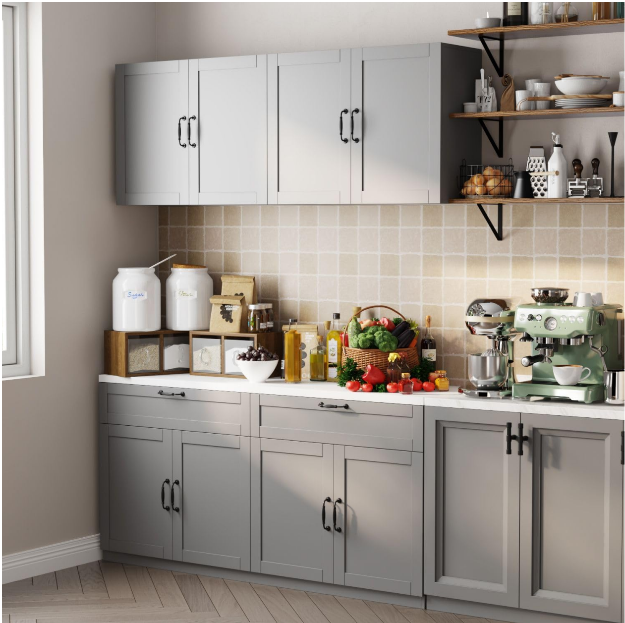
Figure 2: The FAMAPY kitchen pantry cabinet integrated into a kitchen, demonstrating its aesthetic and functional role as a storage solution.