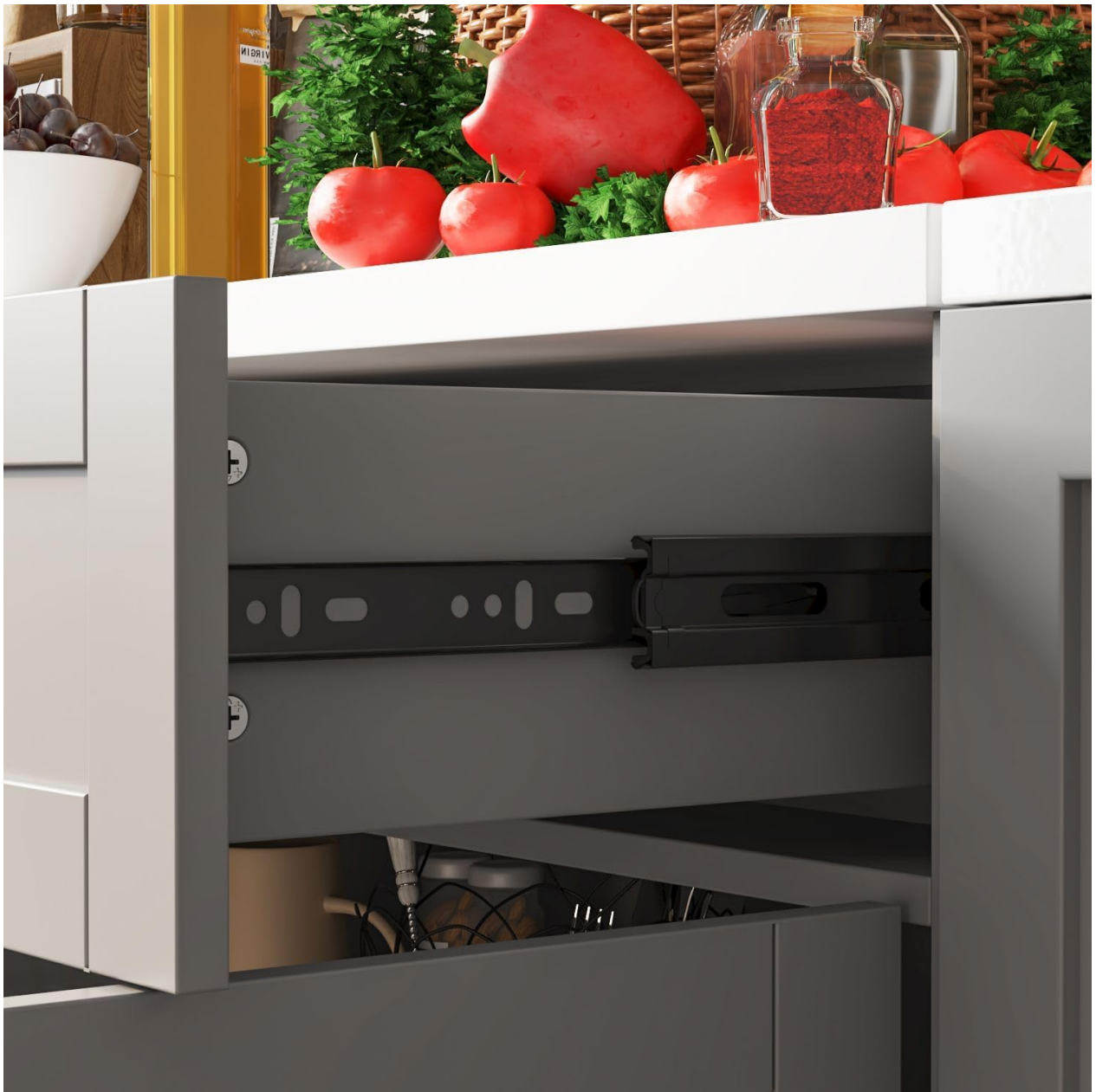
Figure 5: A close-up image of an open drawer, highlighting the smooth operation of the drawer slide mechanism.