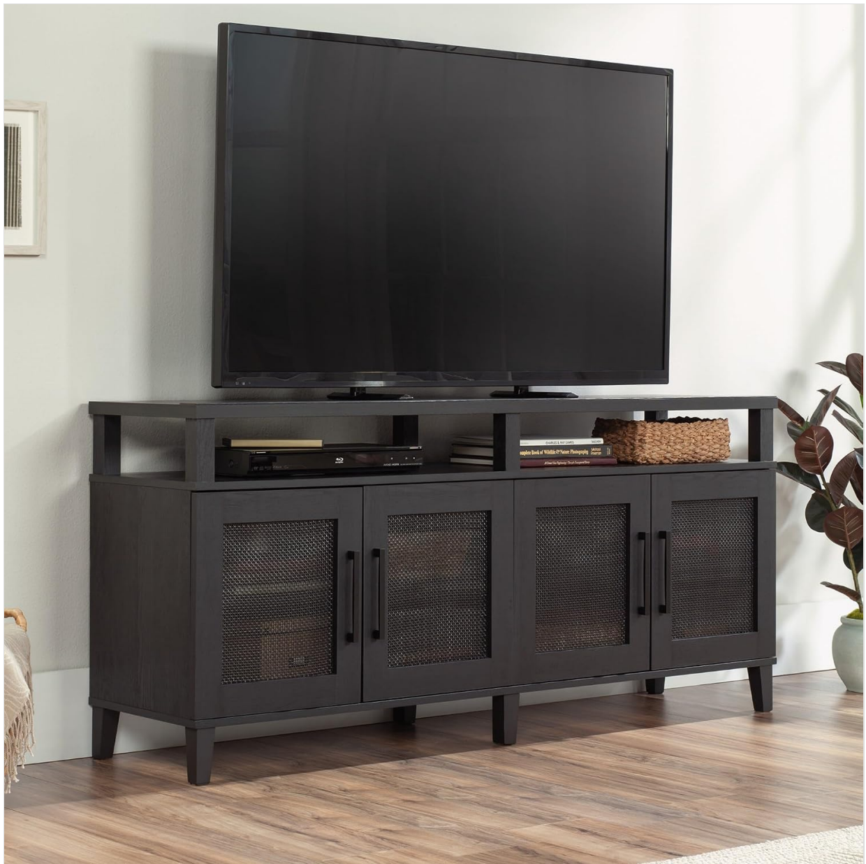
Image: Credenza with a TV and media devices on the open shelf.