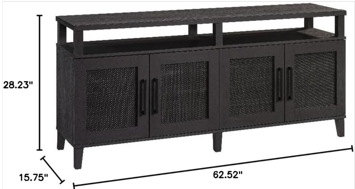
Image: Product dimensions for planning placement.

The assembled unit measures approximately 15.75 inches (D) x 62.52 inches (W) x 28.23 inches (H)