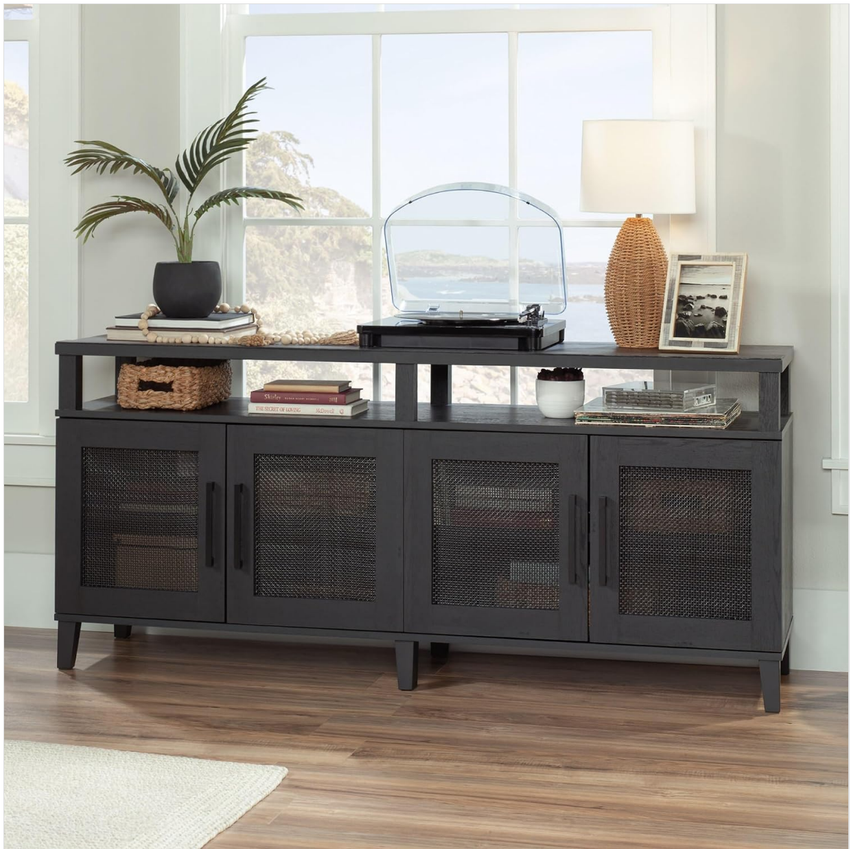
Image: Credenza used for general storage and display.