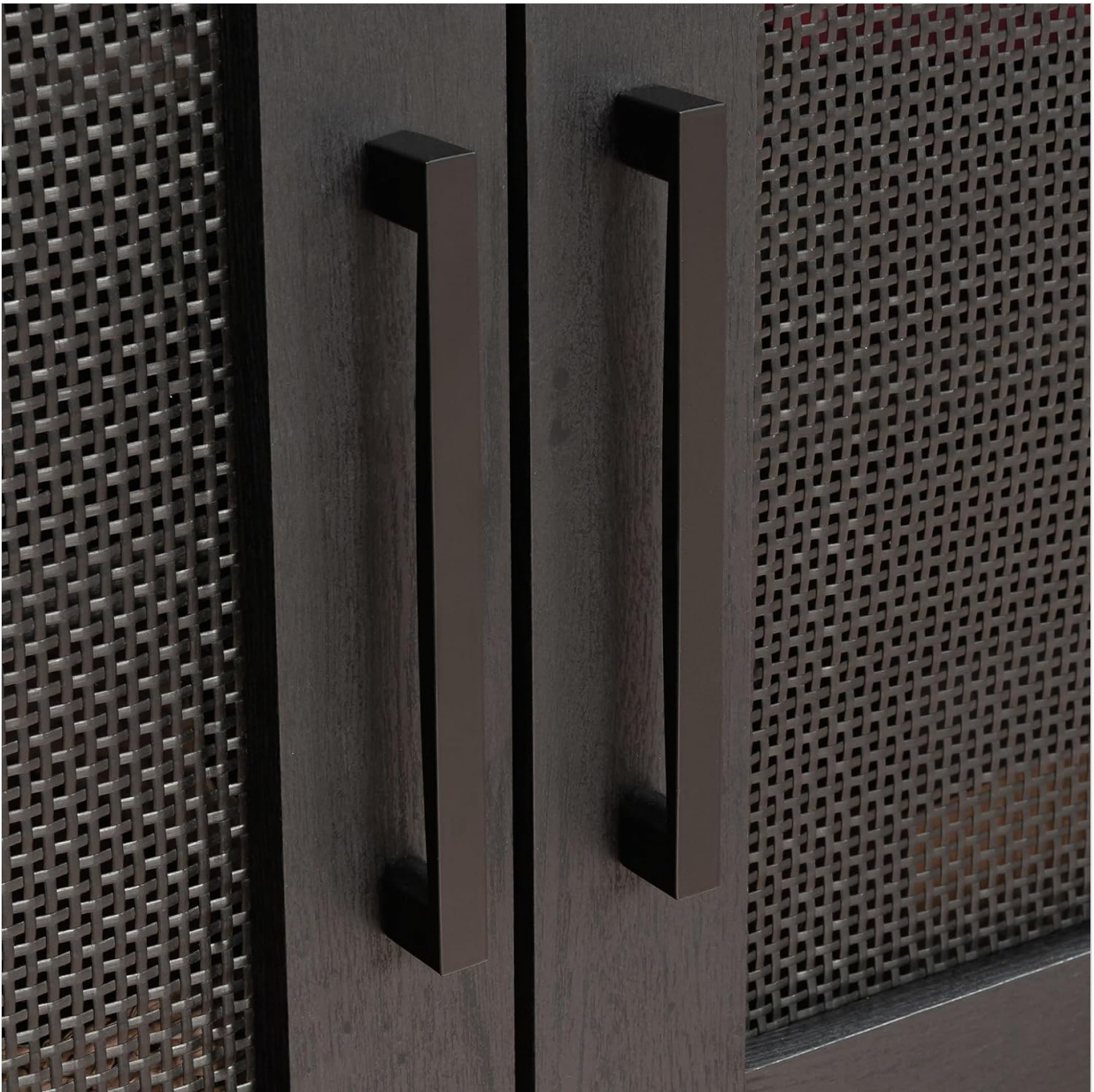
Image: Detail of the rattan door insert.