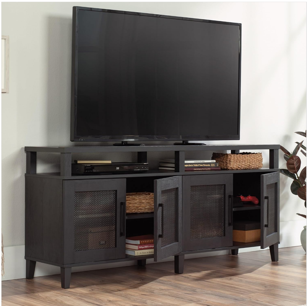
Image: Detail of the door handles.