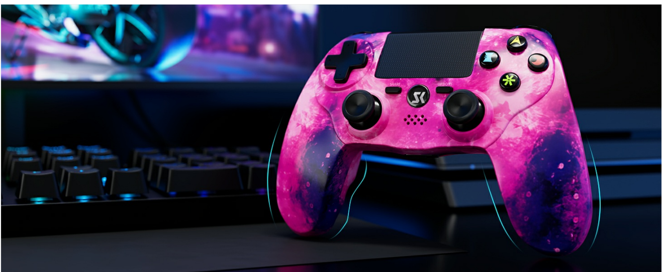
Image: The CHENGDAO Wireless Controller's sensitive multi-touch screen, which can be used for various in-game interactions and settings.