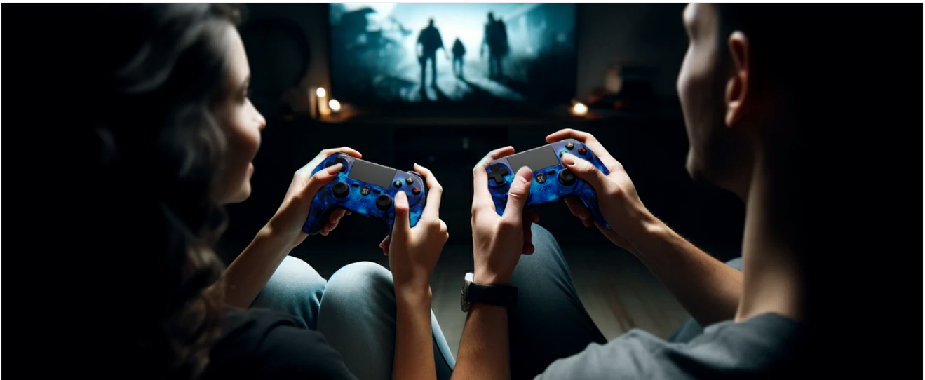
Image: A visual representation of the CHENGDAO Wireless Controller's 800mAh battery capacity, indicating long-lasting power.