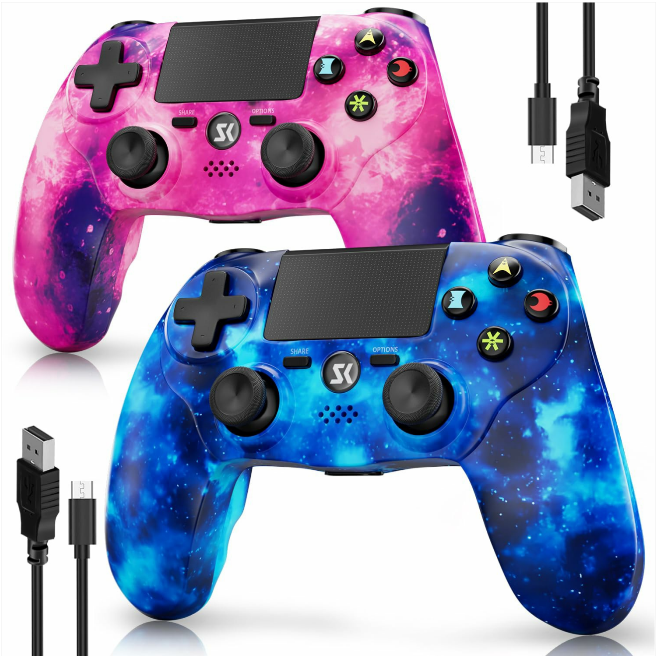
Image: A pair of CHENGDAO Wireless Controllers in pink and sky blue galaxy patterns, shown with their respective USB charging cables.