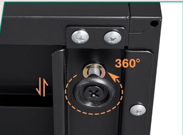
4PC Levelers keep cabinet Stable

Image: Detailed view of door magnets, lock with keys, adjustable shelf mechanism, and 360-degree adjustable leg levelers.