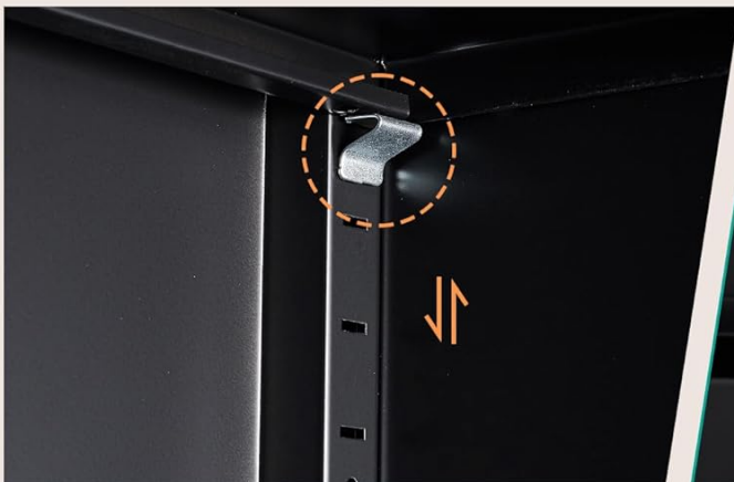
5PC Adjustable Shelves storage different sizes