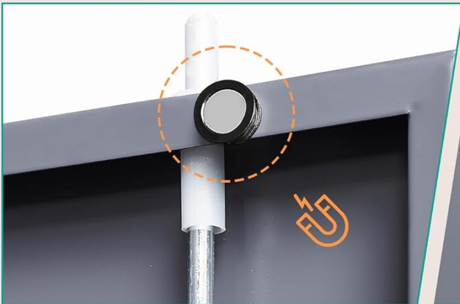
Door with Magnets keep door closed