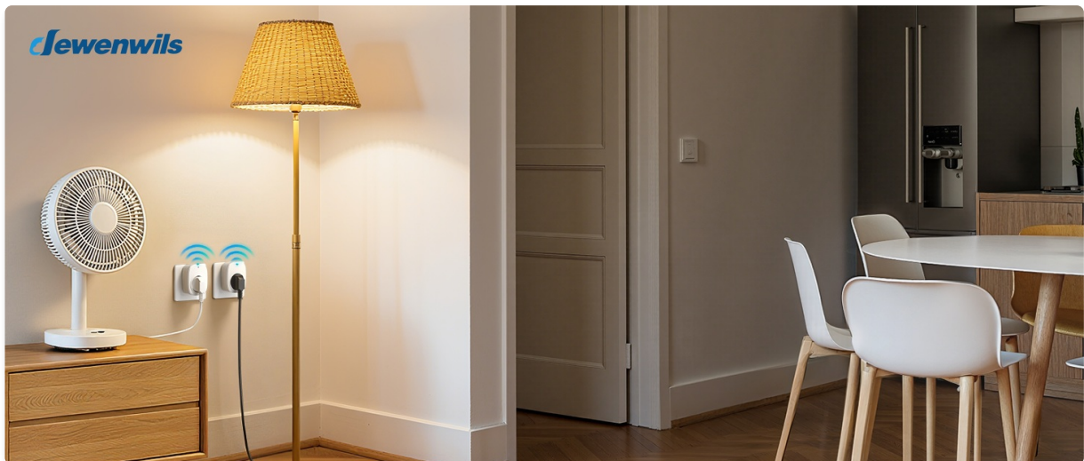
Image: DEWENWILS Remote Controlled Outlets in a home environment.

Thank you for choosing the DEWENWILS Remote Controlled Programmable Outlet Set. This product provides a convenient and efficient way to control your home appliances wirelessly. The set includes four 16A/3680W wireless plugs and one pre-paired remote control, designed for ease of use and enhanced safety.