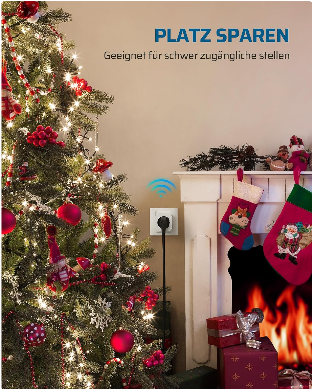
Image: One-button control for multiple devices.