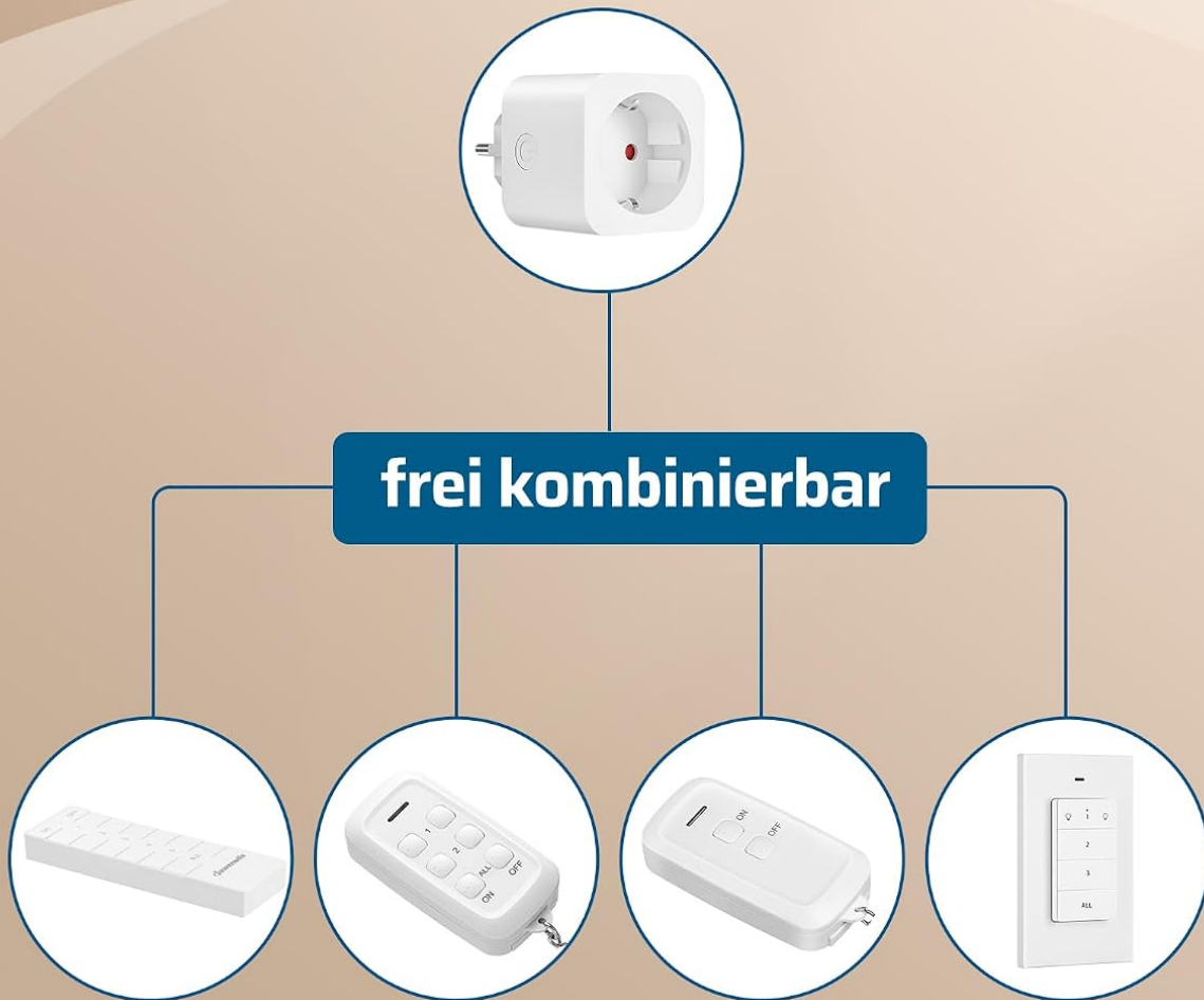
Image: Compact plug design, not blocking other outlets.

Die Verwendung von Steckdosen stört sich nicht gegenseitig und Sie können sie je nach Bedarf koppeln.