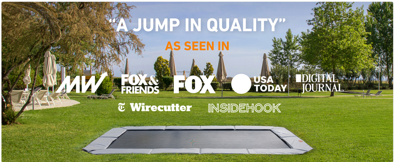
Figure 4.2: Promoting active outdoor play and safety for all ages.