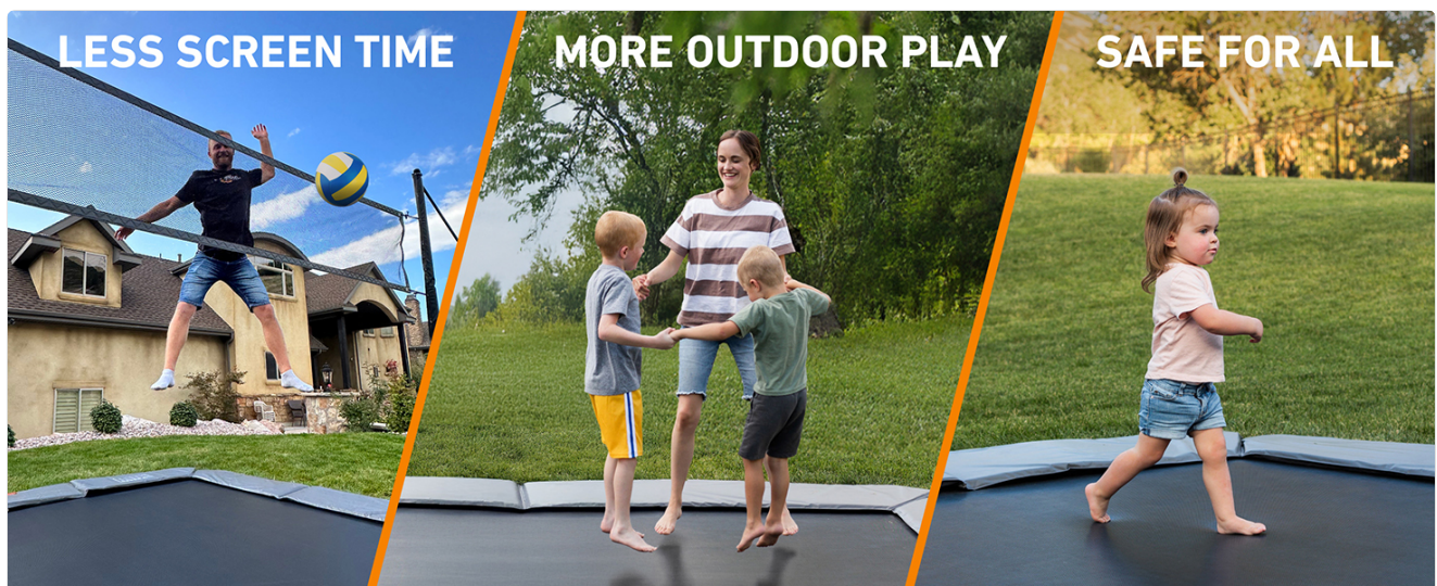
Figure 1.3: The flush-to-ground design minimizes fall risks, complemented by a heavy-duty steel frame and thick safety pads.