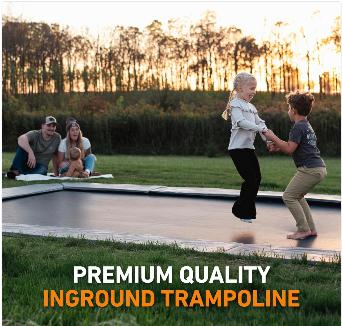
Figure 2.2: Detailed view of the trampoline's robust construction and dimensions.