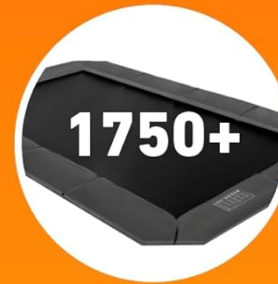
TESTED TO SUPPORT 1,750+ LBS!