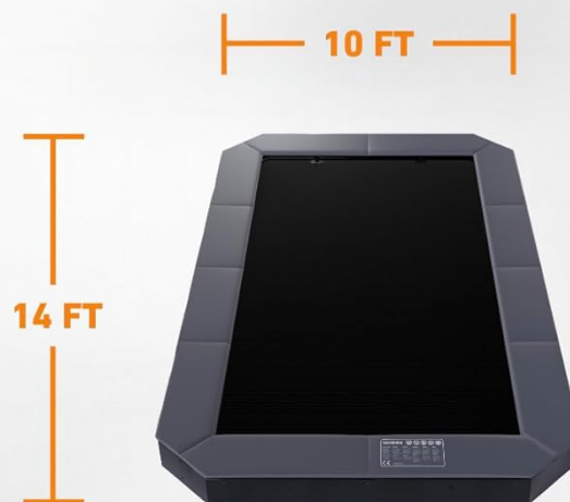
Figure 5.1: A well-maintained trampoline in its environment.