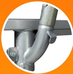
HEAVY-DUTY 11-GAUGE STEEL