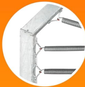
RUST-RESISTANT HOT-DIPPED GALVANIZED FRAME