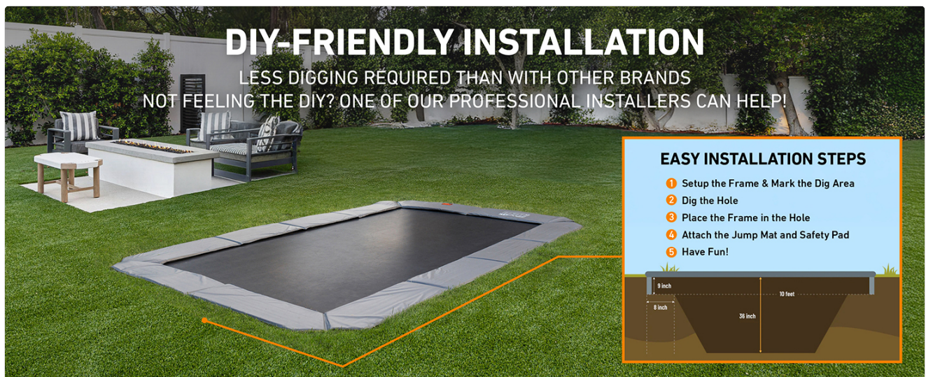
Figure 3.2: The trampoline's DIY-friendly installation process and options for professional help.