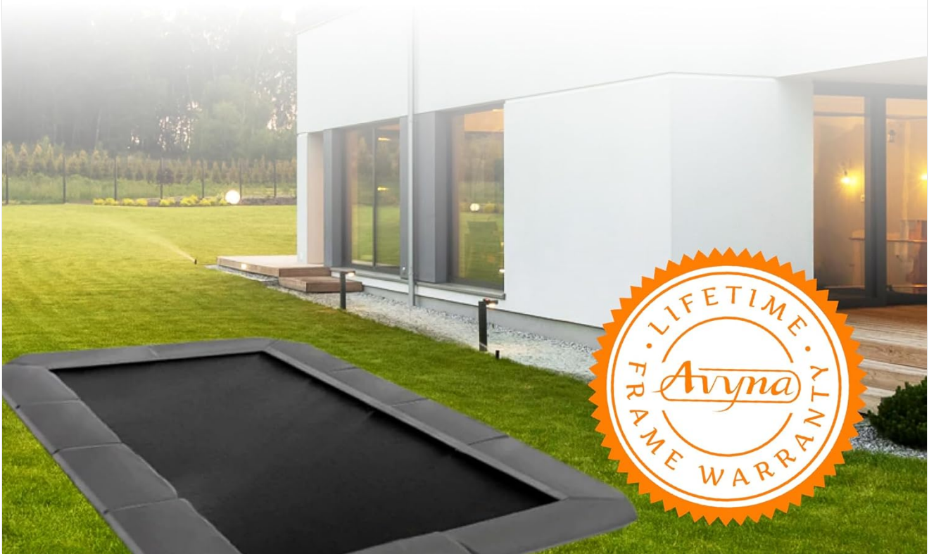
Figure 3.1: Step-by-step guide for installing your Avyna In-Ground Trampoline, including excavation details.