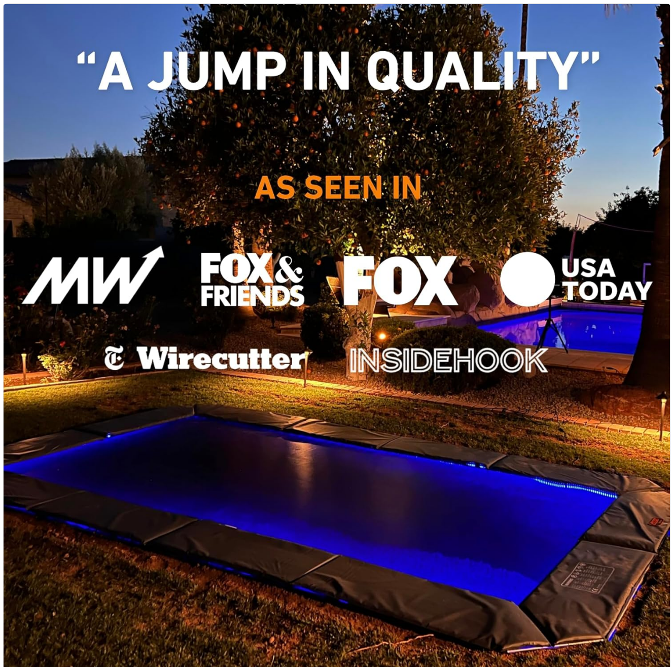
Figure 4.1: The trampoline provides fun for the entire family.