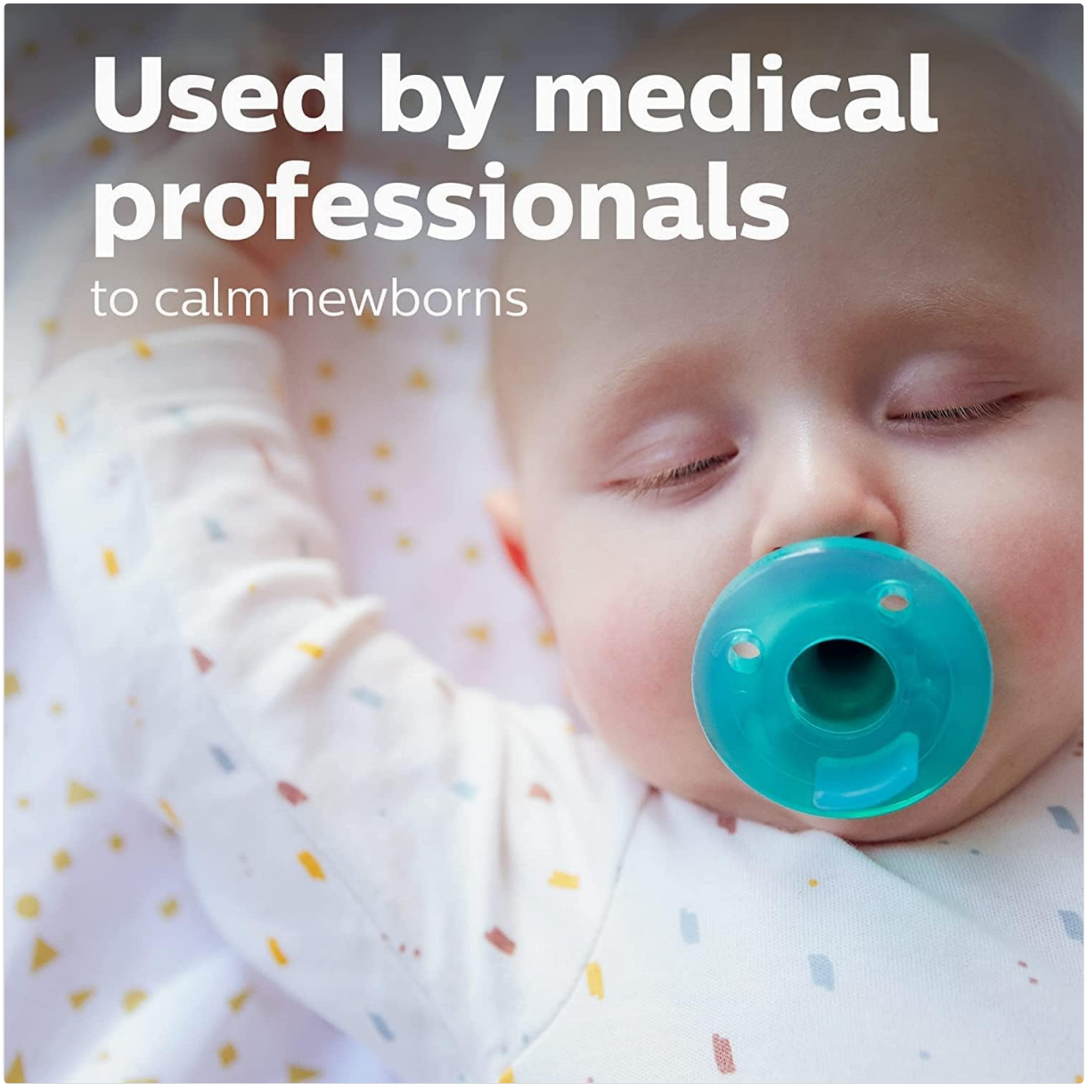
Image 4.1: The Philips Soothie Pacifier is often used by medical professionals to calm newborns.