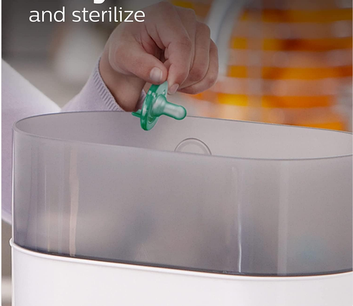
Image 3.1: The pacifier is easy to clean and sterilize for hygienic use.