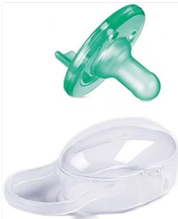
Image 1.1: Philips Soothie Pacifier (green) and its clear protective case.

The pacifier features a one-piece construction made from hospital-grade silicone, ensuring durability and ease of cleaning. Its unique design is intended to fit comfortably in a baby's mouth, promoting natural oral development. The included case provides a hygienic storage solution for the pacifier when not in use.