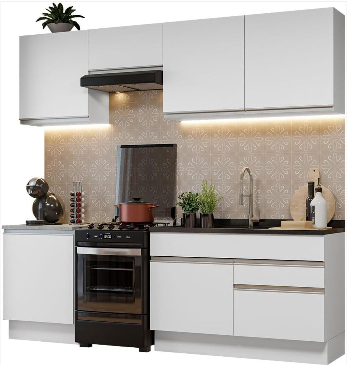
Image: Example of the Madesa Glamy 08 integrated kitchen cabinet in a kitchen environment. This image demonstrates how the various modules integrate to form a complete and functional kitchen setup, including space for a stove and sink (not included).