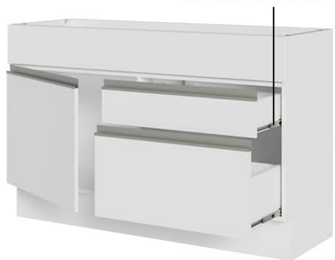
Image: Detailed view of key components. This image highlights the aluminum handles, soft-close door hinges, telescopic drawer glides for smooth operation, and the adjustable feet with a removable plinth for easy leveling and a clean finish.