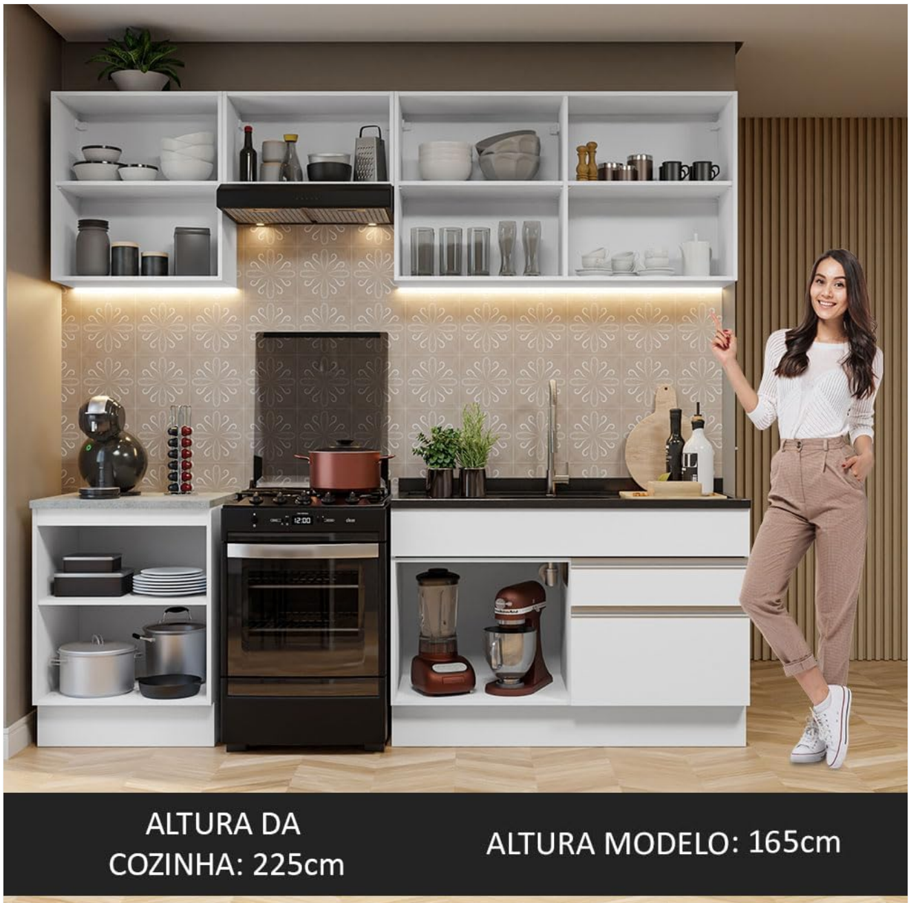
Image: Scale reference for the Madesa Glamy 08 kitchen cabinet. A person stands next to the assembled kitchen, illustrating its height of 225cm and overall presence in a kitchen space.