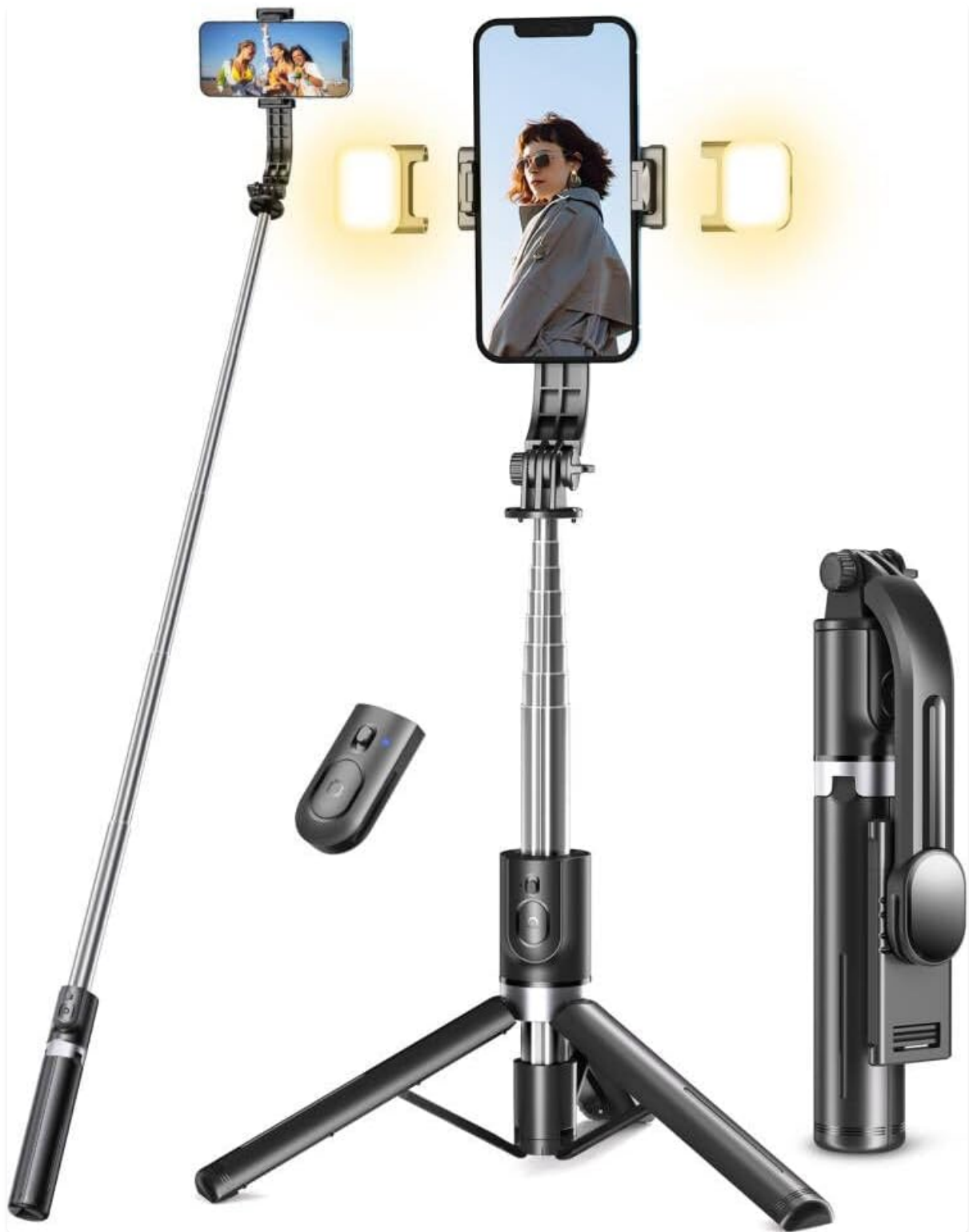
The Pntri Selfie Stick Tripod with Light in its various configurations: extended selfie stick, stable tripod, and compact folded state.