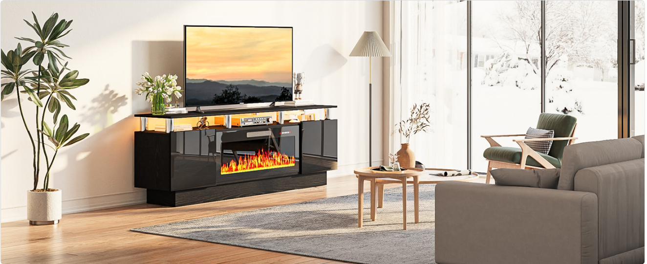
Image 3.1: The TV stand and electric fireplace are shipped in two separate packages.

Your BOSSIN Fireplace TV Stand will arrive in two separate packages, typically delivered on different days. Please ensure you have received both packages before beginning assembly.