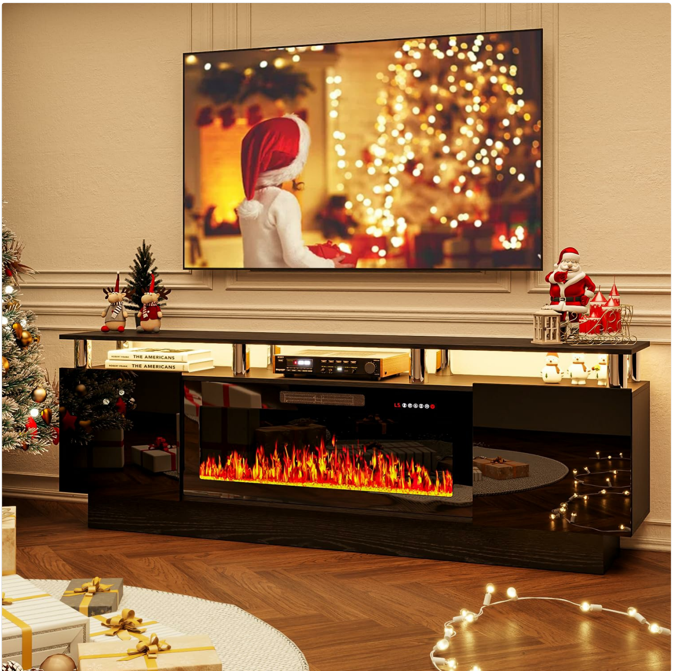
Image 1.1: The BOSSIN 70-inch Fireplace TV Stand with Electric Fireplace.