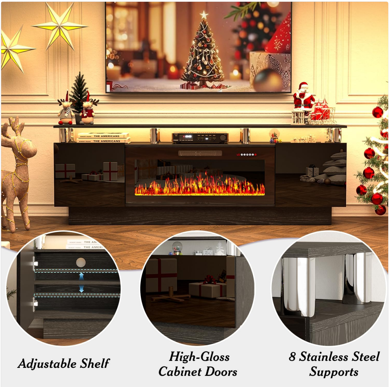
Image 4.1: Key features like adjustable shelves, high-gloss cabinet doors, and stainless steel supports.