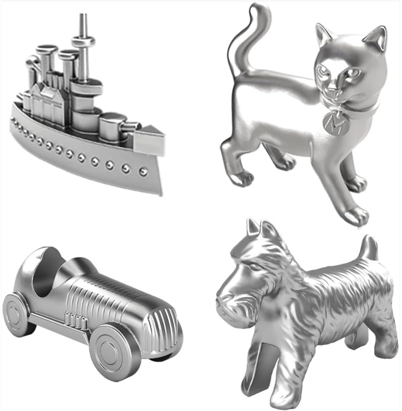
Image: Close-up view of four distinct Monopoly game tokens: a battleship, a cat, a race car, and a dog.

The game includes various tokens for players to choose from.