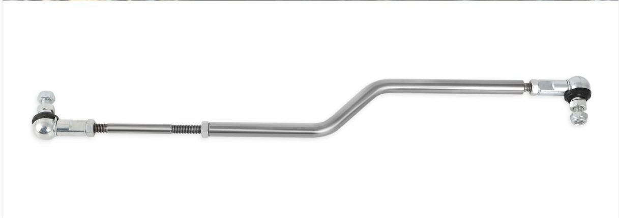
Image 1: MOTOQUEEN Throttle Linkage Assembly Rod. The main image displays the complete throttle linkage rod, featuring ball studs at both ends and a threaded adjustment section. An inset shows the rod installed on a P-Pump engine, highlighting its connection points.