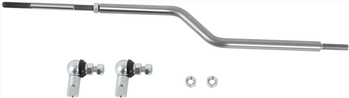
Image 3: Throttle Linkage Components. This image provides a detailed view of the individual components of the throttle linkage assembly, including the main rod, two ball studs, and associated nuts, aiding in component identification during installation.