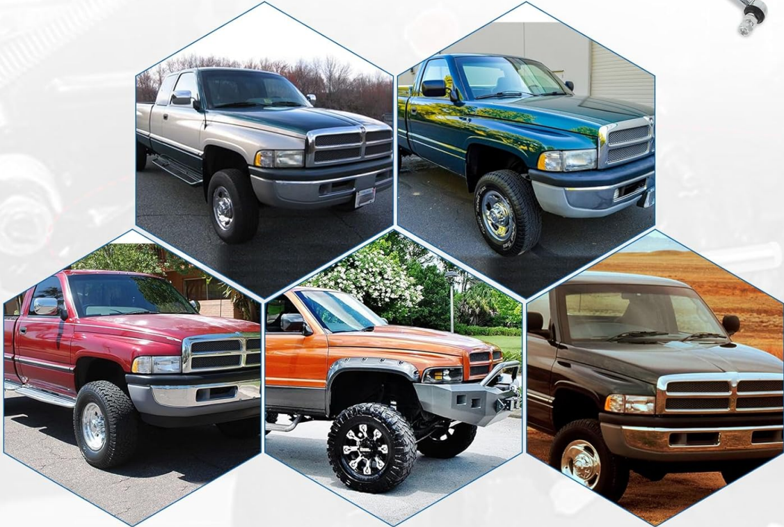
Image 2: Compatibility Overview. This image visually confirms the product's compatibility by displaying the throttle linkage rod alongside several models of Dodge Ram 2500 and 3500 trucks from the 1994-1998 era.