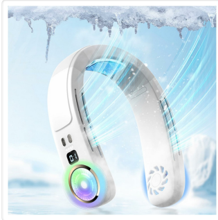
The yAyusi WF-F21 Neck Fan, showcasing its overall design.