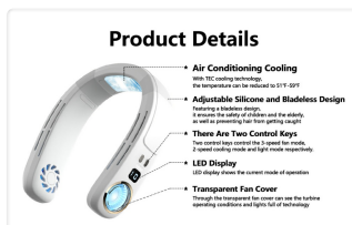
Detailed view of the LED display and control buttons for fan speed, cooling, and lighting.