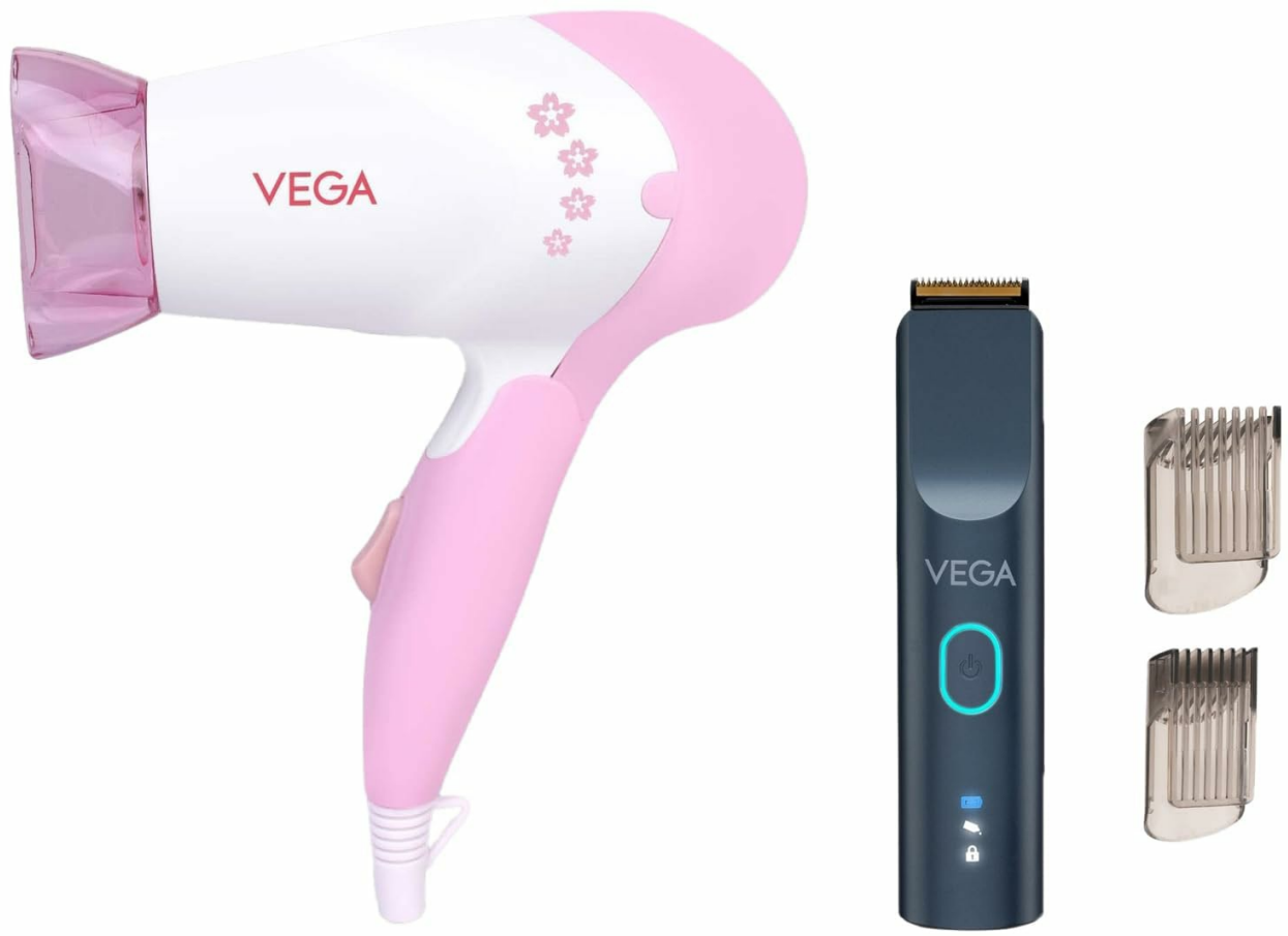
Image 1.1: Vega Smartone S2 Beard Trimmer and Insta Glam 1000W Hair Dryer.

This image displays both the Vega Smartone S2 Beard Trimmer and the Vega Insta Glam 1000W Hair Dryer together, showcasing the complete product package.