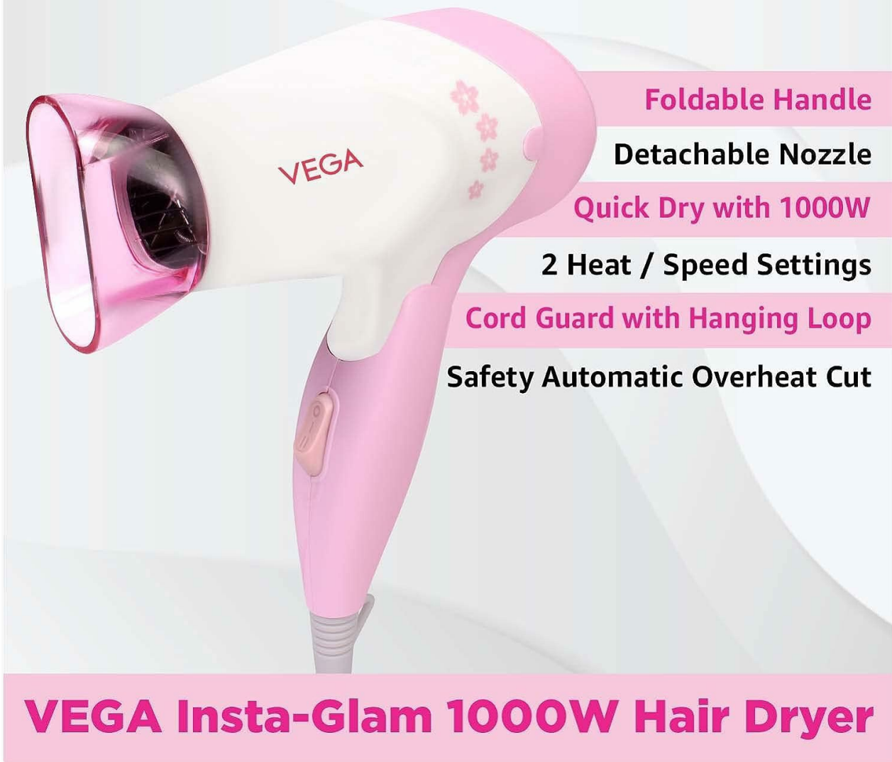
Image 3.2.2: Key features of the Vega Insta Glam 1000W Hair Dryer.

This image details the features of the Vega Insta Glam 1000W Hair Dryer, including its foldable handle, detachable nozzle, 1000W quick dry capability, 2 heat/speed settings, cord guard with hanging loop, and safety automatic overheat cut.