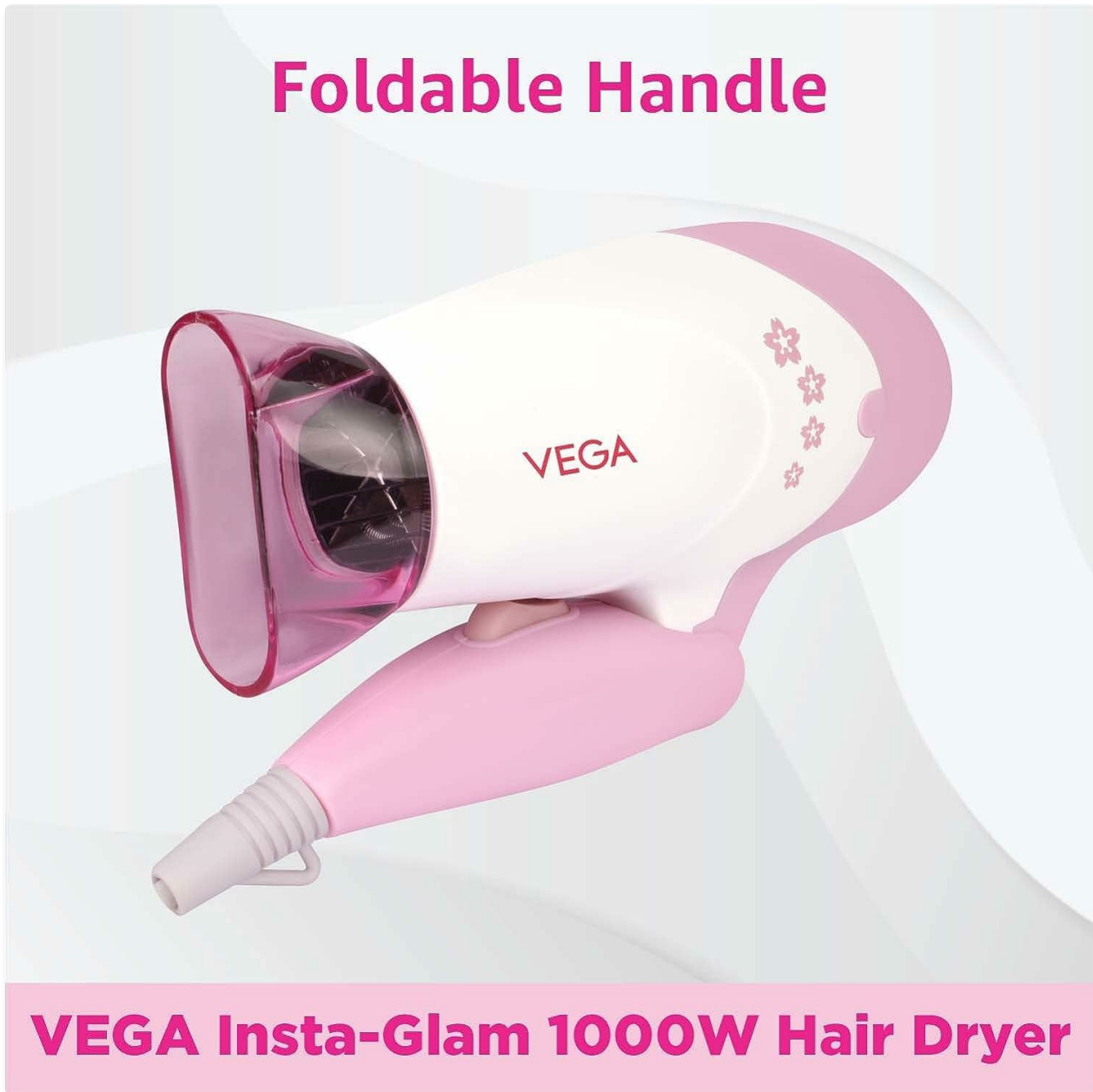
Image 6.2.1: Vega Insta Glam 1000W Hair Dryer with its foldable handle.

This image demonstrates the foldable handle feature of the Vega Insta Glam 1000W Hair Dryer, illustrating its compact design for storage and travel.