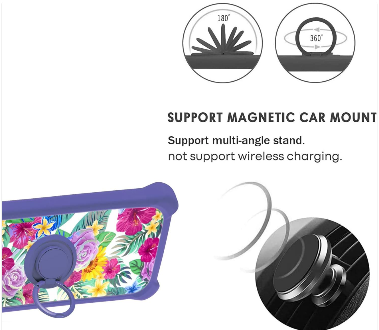
Figure 5: Demonstrates how the finger ring support enables easier one-handed operation of the phone.