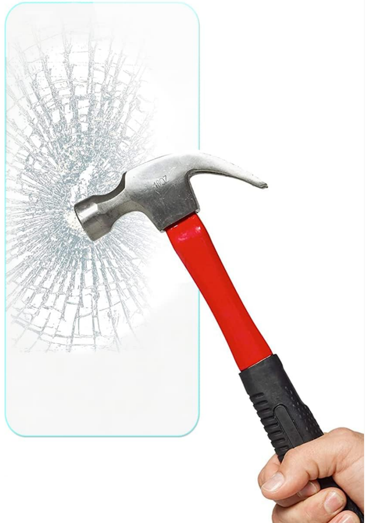
Figure 4: Key features of the tempered glass screen protector, including 9H hardness, shatterproof design, and anti-fingerprint properties.

Scratch proof screen effectively avoids sharp objects scratching or abrasion