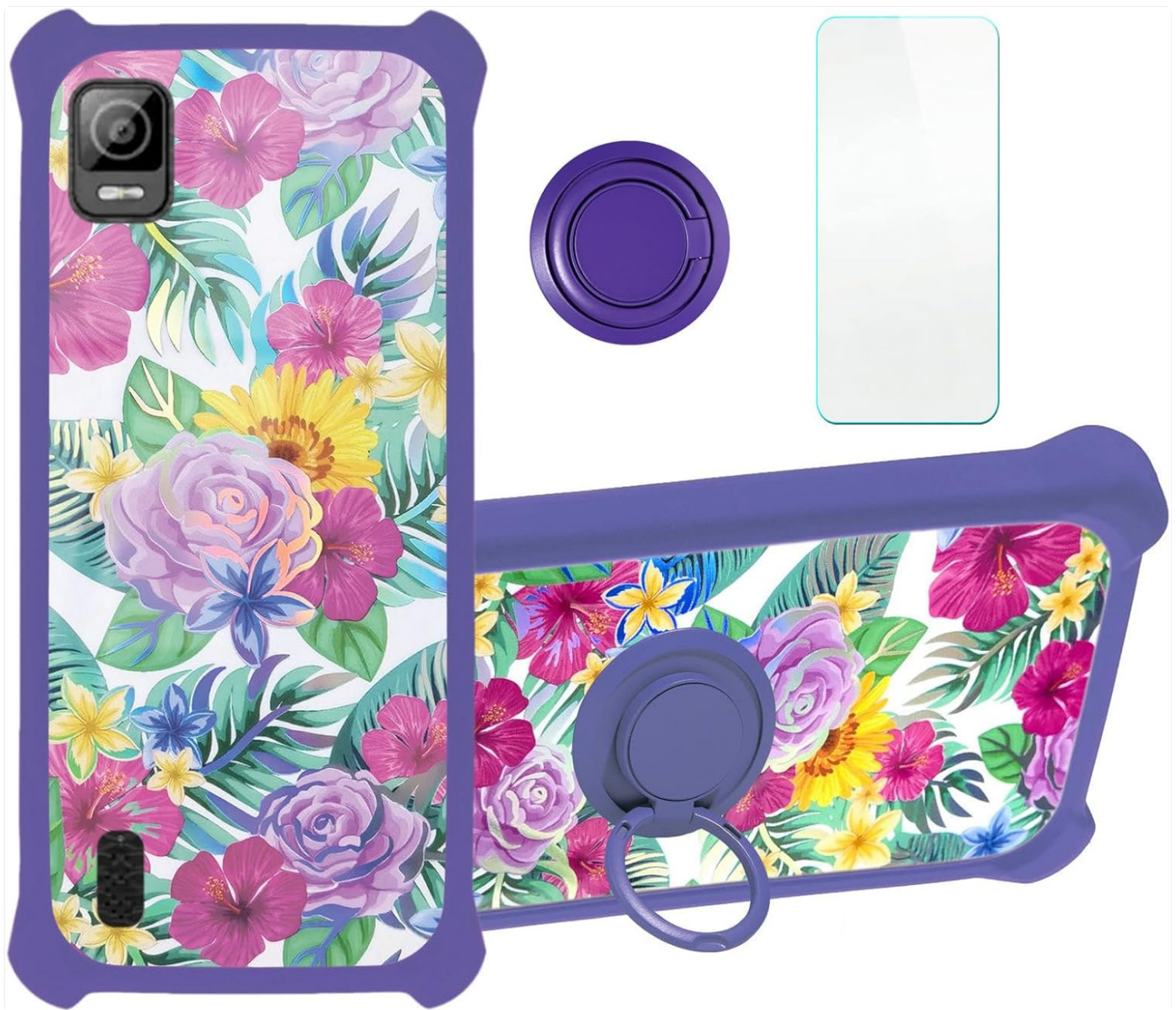
Figure 1: Overview of the Koobee K100 Phone Case, including the case, detachable ring holder, and tempered glass screen protector.