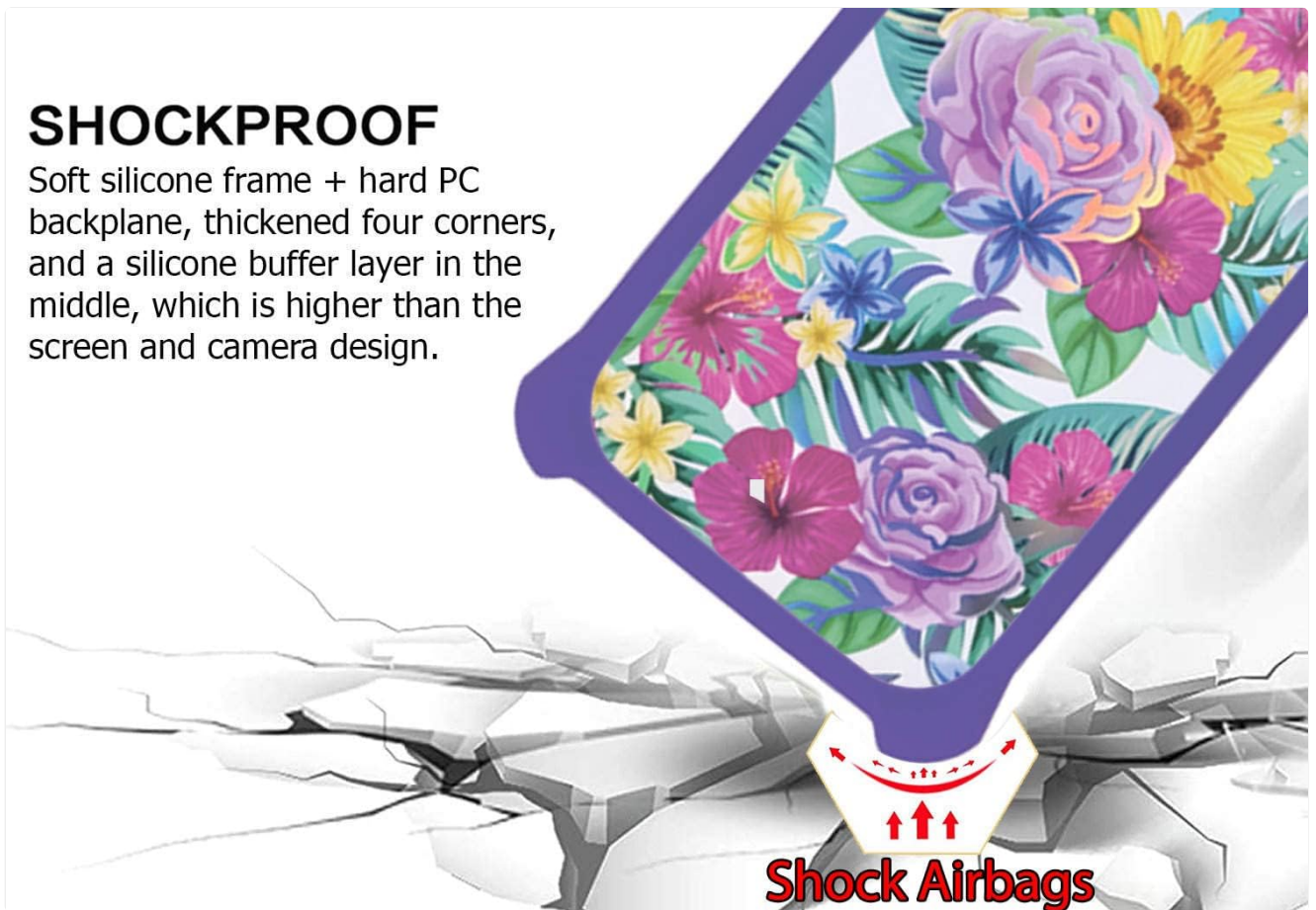
Figure 2: Illustration of the shockproof design, highlighting the reinforced corners with shock airbags for impact absorption.

Soft silicone frame + hard PC backplane, thickened four corners, and a silicone buffer layer in the middle, which is higher than the screen and camera design.