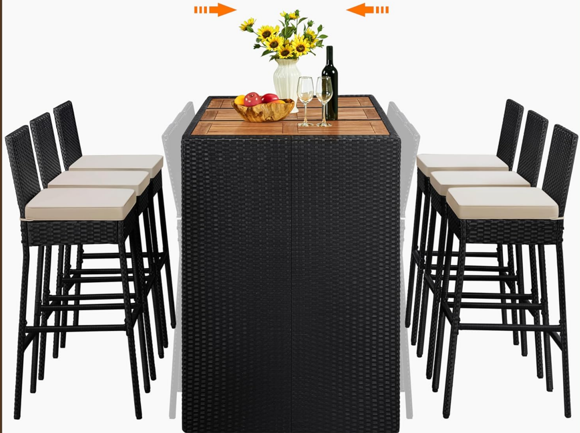
Figure 8: Chairs can be stored compactly under the table.

All the chairs can be easily stored beneath the table to save space when not in use.