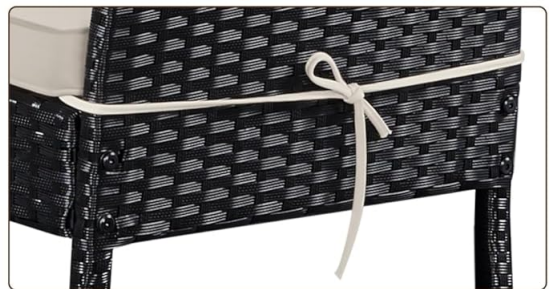
Cushion w/ fixing straps