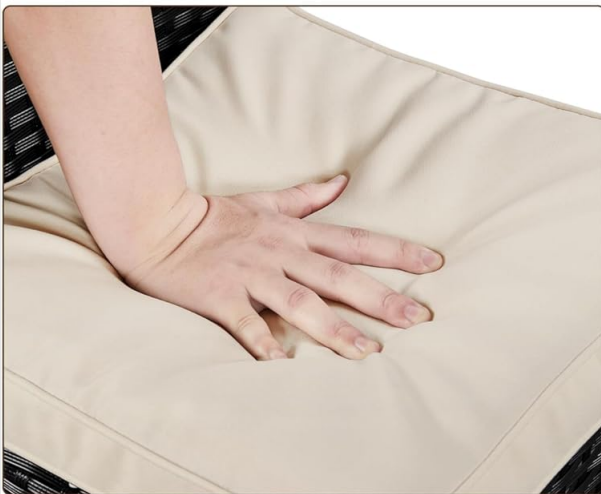
2.2" high density foam increases comfort