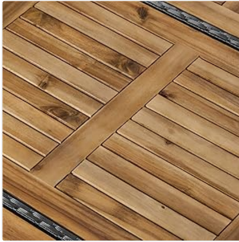
Figure 3: Detail of table frame assembly points.