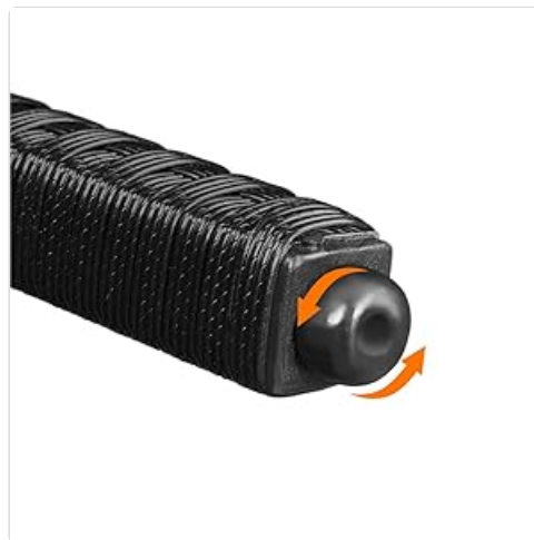
Figure 6: Adjustable non-slip footpads for stability.