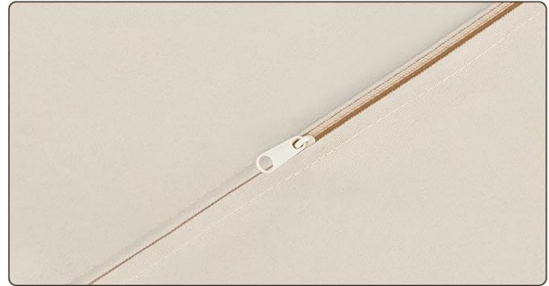
Cushion w/ zipper for convenient removing and washing