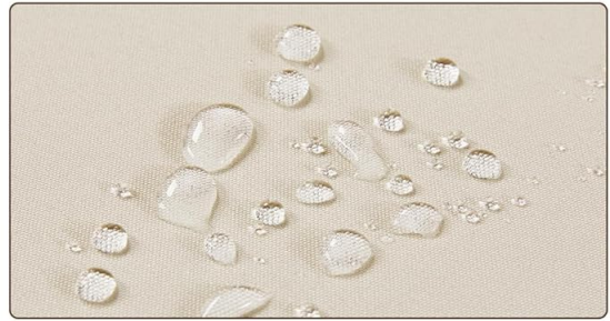
Cushion w/ waterproof fabric cover (not recommended for use in the rain)