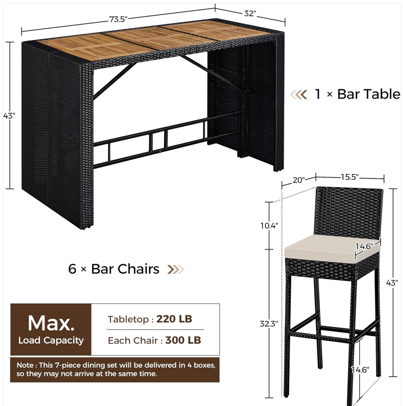
Figure 2: Overview of main components and their dimensions.