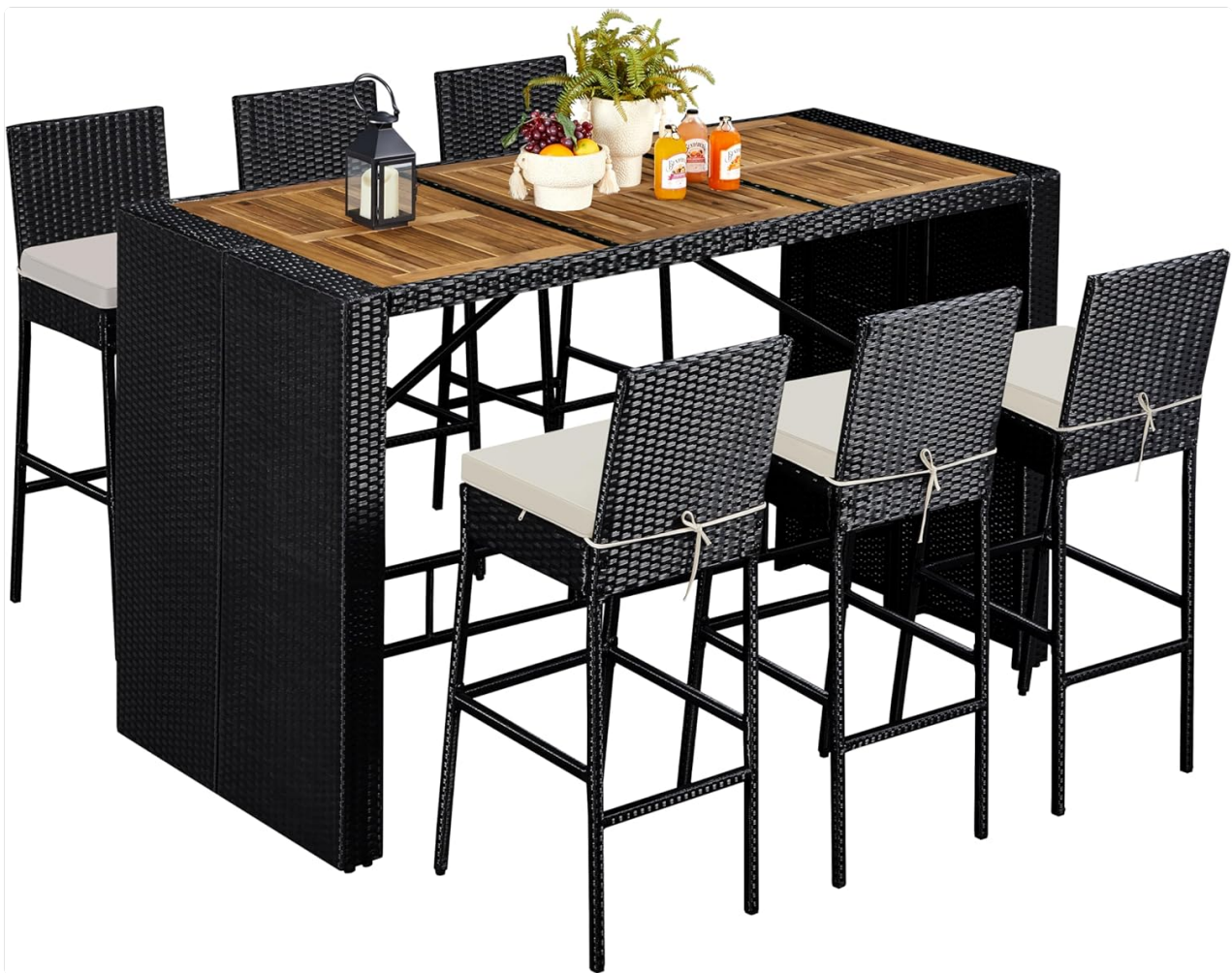
Figure 1: The Yaheetech 7 Piece Patio Dining Set, showcasing the bar table and six chairs.

The set features an elegant acacia wood tabletop known for its natural beauty and resistance to water and scratches, ensuring easy maintenance. The chairs are equipped with foam-padded cushions for added comfort, and the entire structure is built with weather-resistant PE rattan and a reinforced metal frame for superior strength. Adjustable footpads on the table provide stability on uneven ground, and the chairs can be conveniently stored beneath the table to save space when not in use.