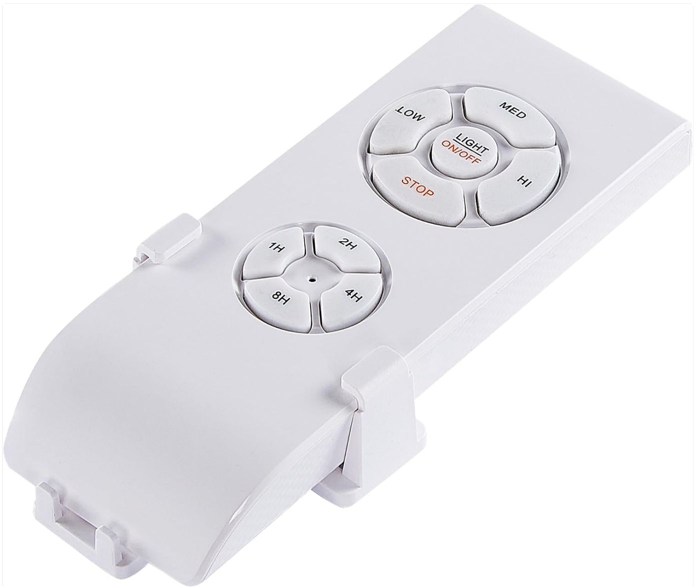
Image: The remote control included with the Beliani Malad Ceiling Fan. It features buttons for fan speed (Low, Med, Hi), power (Light On/Off, Stop), and a timer function (1H, 2H, 4H, 8H).