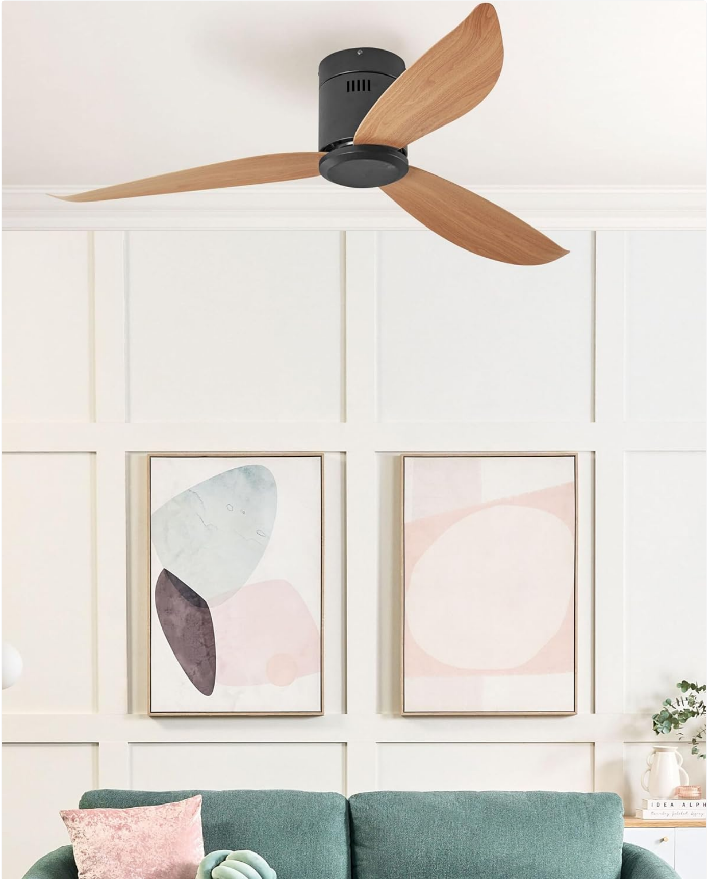
Image: The Beliani Malad Ceiling Fan with its three wood-effect blades and black motor housing, installed on a white ceiling in a modern