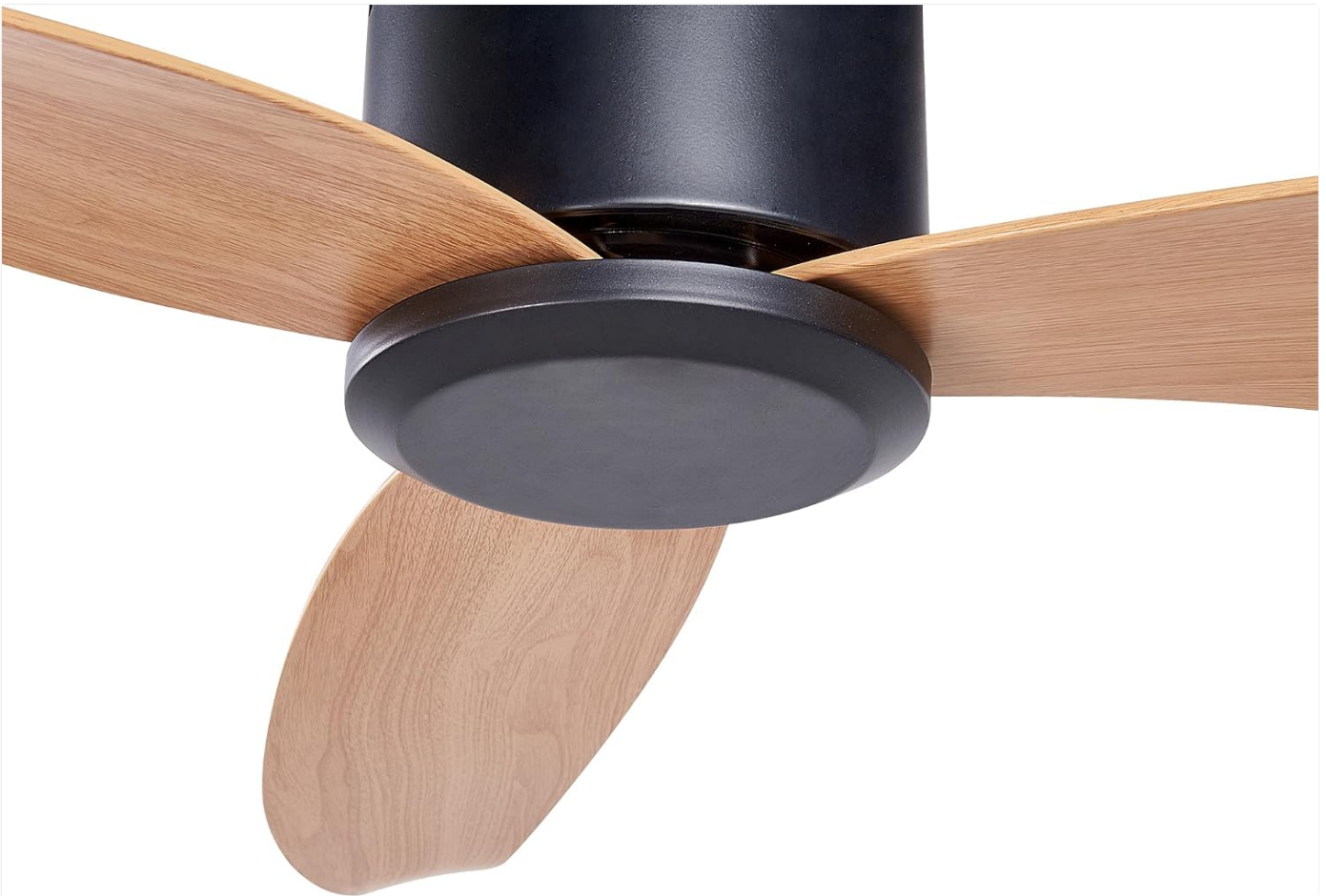
Image: A close-up view of the Beliani Malad Ceiling Fan's black metal motor housing and the point where the light wood-effect blades attach, illustrating the design and connection points.