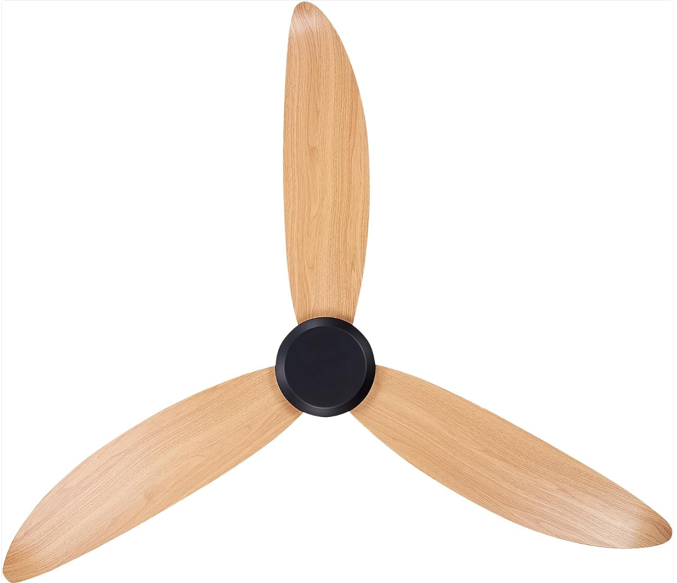
Image: A top-down view of the Beliani Malad Ceiling Fan, showcasing its three light wood-effect blades radiating from the central black motor housing.