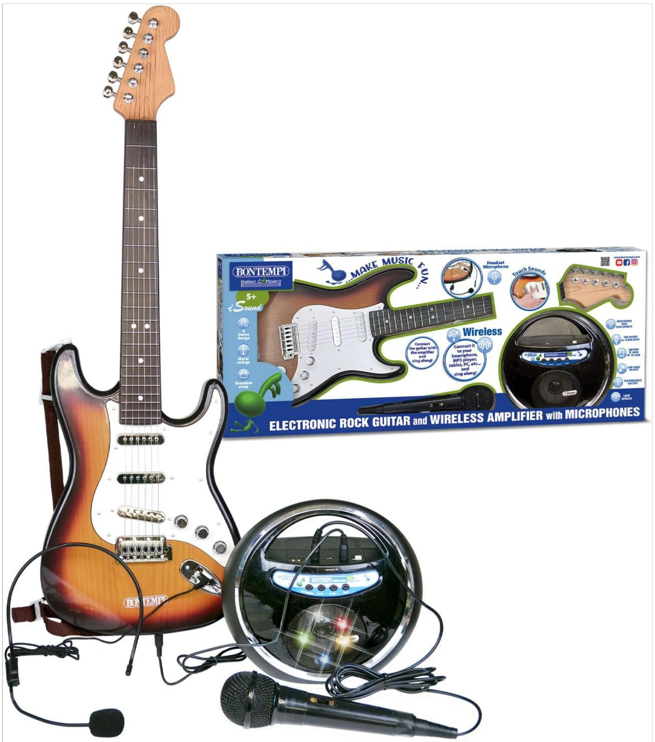
Image: Close-up of the electronic guitar and wireless amplifier, illustrating their design and potential battery compartment locations.