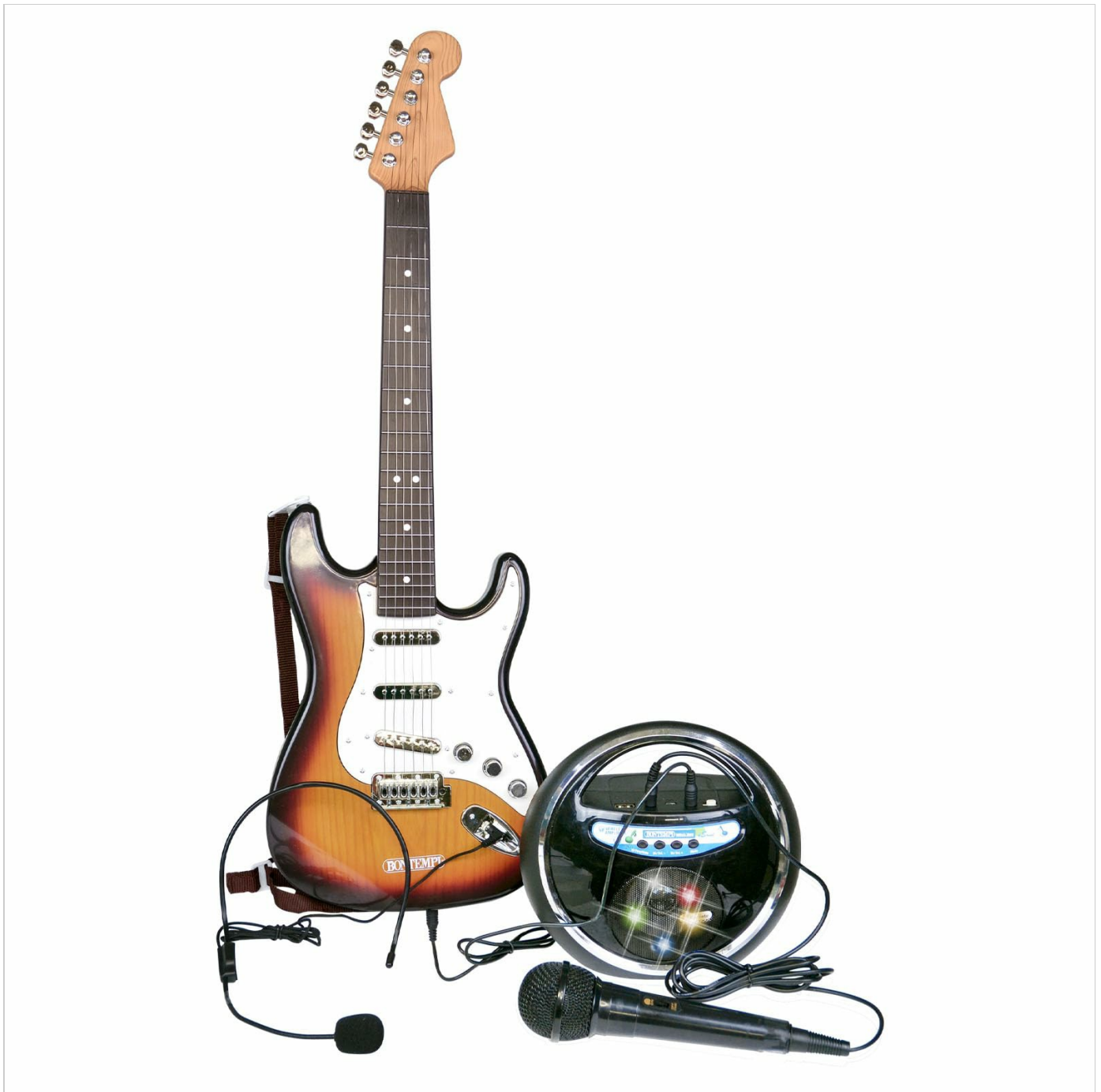
Image: The complete Bontempi RockMaster set, including the electronic guitar, wireless amplifier, microphone, and product packaging.