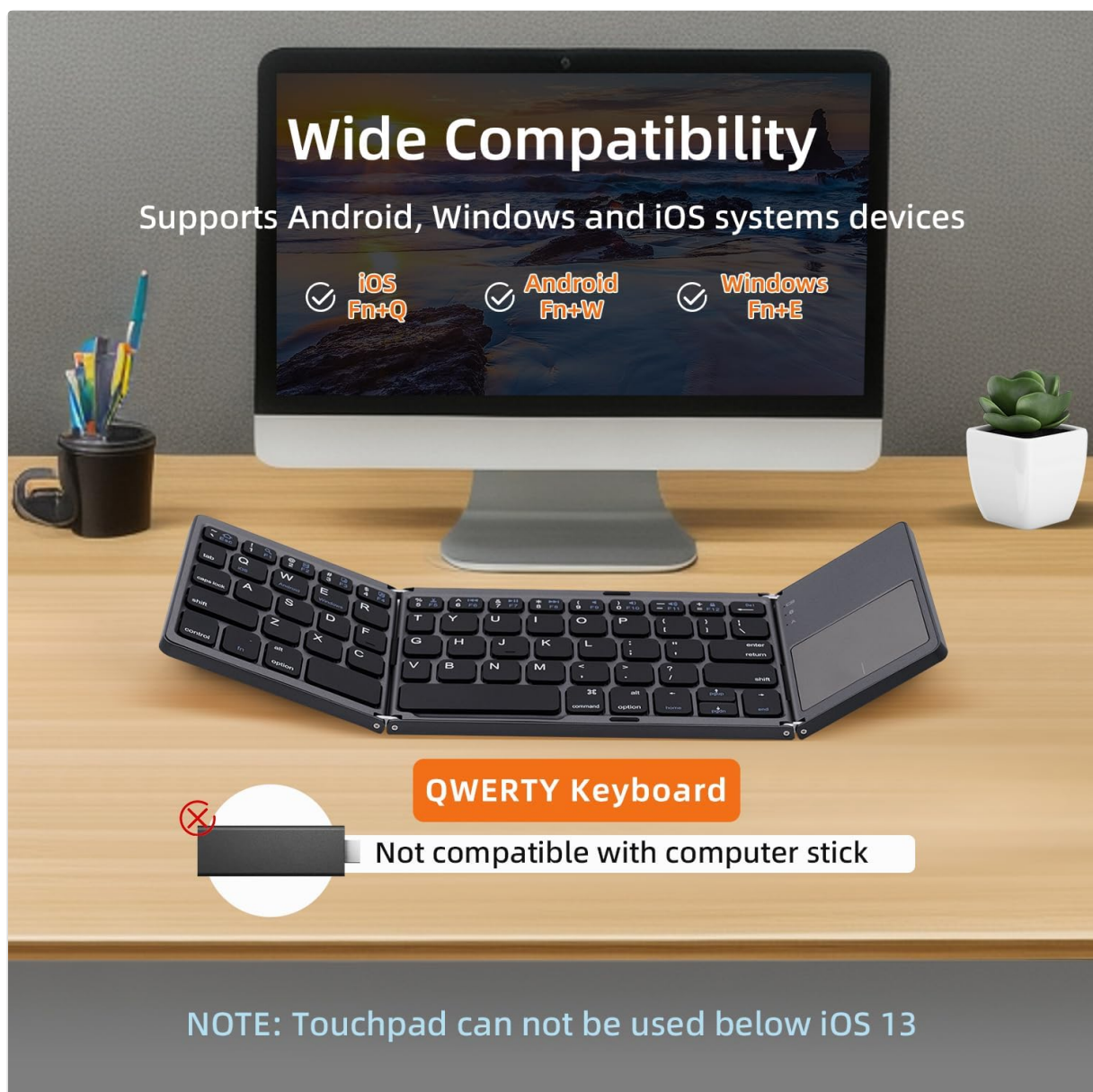
Image 2.1: Visual representation of the keyboard's wide compatibility, supporting Android, Windows, and iOS systems. It highlights the QWERTY layout and notes that the touchpad is not compatible with iOS versions below 13.