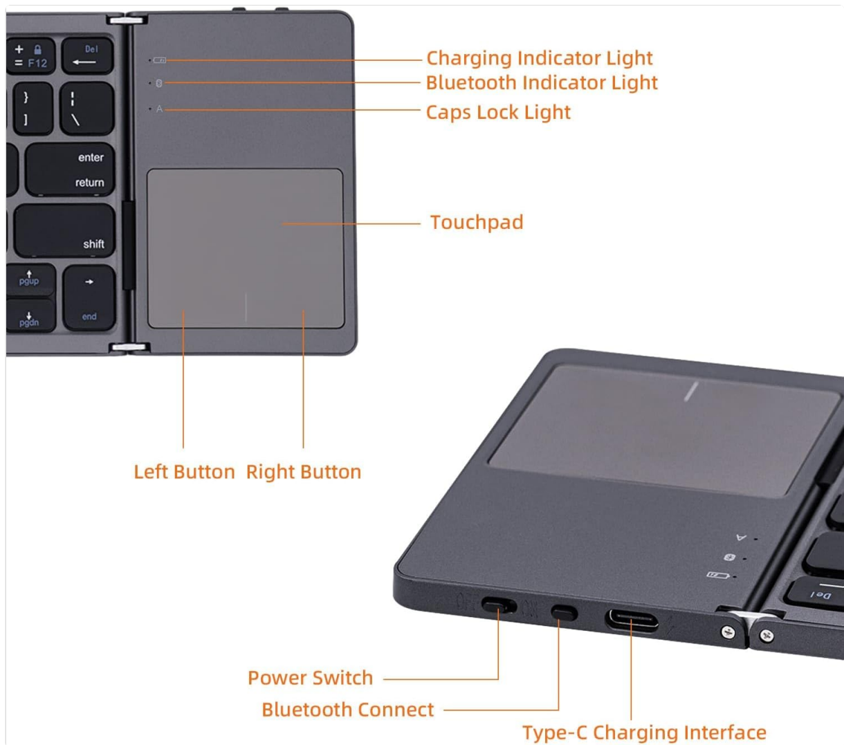
Image 3.1: Detailed view of the keyboard's components, including the Charging Indicator Light, Bluetooth Indicator Light, Caps Lock Light, Touchpad, Left Button, Right Button, Power Switch, Bluetooth Connect button, and Type-C Charging Interface.