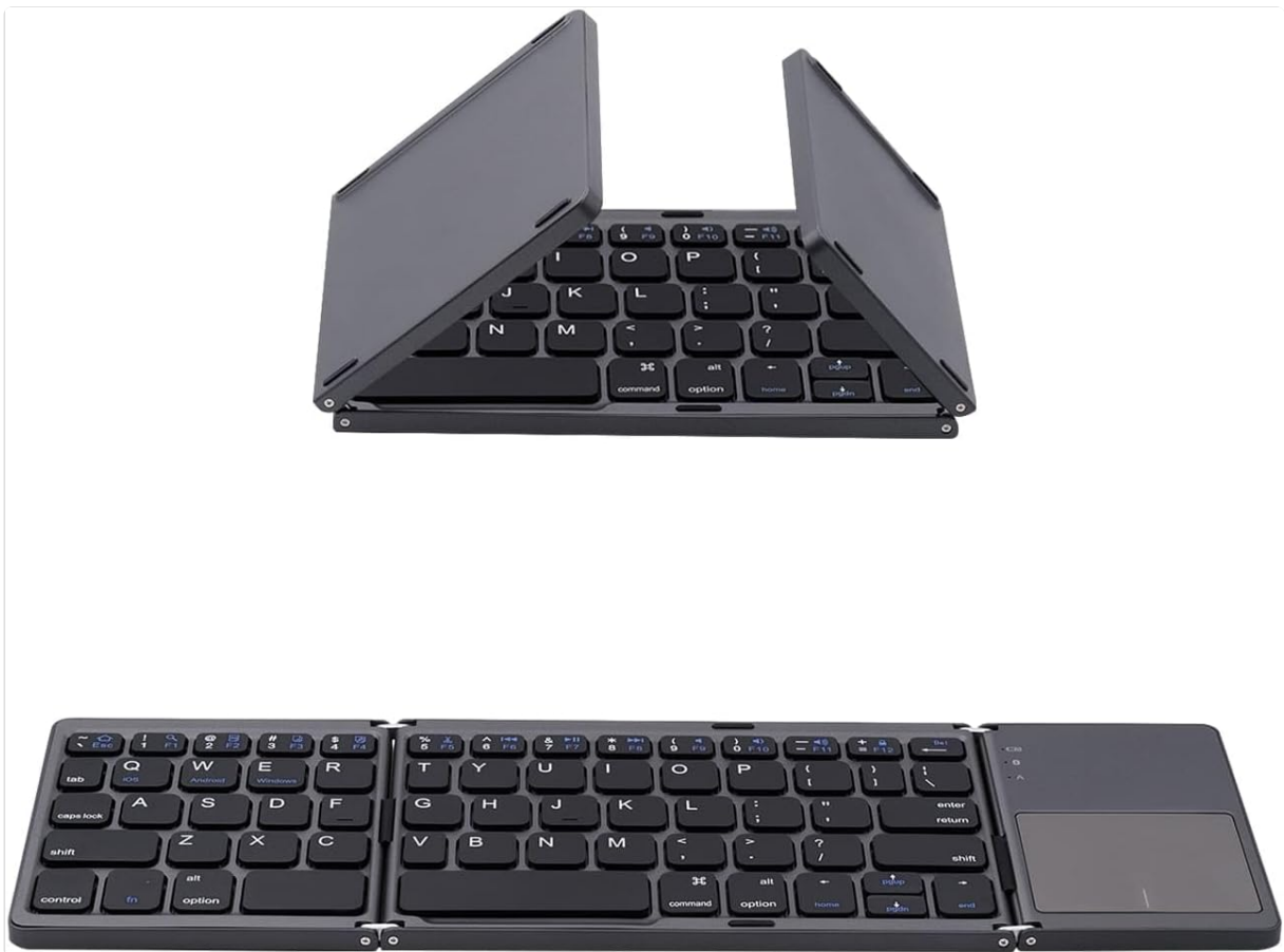
Image 1.1: The Mcbazel Foldable Bluetooth Keyboard shown in both its compact, folded state and fully extended for use. This illustrates its portability and full keyboard layout.

Thank you for choosing the Mcbazel Foldable Bluetooth Keyboard. This ultra-thin, portable wireless keyboard with a numeric keypad is designed for seamless compatibility with Mac, iOS, Android, and Windows devices. Its compact and lightweight design makes it ideal for travel, business trips, and everyday use. This manual will guide you through the setup, operation, and maintenance of your new keyboard.