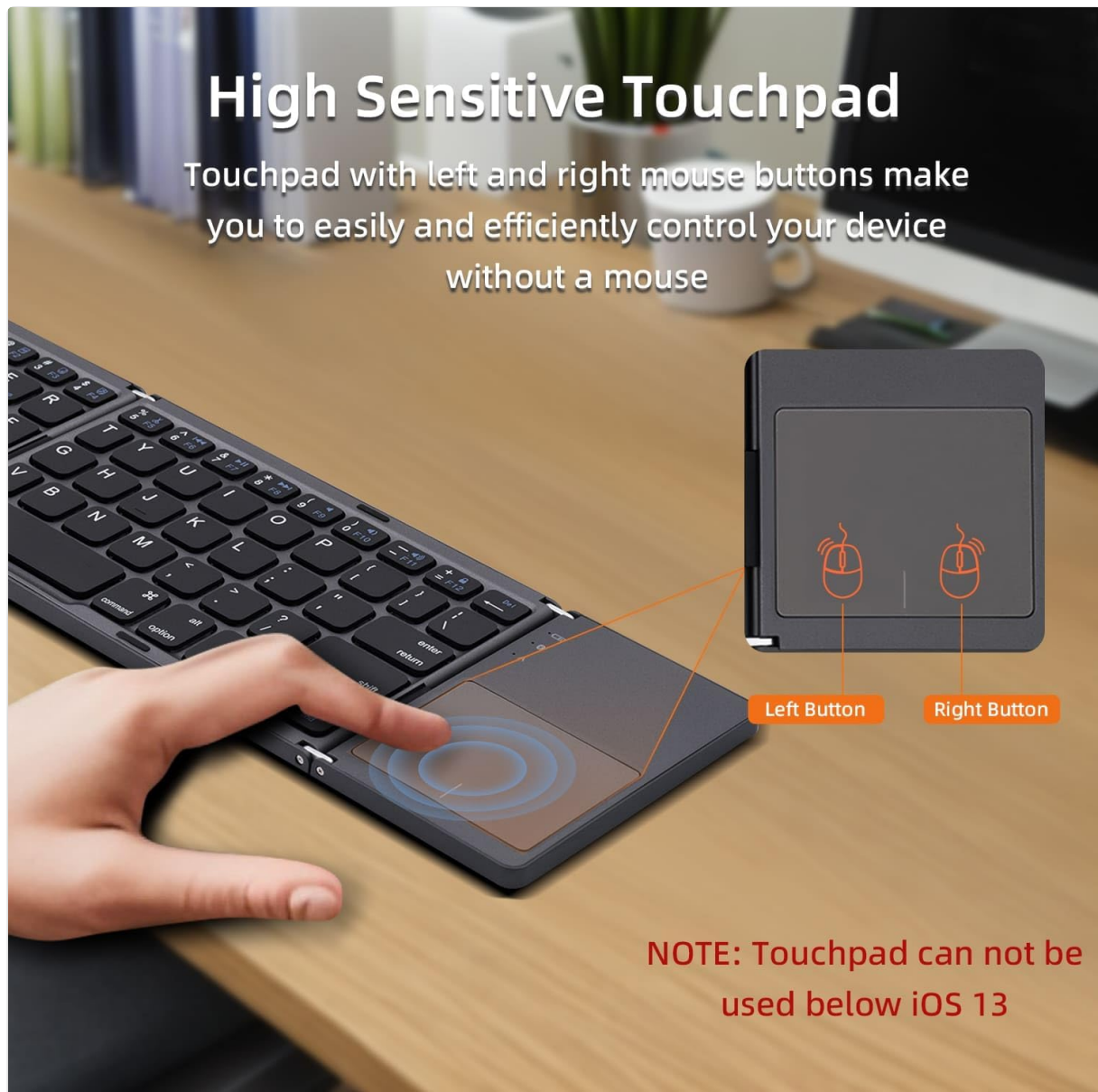
Image 4.1: Close-up of the high-sensitive touchpad, indicating the areas for left and right mouse button clicks, enabling

The integrated touchpad functions similarly to a laptop touchpad, allowing you to control your device without a separate mouse. It supports standard gestures.