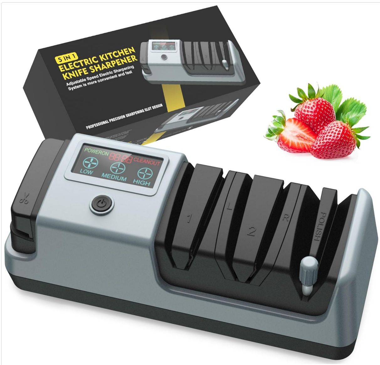
Figure 1: YOORLEAY 5-in-1 Electric Knife Sharpener. This image displays the sharpener unit alongside its packaging, highlighting its compact design and the various sharpening slots.