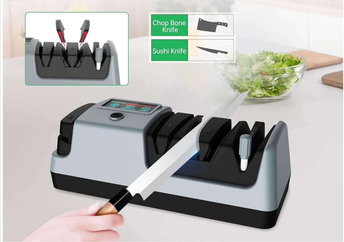
Figure 5: The convertible slot with baffles pulled out, illustrating how it accommodates wider blades such as chop bone knives and sushi knives.

Pull out the baffles. The slot angle (left/right) enlarges to 32.5°, suitable for regular chop bone knife, sushi knife, etc.