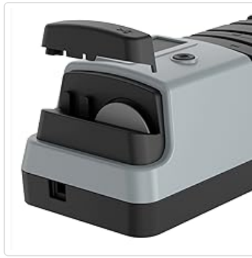
Figure 7: An example of a removable cover on the sharpener, which may indicate access for cleaning or maintenance of internal components.