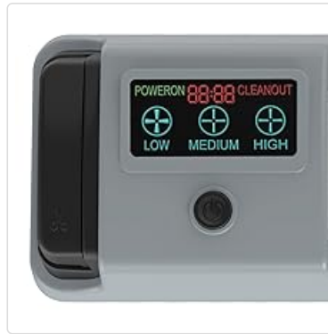
Figure 3: Control panel displaying LOW, MEDIUM, and HIGH speed options, along with the power button and 'CLEANOUT' indicator.

The sharpener offers three rotational speed settings: LOW, MEDIUM, and HIGH. Select the appropriate speed based on the type of blade and desired sharpening intensity.