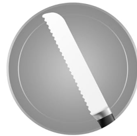
Figure 4: Visual guide demonstrating the sharpening process for straight blade, ceramic, and serrated knives using the designated slots.