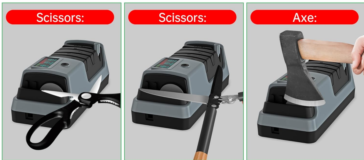
Figure 6: Examples of sharpening scissors, garden shears, and an axe using the dedicated scissors slot and the manual polishing rod.

Important: Always clean the blade thoroughly after sharpening to remove any metal particles.