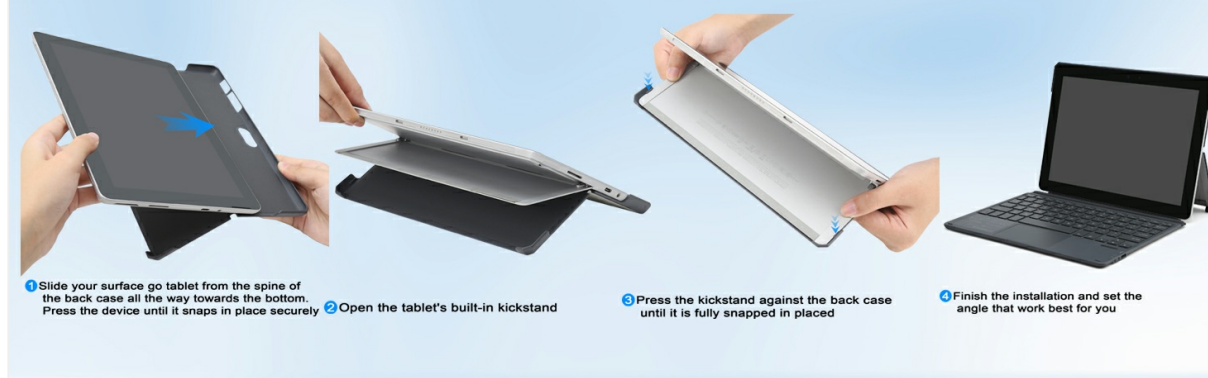
Figure 4.2: Surface Go Case Installation Steps