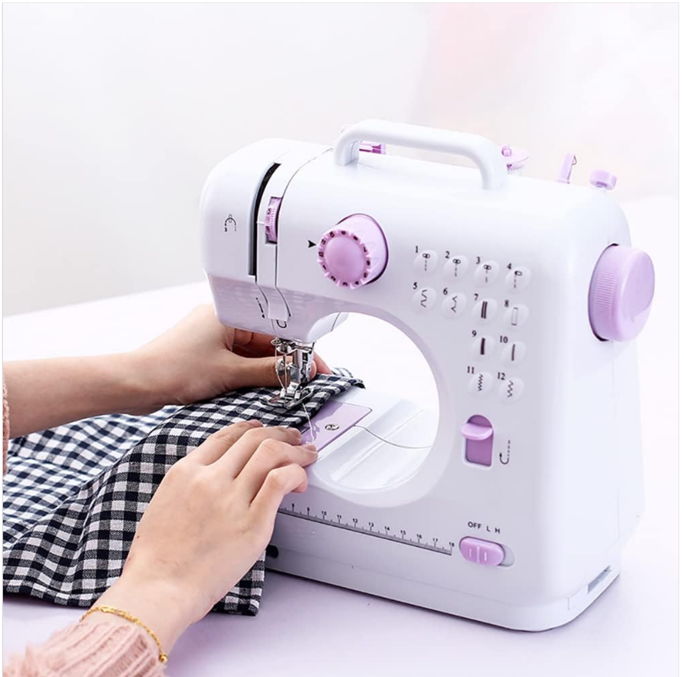
Figure 3.2: A user demonstrating the operation of the sewing machine, showing how fabric is guided under the needle.