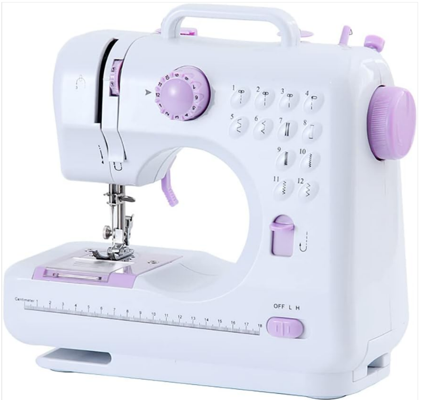
Figure 3.1: Front view of the Mini Electric Household Sewing Machine. This image displays the overall design, including the needle area, presser foot, stitch selector dial, and power switch.