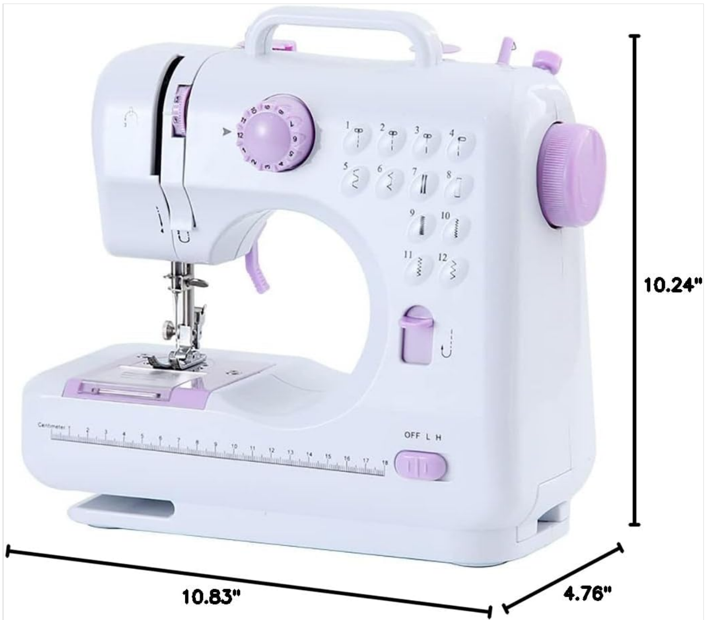
Figure 3.4: Diagram illustrating the dimensions of the sewing machine: 10.83 inches (width), 4.76 inches (depth), and 10.24 inches (height).