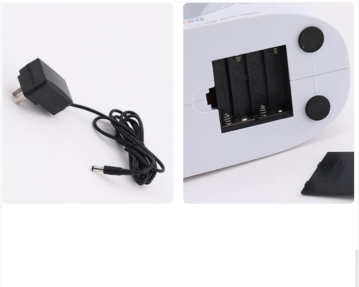
Figure 4.1: Image showing the power adapter and the battery compartment located on the underside of the sewing machine.