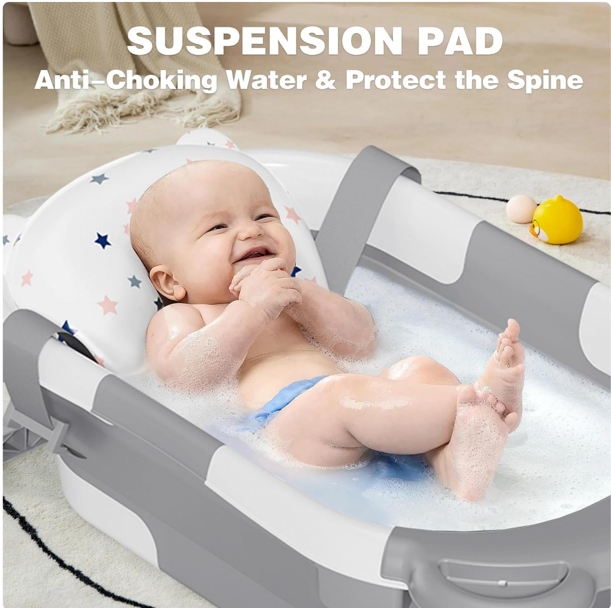
Figure 4: Baby bathing with the floating cushion.