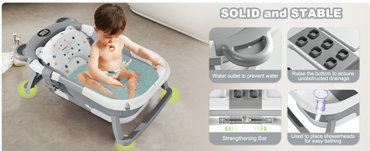
Figure 3: Real-time temperature measurement on the bathtub.