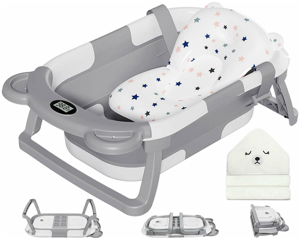
Figure 1: MoreFeel Collapsible Baby Bathtub with included accessories.