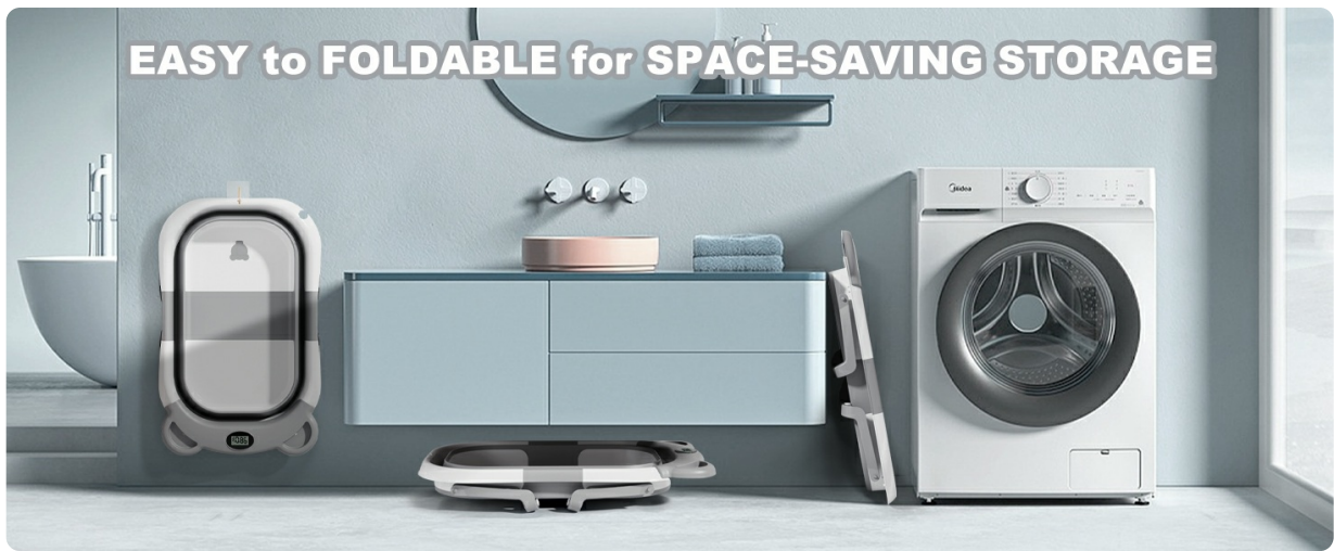
Figure 2: Visual guide for unfolding the bathtub.