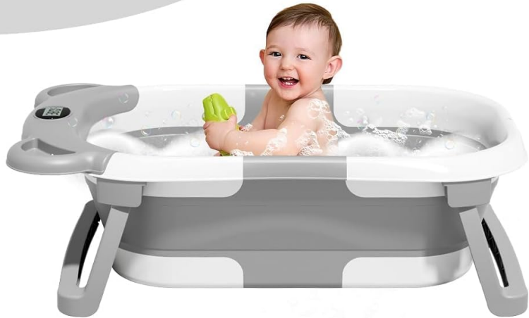
Figure 5: Recommended age ranges and bathing positions.