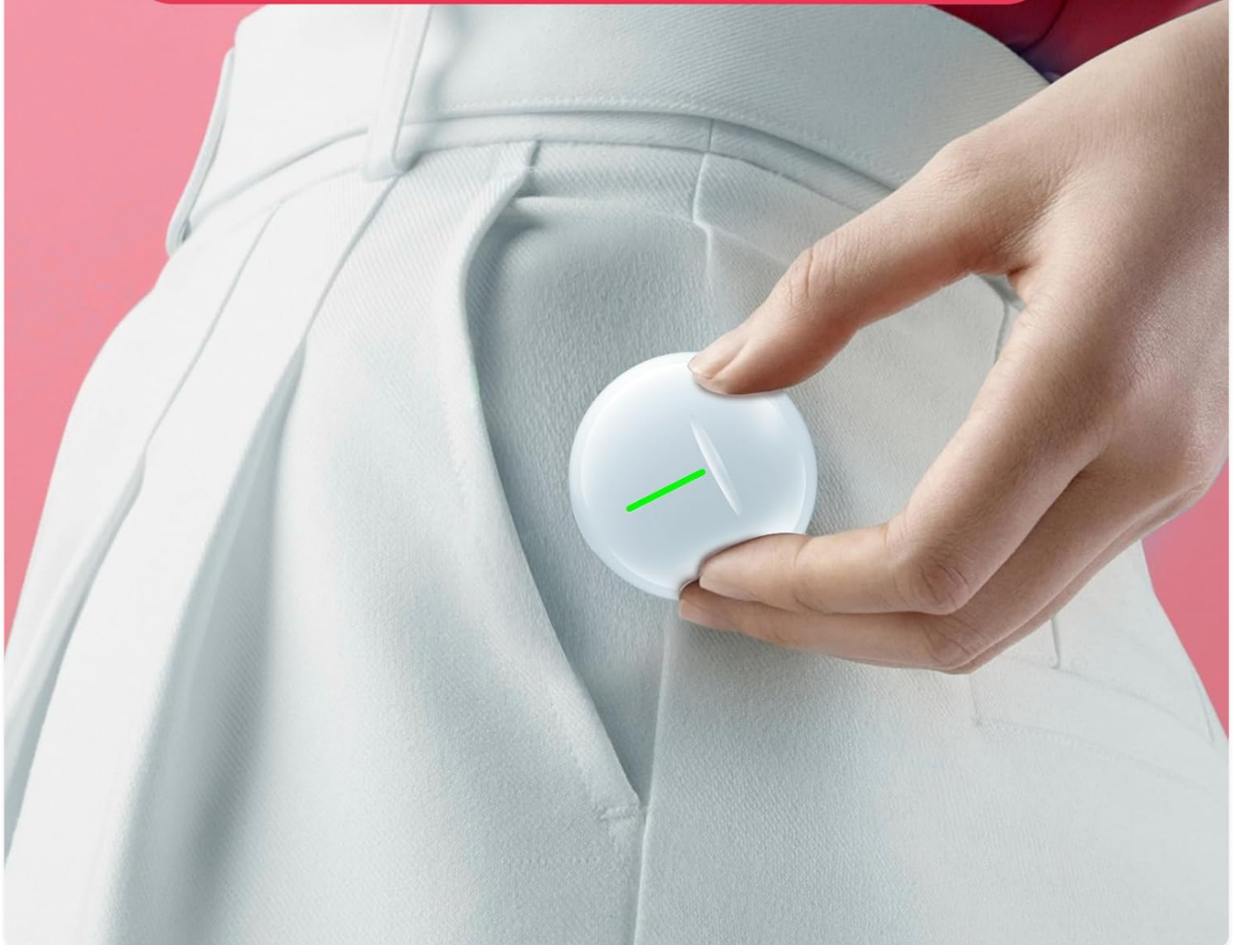
Image: A hand holding the MoreJoy M2 Mini charging case, demonstrating its compact and lightweight design, easily fitting into a pocket.

The MoreJoy M2 Mini earbuds are designed for comfort and portability. Each earbud weighs approximately 3g, ensuring a comfortable fit for extended periods. The compact charging case allows for easy storage and on-the-go charging.