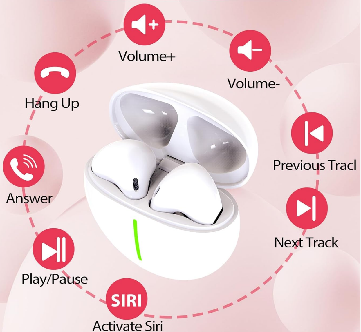
Image: A diagram illustrating the various touch controls for the MoreJoy M2 Mini earbuds, including volume adjustment, track skipping, call management, and Siri activation.