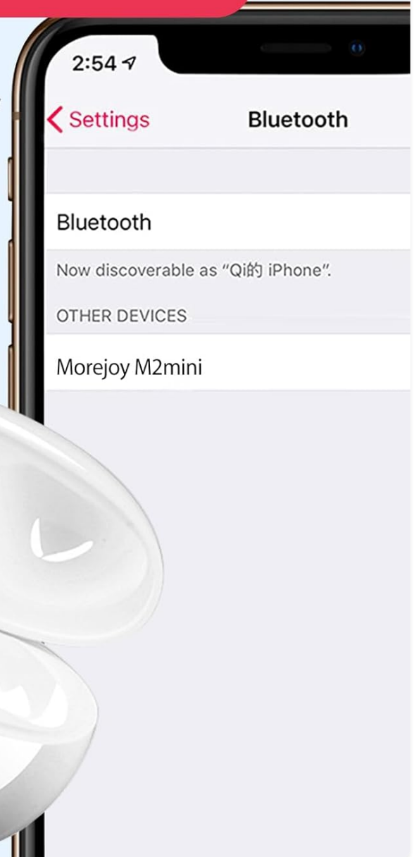
Image: A smartphone screen showing "Morejoy M2mini" in the Bluetooth device list, next to the open charging case with earbuds, demonstrating the one-step pairing process with Bluetooth 5.3.