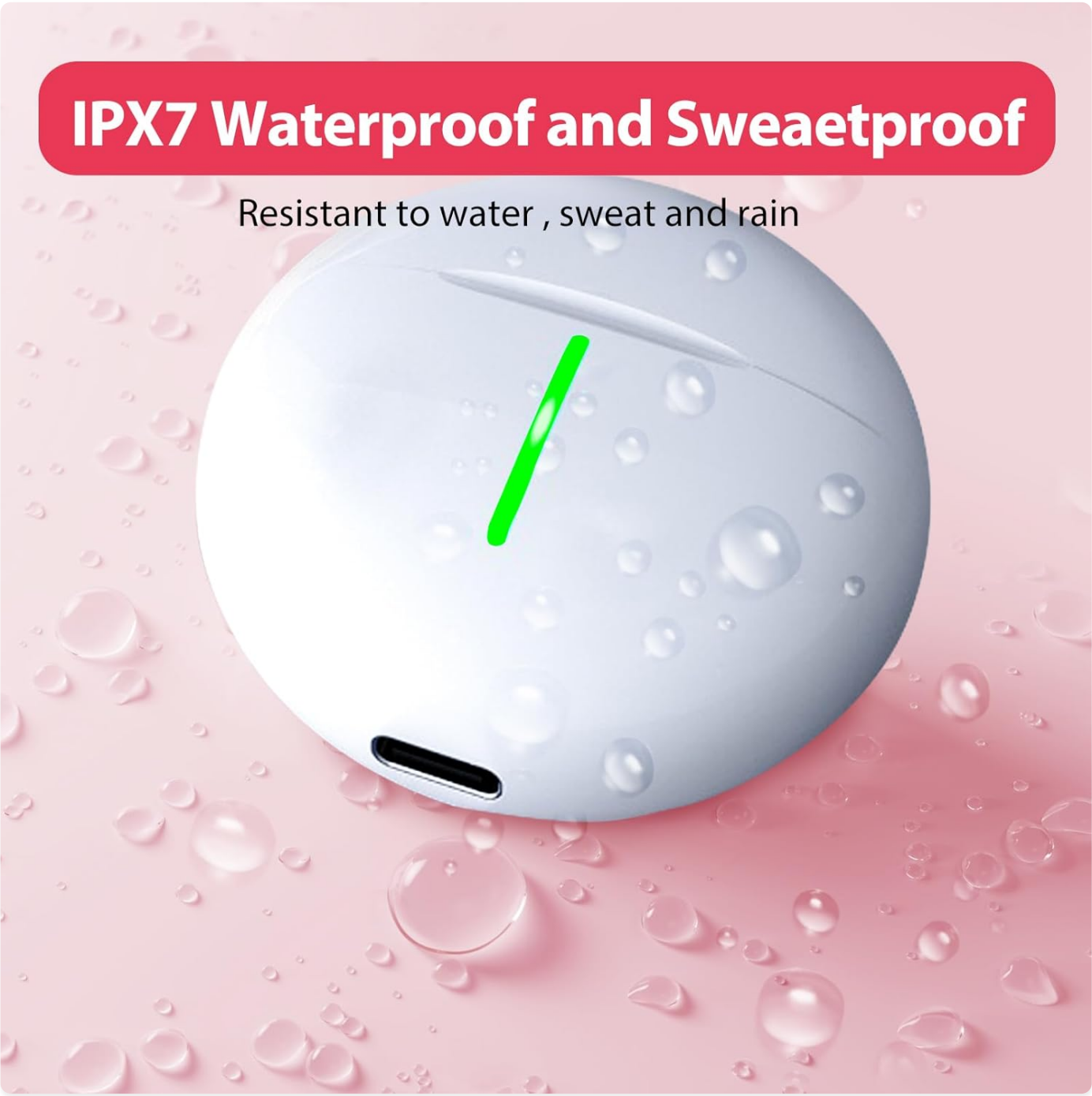
Image: The MoreJoy M2 Mini charging case with water droplets, illustrating its IPX7 waterproof and sweatproof capabilities. The MoreJoy M2 Mini earbuds are rated IPX7 waterproof, meaning they are resistant to splashes, sweat, and rain. This makes them ideal for workouts and outdoor activities.