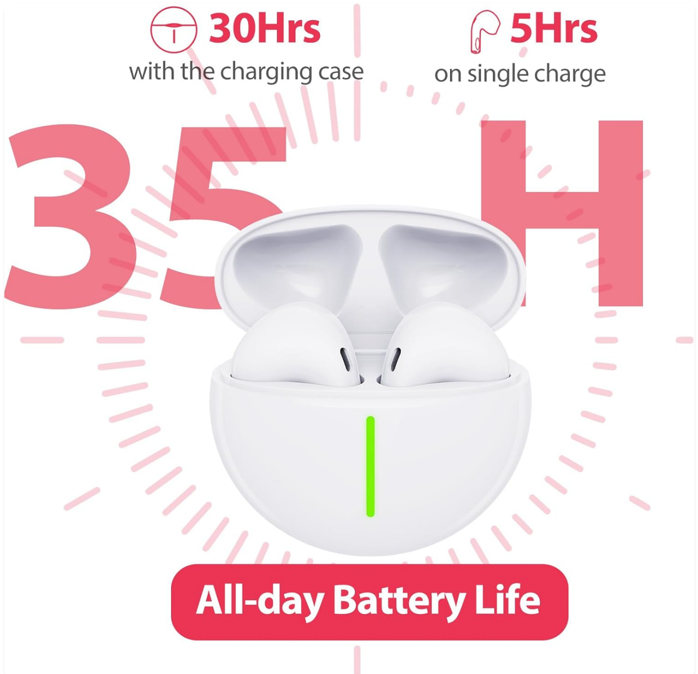
Image: The MoreJoy M2 Mini charging case with earbuds inside, illustrating the 35-hour total battery life (5 hours for earbuds, 30 hours from case).