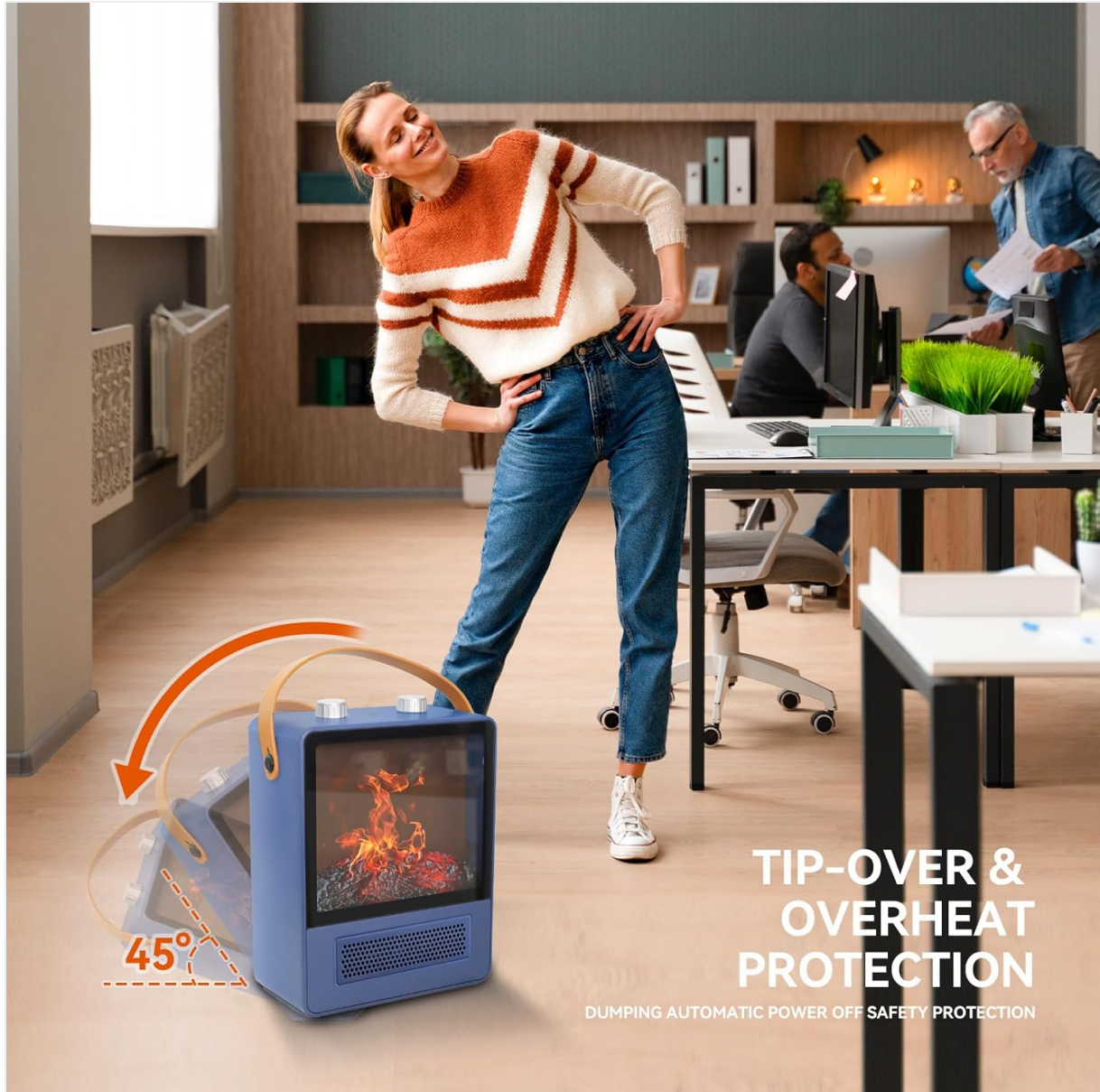
Figure 2.1: The heater features a tip-over protection mechanism, automatically shutting off if tilted beyond 45 degrees for enhanced safety.