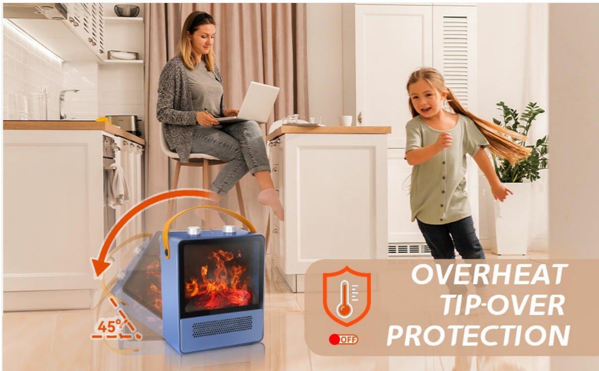
Figure 3.2: Close-up of the control switch, realistic 3D flame, and the portable handle.