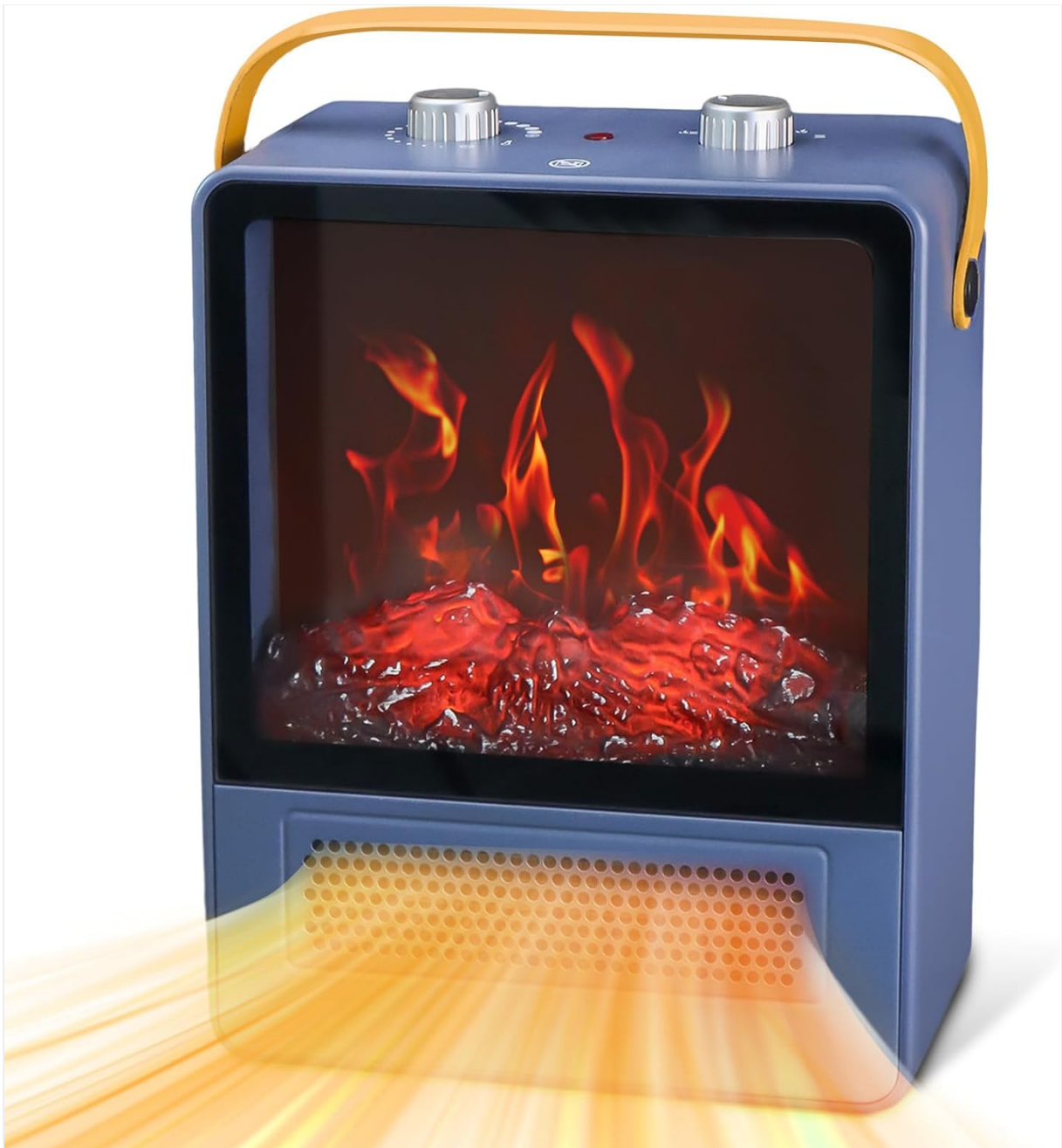
Figure 1.1: TEMPWARE TWFP10 Electric Fireplace Heater, showcasing its compact design and realistic flame effect.