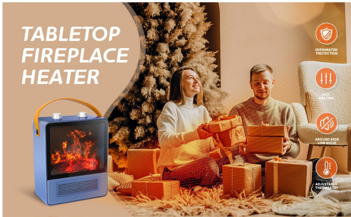
Figure 5.2: The heater's versatility across different room types and its four customizable modes.