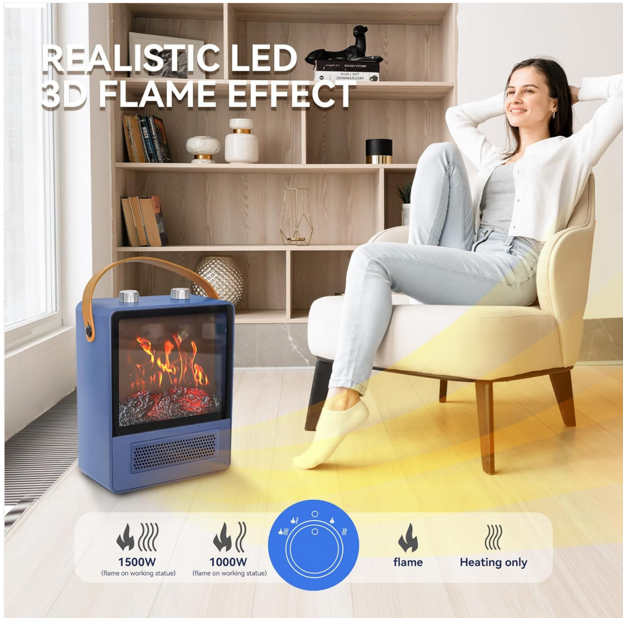
Figure 5.1: Illustration of the four available heating modes: 1500W, 1000W, flame only, and heating only.

Use the Temperature Control Knob to adjust the desired room temperature. The heater will cycle on and off to maintain the set temperature.