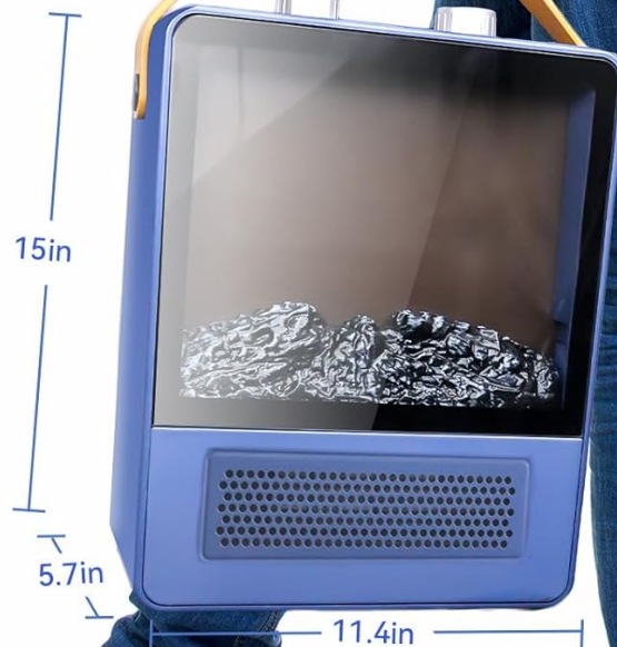
Figure 4.1: The compact size and integrated handle make the heater easy to move and position in various rooms.