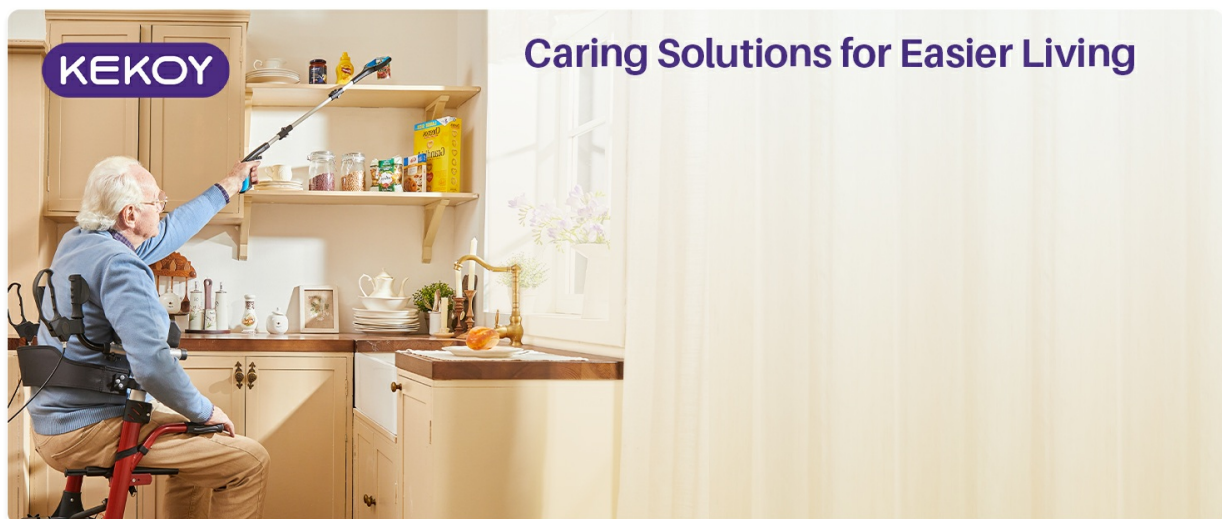
Image: An elderly man comfortably reaching for an item on a high kitchen shelf using the Kekoy grabber tool, demonstrating extended reach.

The Kekoy 36-inch Grabber Reacher Tool is designed to extend your reach, making it easier to pick up items from high shelves, the floor, or hard-to-reach areas. Its foldable design and robust construction make it a versatile aid for daily tasks, especially beneficial for seniors, individuals recovering from surgery, or those with limited mobility.