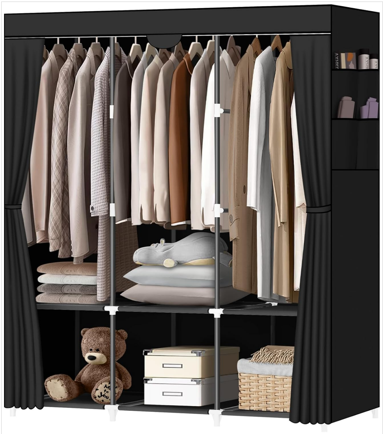
Image 1.1: The LOKEME Portable Closet, Model PWC0005-black, fully assembled and in use.