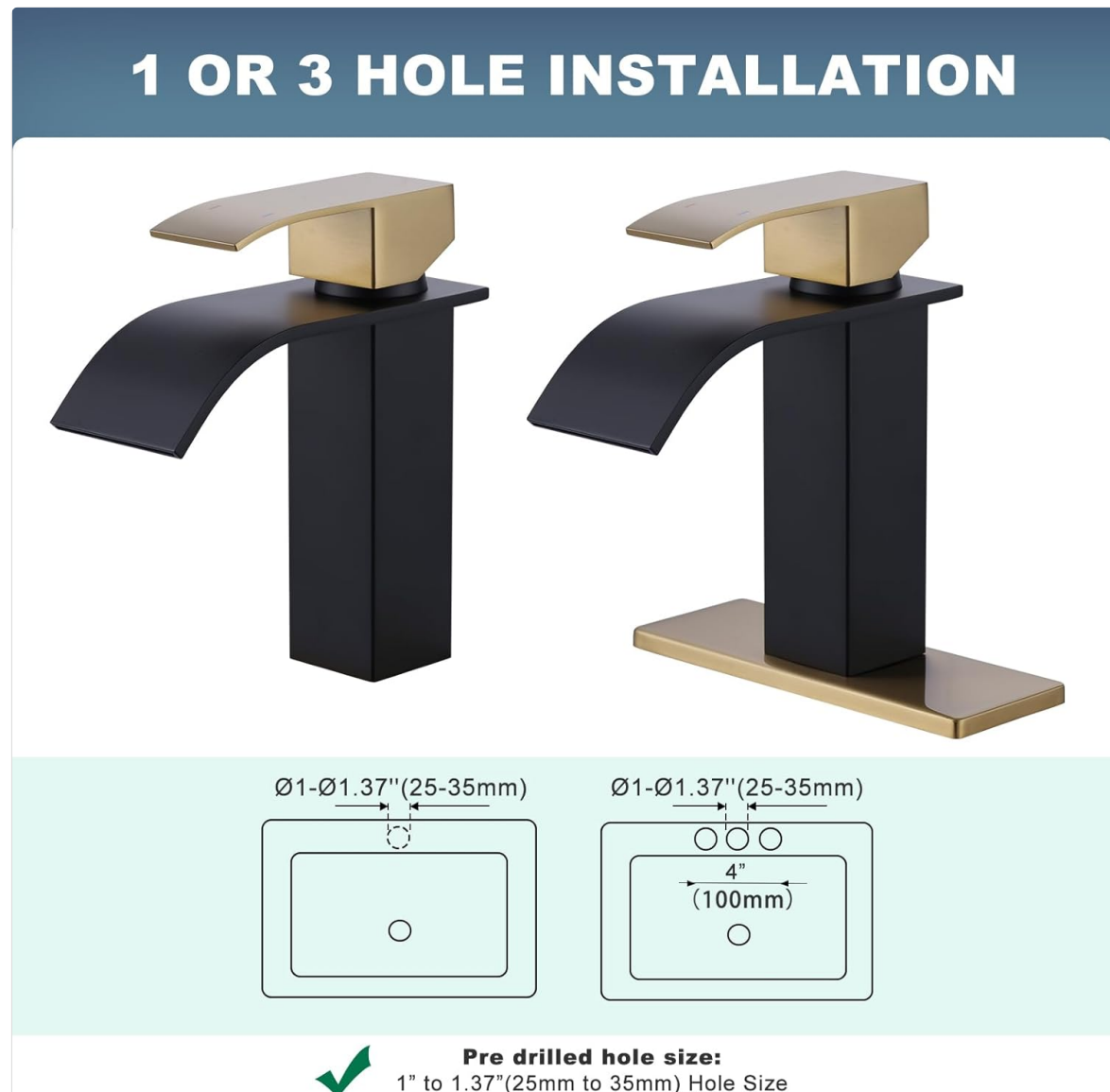
Figure 4.1: 1-Hole or 3-Hole Installation Options

Video 4.1: Installation overview of the ARCORA Gold Bathroom Faucet, showing unboxing, removal of old faucet, and placement of the new faucet and deck plate.