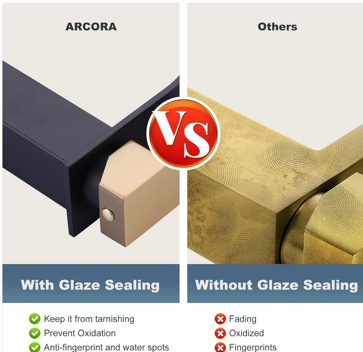
Figure 6.1: Benefits of Glaze Sealing on ARCORA Faucets