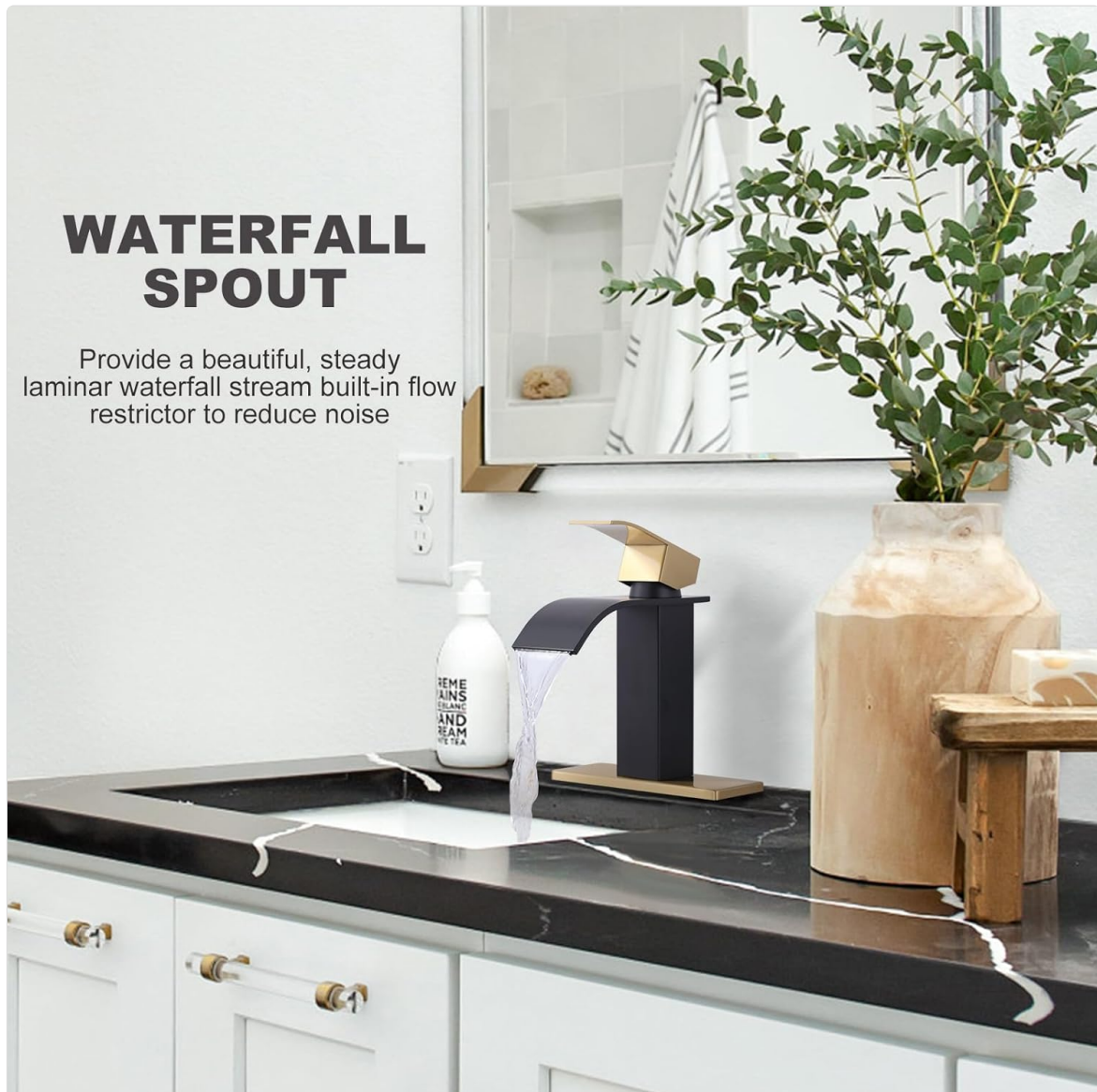
Figure 5.1: Waterfall Spout in Operation