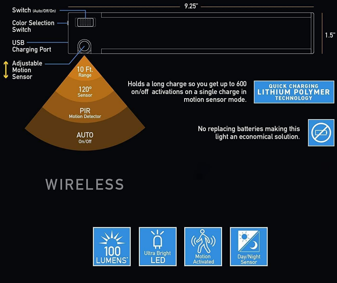
Image: Detailed diagram of the Slim Beam+ light, illustrating its features, controls, and dimensions.