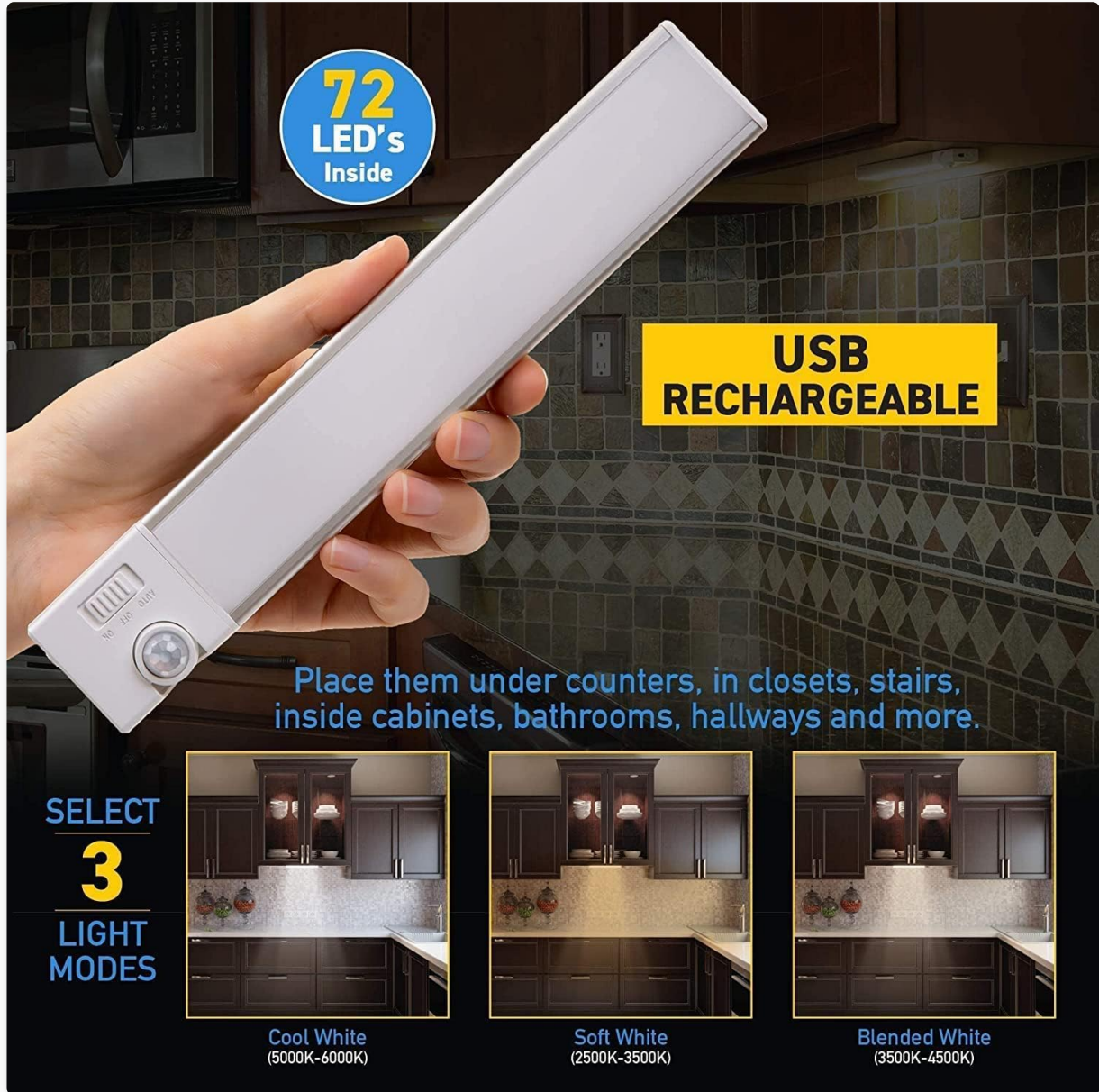
Image: Close-up of the Slim Beam+ light, illustrating the USB charging port and the three selectable light modes.

The motion sensor can be pivoted up to 90 degrees to optimize its detection area. Gently rotate the sensor housing to direct it towards the area where motion detection is desired. This allows for precise control over when the light activates.