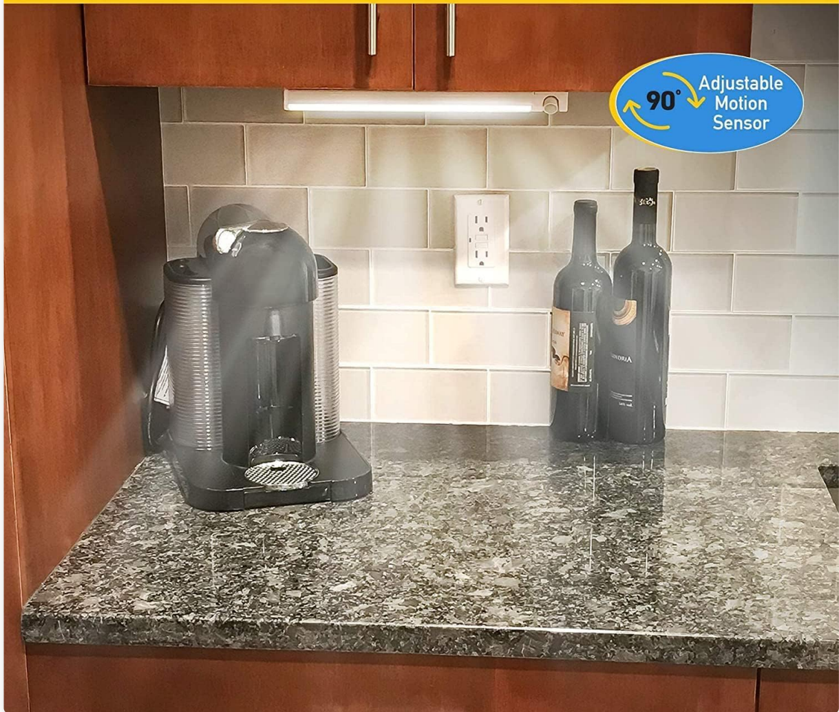
Image: Sensor Brite Slim Beam+ installed under a kitchen cabinet, demonstrating its illumination and the adjustable motion sensor.

QUICK CHARGING LITHIUM POLYMER TECHNOLOGY