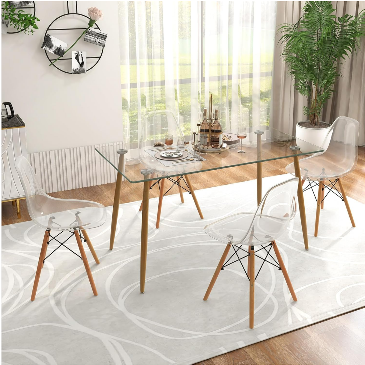
Image: The Tangkula Dining Table Set, featuring a clear glass table and four transparent chairs with wooden legs, arranged in a modern dining space.