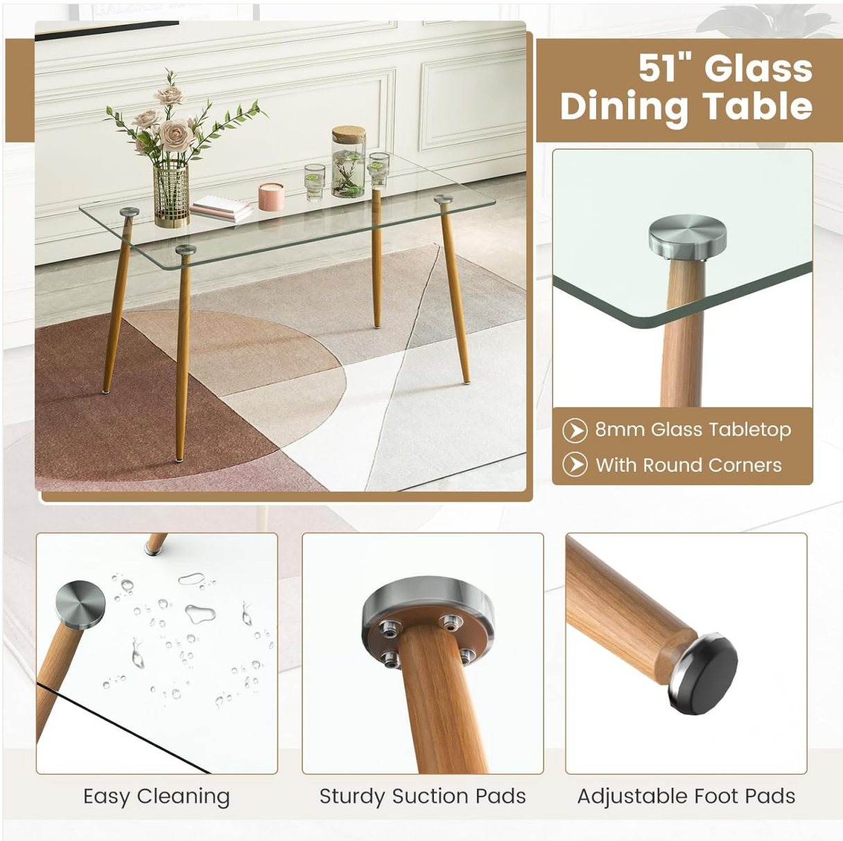
Image: Detailed view of the 0.3-inch thick glass tabletop with round corners, sturdy suction pads connecting the legs, and adjustable foot pads for stability.