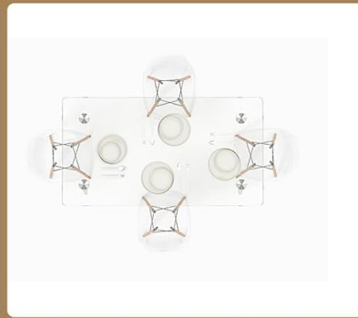
Image: Illustrations demonstrating various chair arrangements around the dining table, highlighting its versatility and space-saving capabilities.