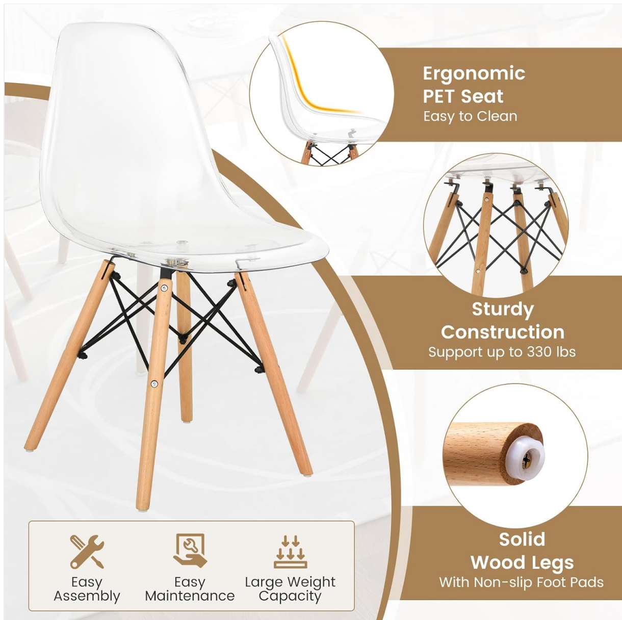
Image: A close-up showing the ergonomic PET seat, the sturdy construction of the chair base, solid wood legs, and non-slip foot pads.