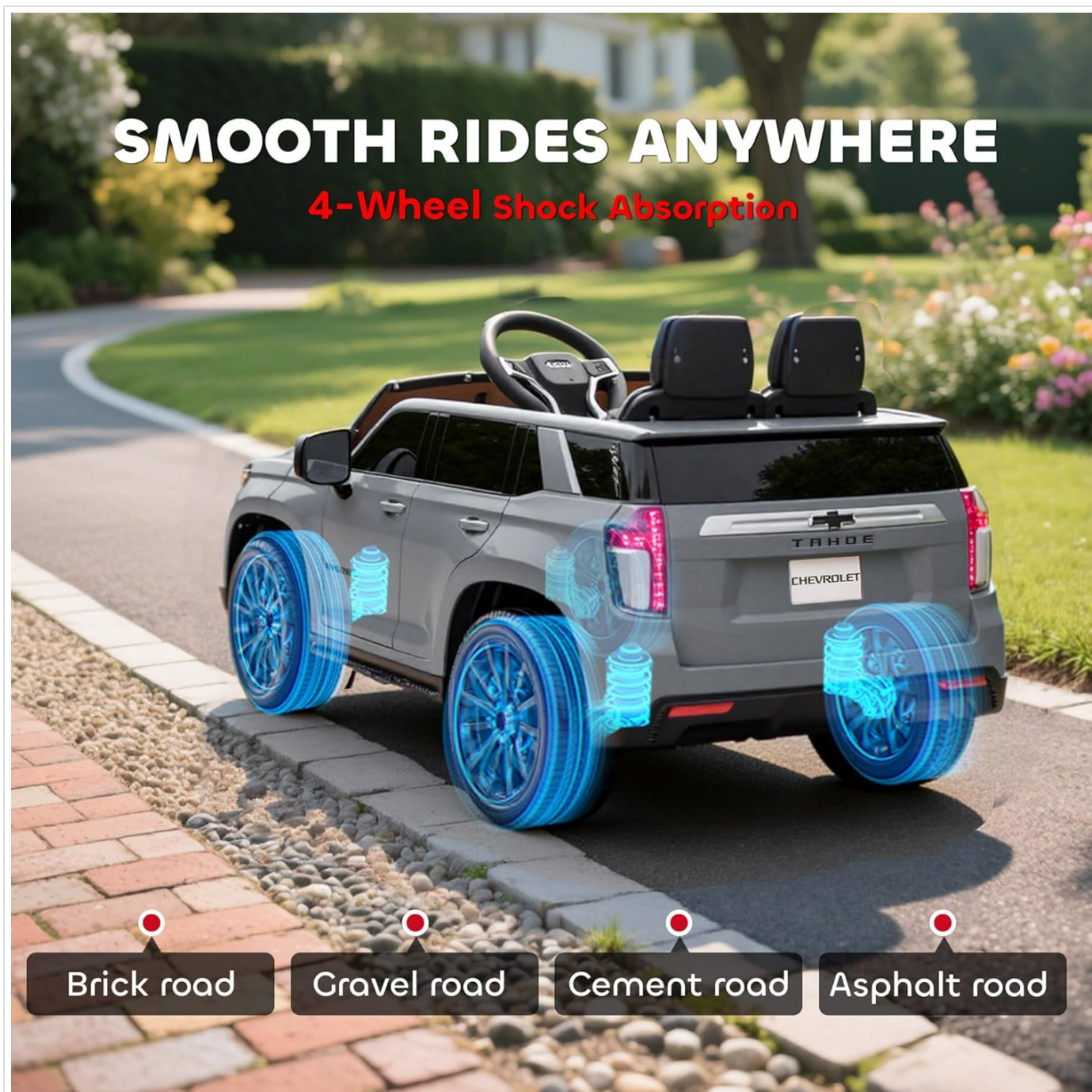
Figure 6: Visual representation of the 4-wheel shock absorption system for a smoother ride.