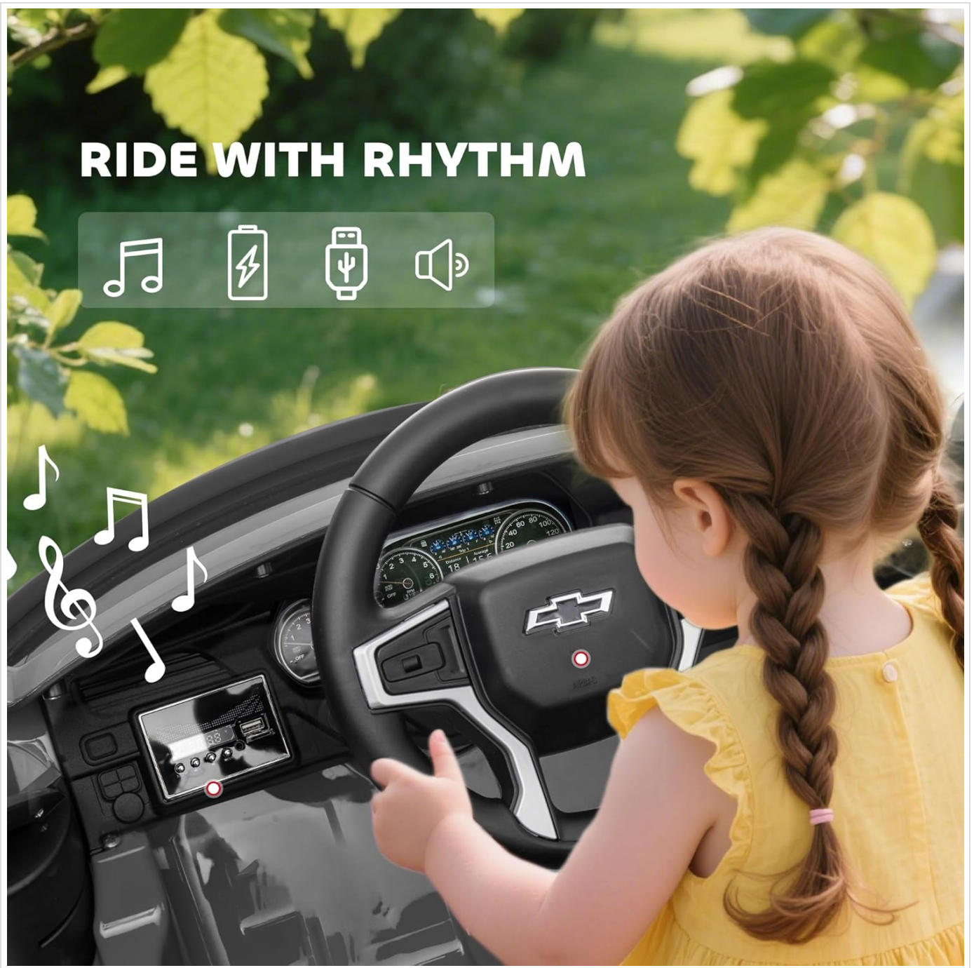
Figure 5: Close-up of the dashboard showing the music controls and other interactive elements.