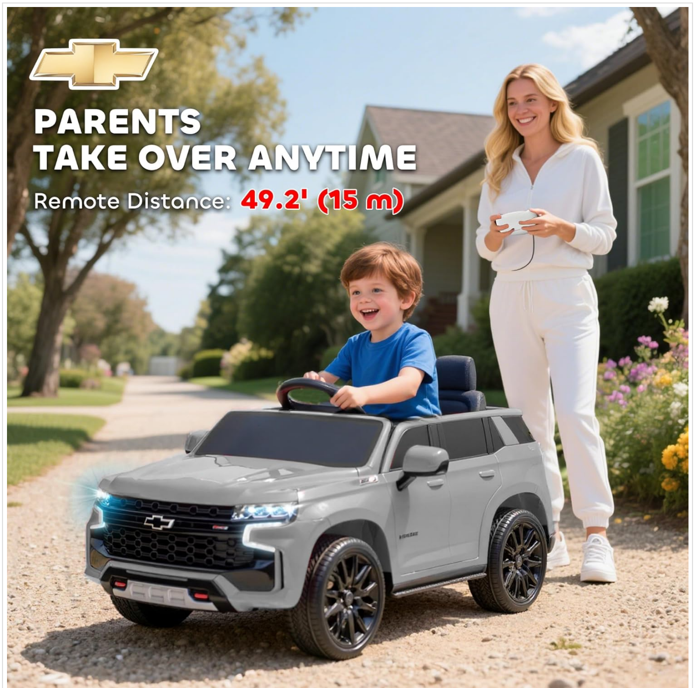
Figure 4: A parent operating the ride-on car using the remote control, demonstrating the parental override feature.