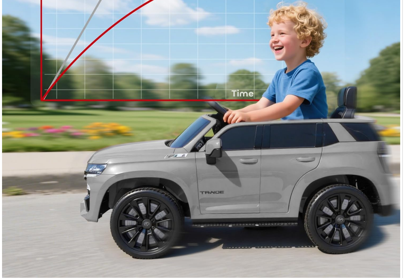
Figure 3: Illustration of the soft start feature, showing a gradual increase in speed compared to a sudden start.