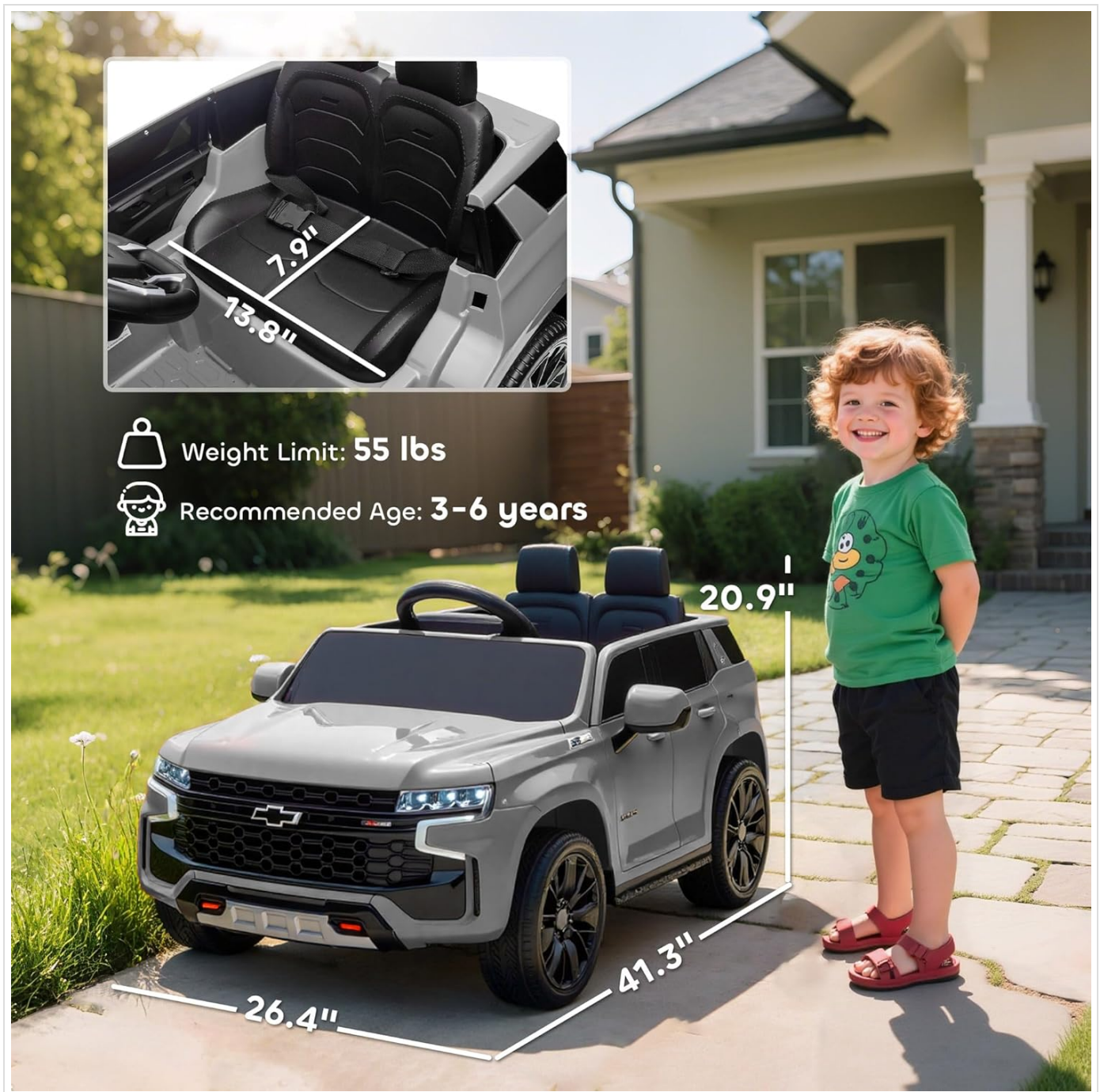
Figure 2: Product dimensions, useful for understanding the vehicle's size and fit for storage or transport.