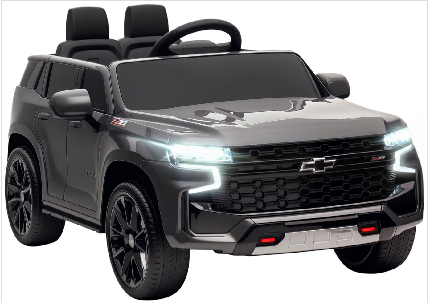
Figure 1: Fully assembled Aosom Licensed Chevrolet Tahoe Ride On Car.

Assembly is required before first use. Please follow the detailed instructions provided in the separate assembly guide to ensure all components are correctly and securely attached. Pay close attention to wheel installation and electrical connections.