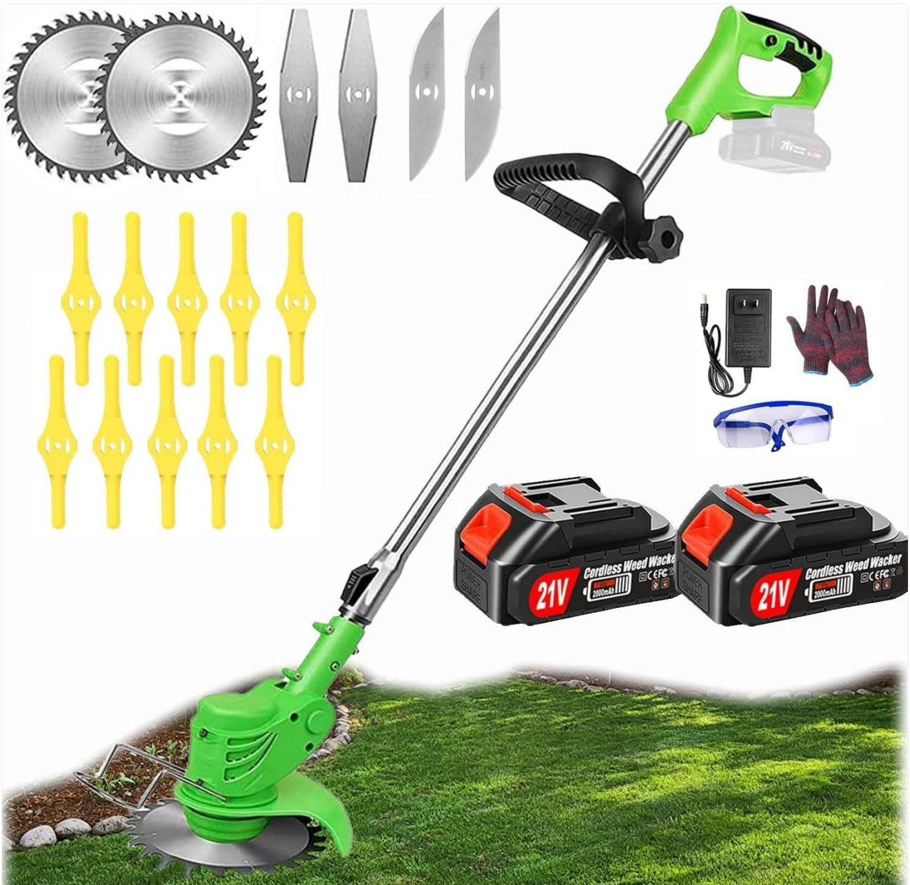
Image: The ZREBZYR Cordless Weed Wacker shown with its various components and accessories, including different blade types, batteries, charger, gloves, and safety goggles.