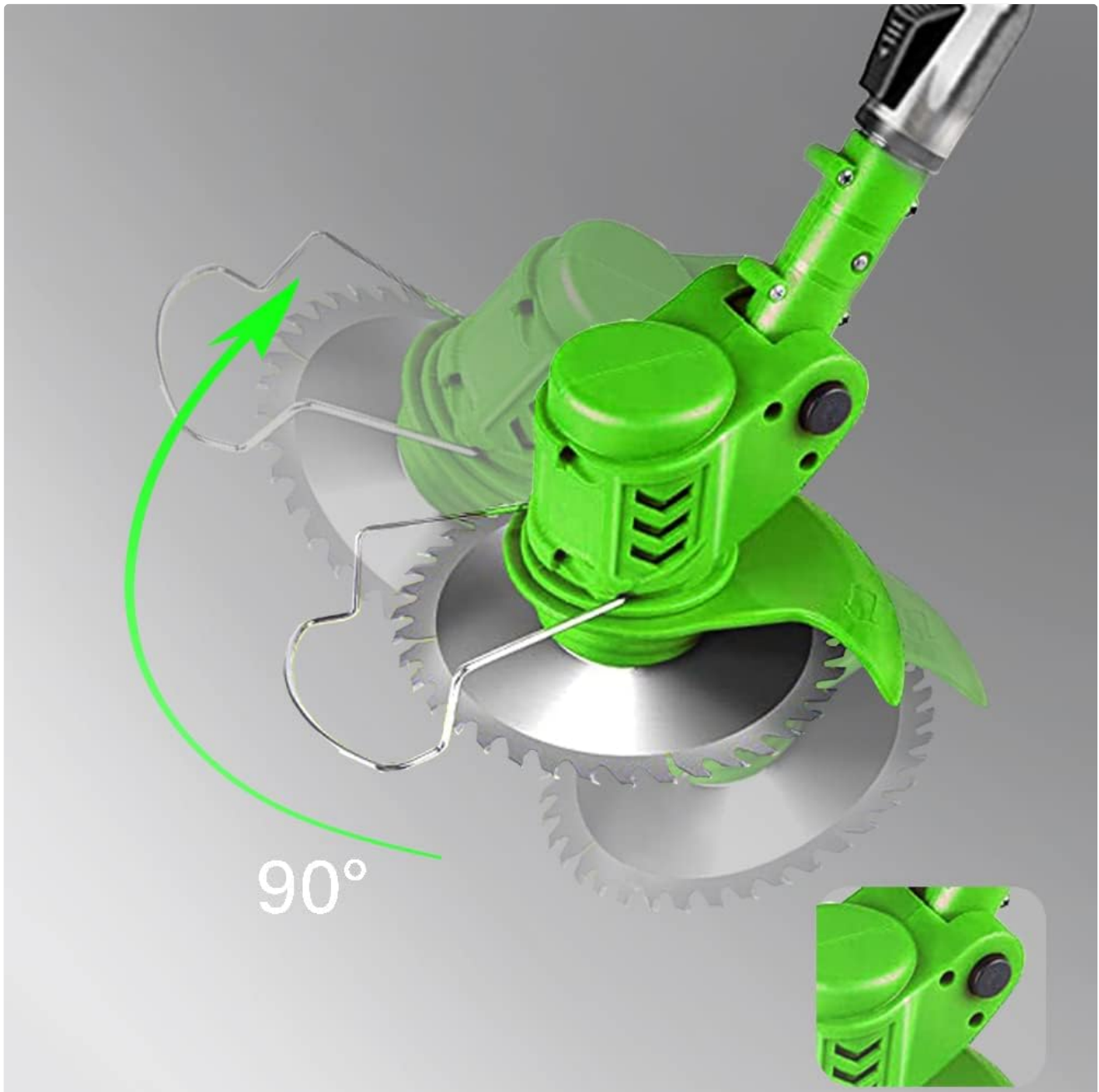
Image: Close-up view of the cutting head demonstrating its ability to pivot 90 degrees for versatile trimming and edging.

Image: Illustration of the weed wacker's adjustable shaft, showing how it can be extended or retracted to suit different user heights.