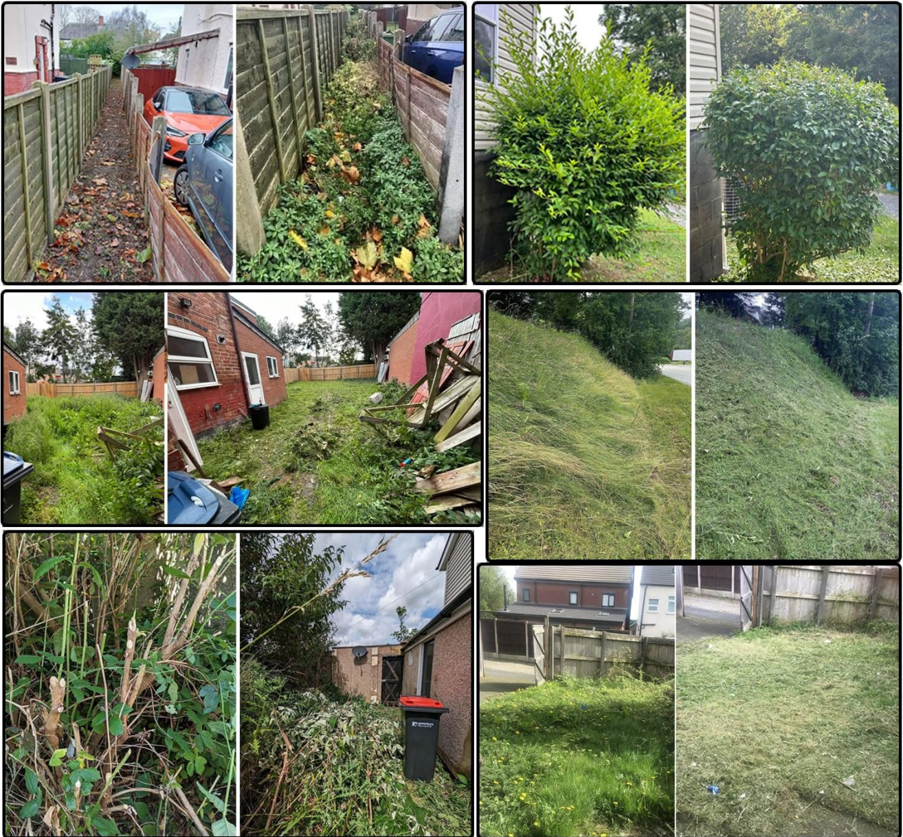
Image: A collage of before and after photos illustrating the significant clearing capabilities of the weed wacker in overgrown areas.